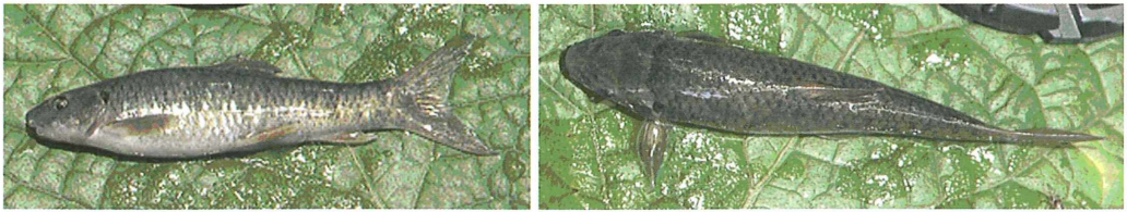
Fig. 2: Garra chebera , live specimen with fresh coloration from type locality, south western Ethiopia, Womba basin, 65.6 mm SL A) lateral view (note the dark spot behind operculum) B) dorsal view.

tebrae plus caudal vertebrae. Generally precaudal vertebrae are defined as vertebrae without closed haemal arches (ROJO 1991). But this definition is imprecise. The parapophysis of the penultimate and/or ultimate vertebrae may be joined by a bony bridge which forms a narrow arch, but their ends not joined. This type of precaudal vertebra is termed “intermediate vertebra” by BOGUTSKAYA & KOMLEV (2001) and is characterised by a narrow canal surrounding the caudal artery but not the caudal vein (AHNELT & DUCHKOWITSCH 2004). We define the first caudal vertebra as a vertebra with closed hemal arch plus hemal spine. Additionally we also give the number of the predorsal vertebrae. In our vertebral formula we follow BOGUTSKAYA & KOMLEV (2001) who refer to the total number of vertebrae followed by the number of predorsal vertebrae (in parentheses), the total number of precaudal vertebrae, the number of intermediate vertebrae (in parentheses) plus the total number of caudal vertebrae.