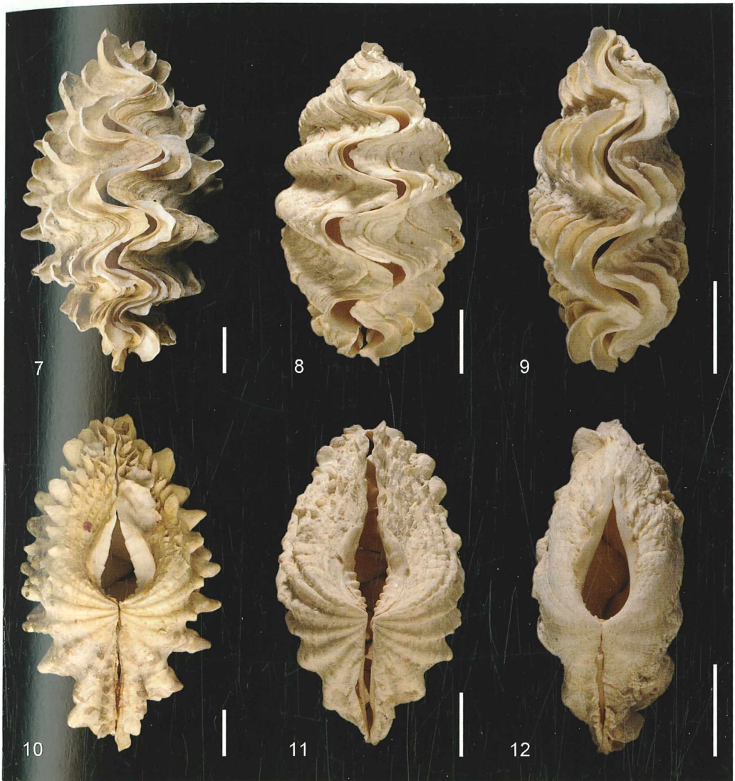
Figs. 7–12. Comparison of the three Tridacna species from the Red Sea in the collection of the NHMW; top: radial folds; bottom: byssal orifice. 7, 10, Tridacna squamosina – paralectotype, NHMW Moll. 107076a from Dahab; 8, 11, Tridacna cf. squamosa – NHMW Moll. 38076 from Nawibi; 9, 12, Tridacna maxima – NHMW Moll. 38077 from Shadwan. Scalebar: 2 cm.

STURANY (1899) recognized three Red Sea taxa. He clearly used the monograph of REEVE (1862) on Tridacna as an identification guide. He identified elongata correctly. Sturany's elongata conforms to T. elongata LAMARCK, 1819. But in the 1950s and 1960s it was recognized that Lamarck's elongata is a junior synonym of Tridachnes maxima RÖDING, 1798. Tridacna maxima (RÖDING, 1798) is today recognized as valid, earliest name for this widely distributed species.