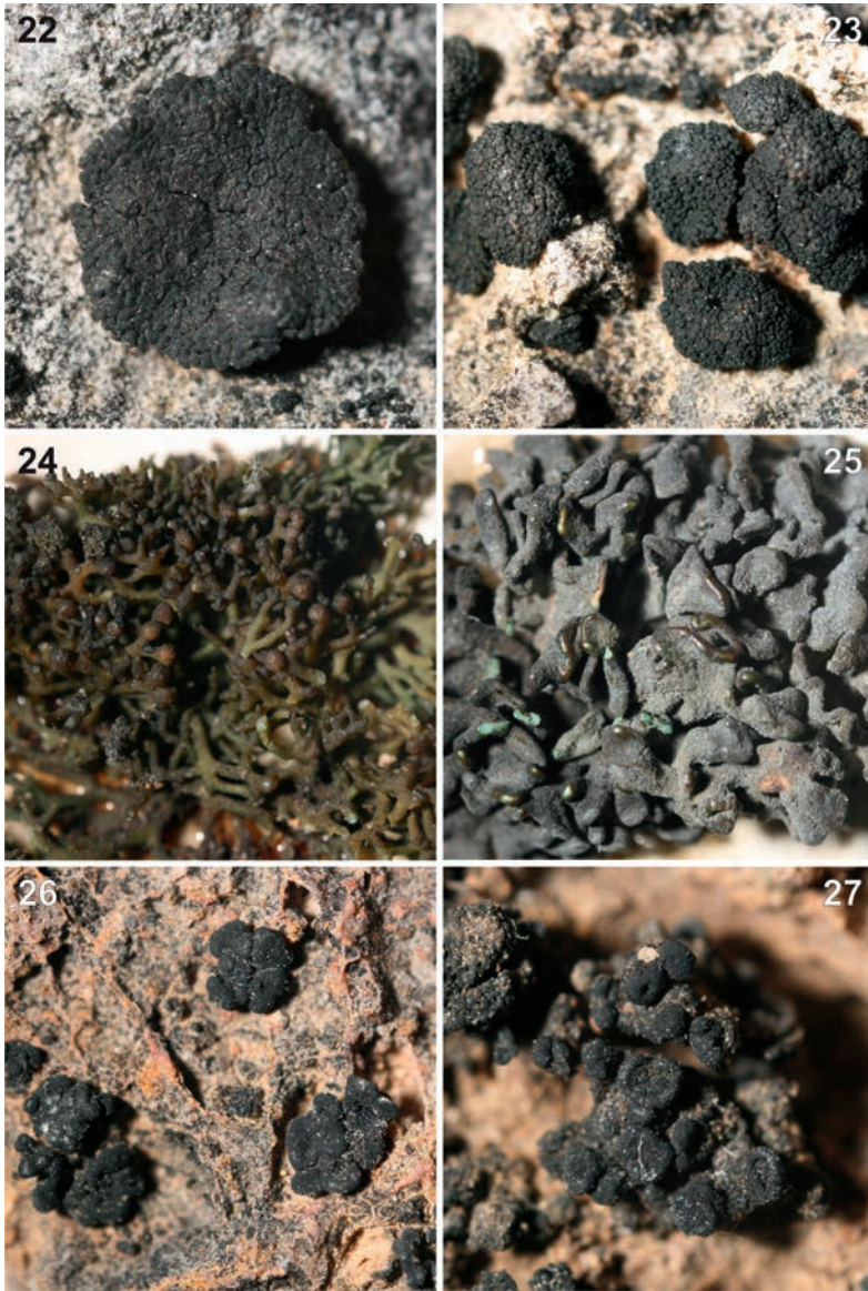
Plate 5: Fig. 22: Thyrea myriocarpa ZAHLBR. (= Paulia m. (ZAHLBR.) HENSSEN). Lectotype. Thallus squamulose-peltate with regularly tessellate surface, plane. Section 3.9 mm. Fig. 23: Thyrea schroederi ZAHLBR. (= Paulia s. (ZAHLBR.) HENSSEN). Holotype. Thallus squamulose-peltate, roughly tessellate, convex. Section 6.0 mm. Fig. 24: Omphalaria wrightii TUCK. (= Paulia w. (TUCK.) TRETJACH & HENSSEN). Isolectotype. Thallus fruticose, branchings repeatedly furcate, apothecia terminal. Section 7.8 mm. Fig. 25: Corynophorus coralloides A.MASSAL. (= Peccania c. (A.MASSAL.) A.MASSAL.). Isolectotype. Thallus foliose-fruticose, lobes gray pruinose, deeply branched, ascending. Section 8.0 mm. Fig. 26 & 27: Omphalaria pulvinata var. teretiuscula FLAG. (= Peccania t. (FLAG.) HENSSEN). Isolectotype. Fig. 26: Thallus small squamulose-peltate, sparingly lobulate. Section 5.9 mm. Fig. 27: Terminal apothecia of mature thallus with \pm erect, subcylindrical lobes. Section 7.2 mm.