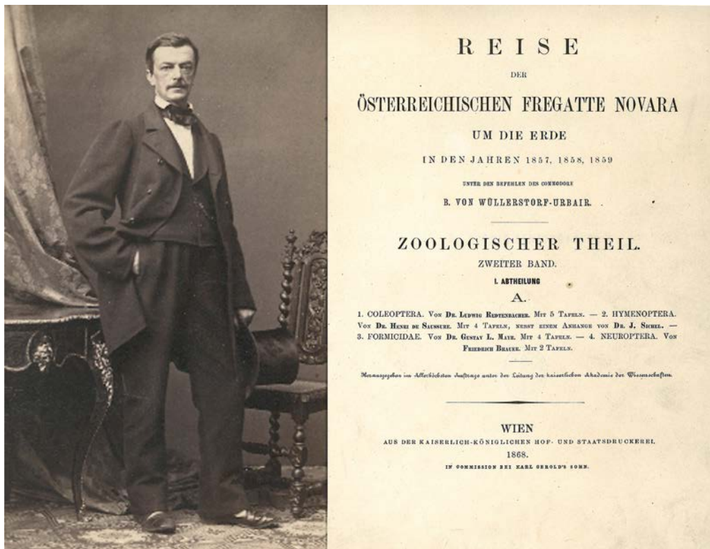
Fig. 1: The Austrian coleopterist Ludwig Redtenbacher (1814–1876) in 1862, and the title page of his only contribution containing new species of Neotropical dung beetles, the 1868 Coleoptera portion of the "Reise der österreichischen Fregatte Novara um die Erde" (photo by courtesy of Editha Schubert, Senckenberg Deutsches Entomologisches Institut, Müncheberg, Germany; title page NHMW library).

collected by a number of Austrian world exploratory expeditions: In 1843, he published the Coleoptera portion of the geologist Joseph Russeger's (1802–1863) report of his expedition through Greece, Anatolia, Egypt, and Syria (REDTENBACHER 1843b). In collaboration with Vincenz Kollar, he also studied the insects collected by the botanists and explorers Carl von Hügel (1796–1870) in Kashmir and the Himalayas (KOLLAR & REDTENBACHER 1844), and Theodor Kotschy (1813–1866) in Syria (KOLLAR & REDTENBACHER 1849). Nonetheless, his only contribution to Neotropical dung beetles was his study of the Coleoptera material gathered during the circumnavigation of the globe by the Austrian frigate SMS Novara (REDTENBACHER 1868).