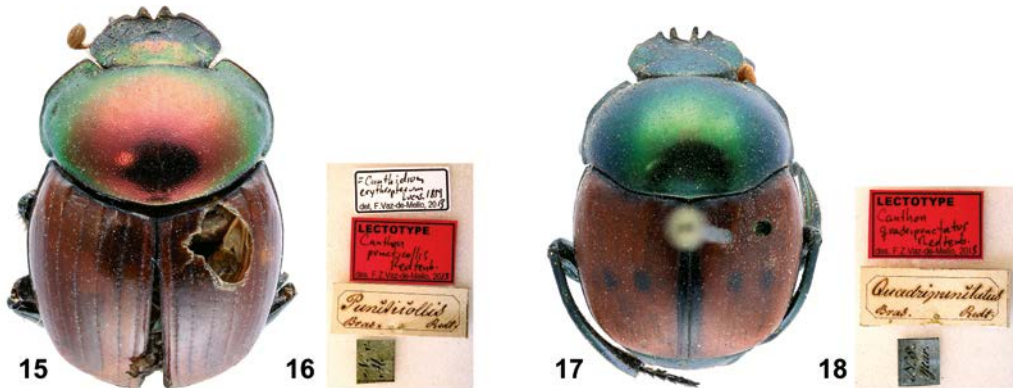
Figs. 15–18: (15–16) Lectotypes of Canthon puncticollis REDTENBACHER, 1868, and (17–18) Canthon quadripunctatus REDTENBACHER, 1868.

as a new senior synonym of Canthidium excisipes BALTHASAR, 1939. The holotype of C. excisipes was found by us at the National Museum (Natural History), Prague, Czech Republic, and detailed information on it can be found at the end of this list. Following Article 72.7 of the Code, as the name Canthon punctatus SCHMIDT, 1922 was expressly proposed as a replacement name for C. puncticollis REDTENBACHER, 1868, both names share the same name-bearing type and, therefore, they are objective synonyms, with the younger name being the valid one.