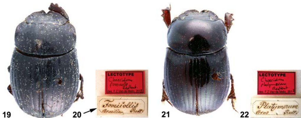
Figs. 19–22: (19–20) Lectotypes of Choeridium foveicolle REDTENBACHER, 1868, and (21–22) Choeridium platymerum REDTENBACHER, 1868. Arrow indicates label with Redtenbacher's handwriting.

Current status: Junior synonym of Ateuchus squalidus (FABRICIUS, 1775) (synonymized by HAROLD (1868b, p. 62)).