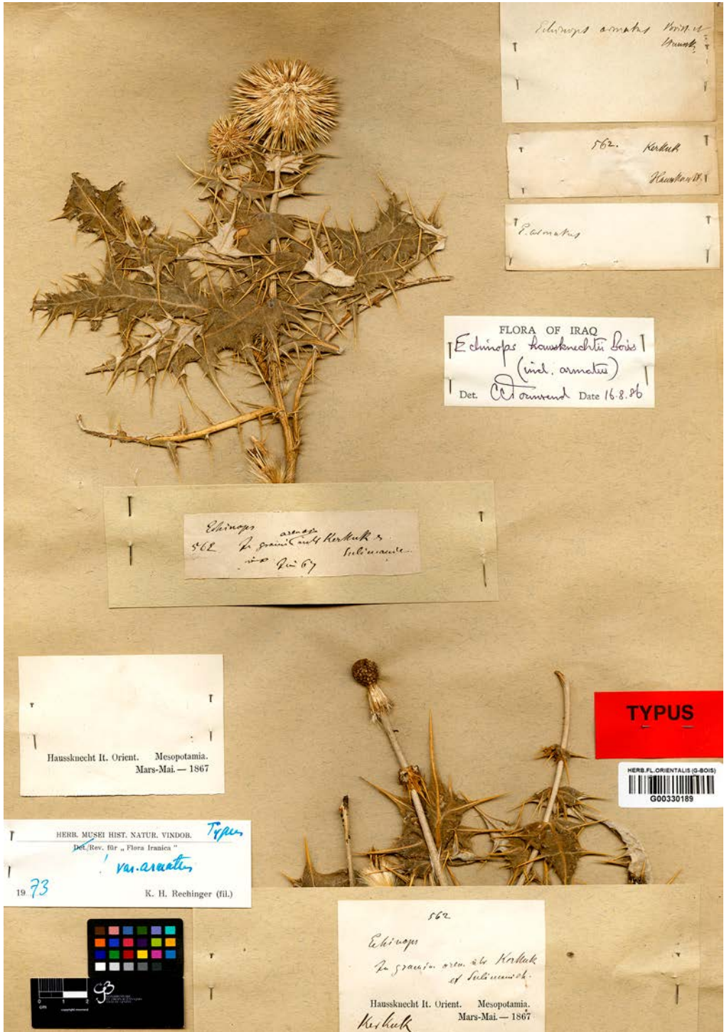
Fig. 1: Echinops rechingeri NEGARESH var. rechingeri [G-BOIS, holotype].