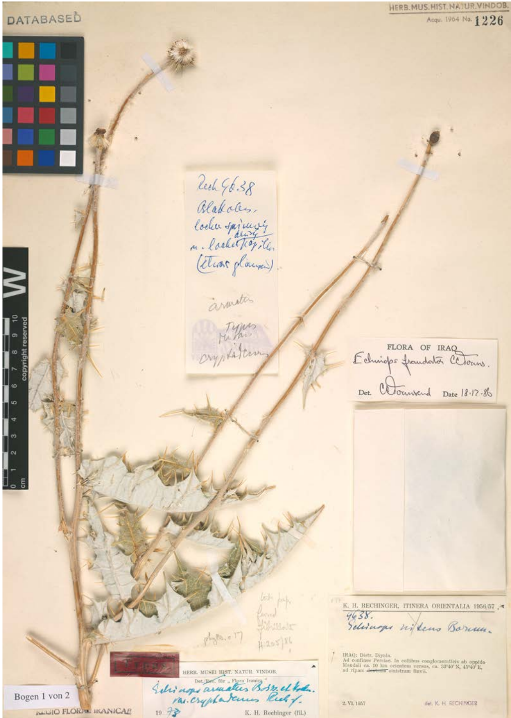
Fig. 2: Echinops rechingeri var. cryptadenus (RECH. f.) NEGARESH [W, holotype].