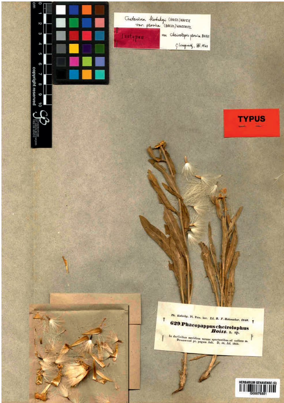
Fig. 1. Lectotype (second-step) of Centaurea kotschyi (BOISS. & HELDR.) HAYEK subsp. persica (BOISS.) GREUTER [G (G00076551)].