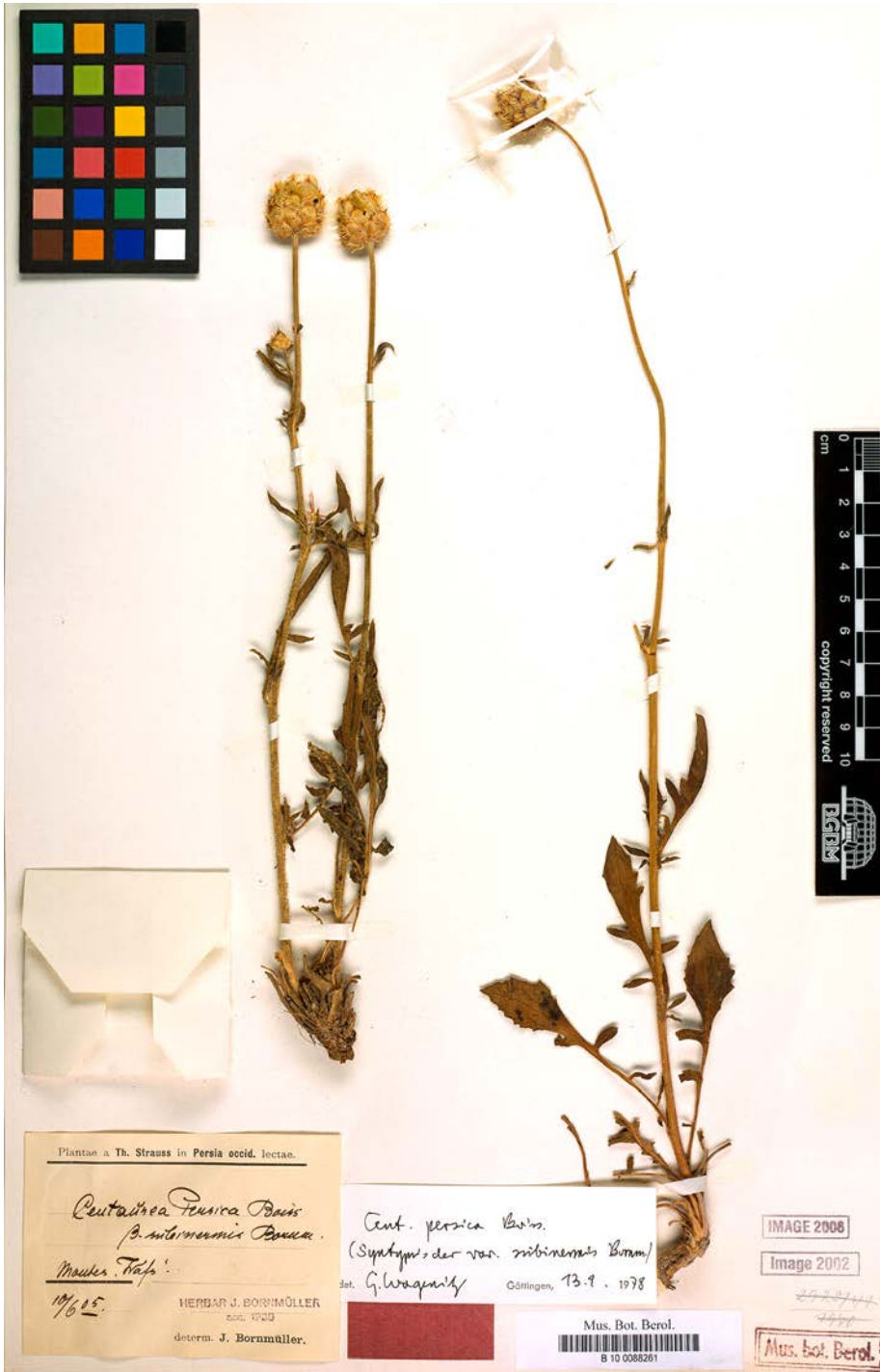
Fig. 4. Lectotype of Centaurea persica var. subinermis BORN. [B (B10 0088261)].