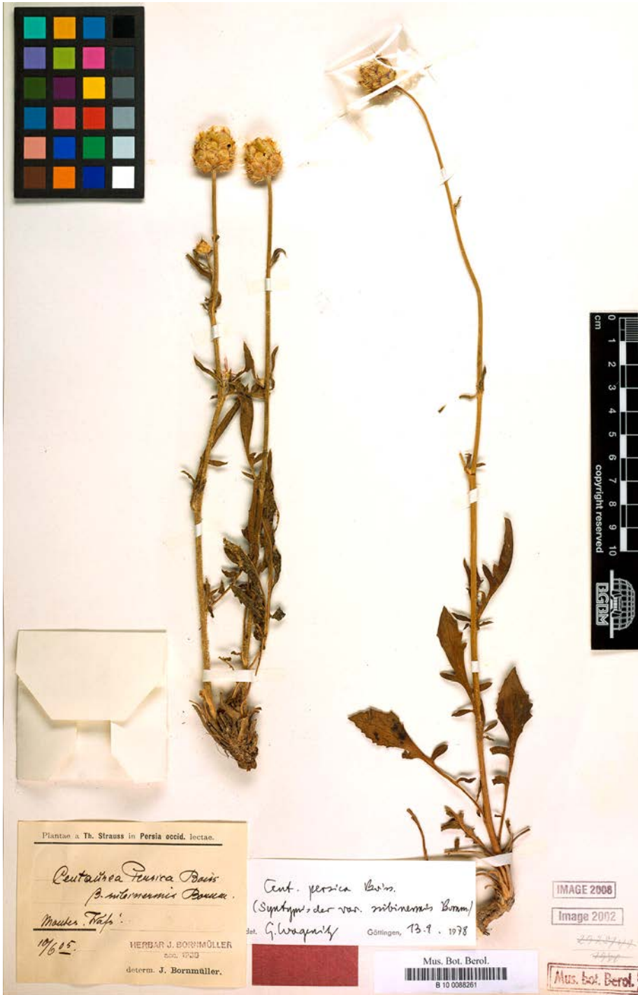
Fig. 4. Lectotype of Centaurea persica var. subinermis BORNM. [B (B10 0088261)].