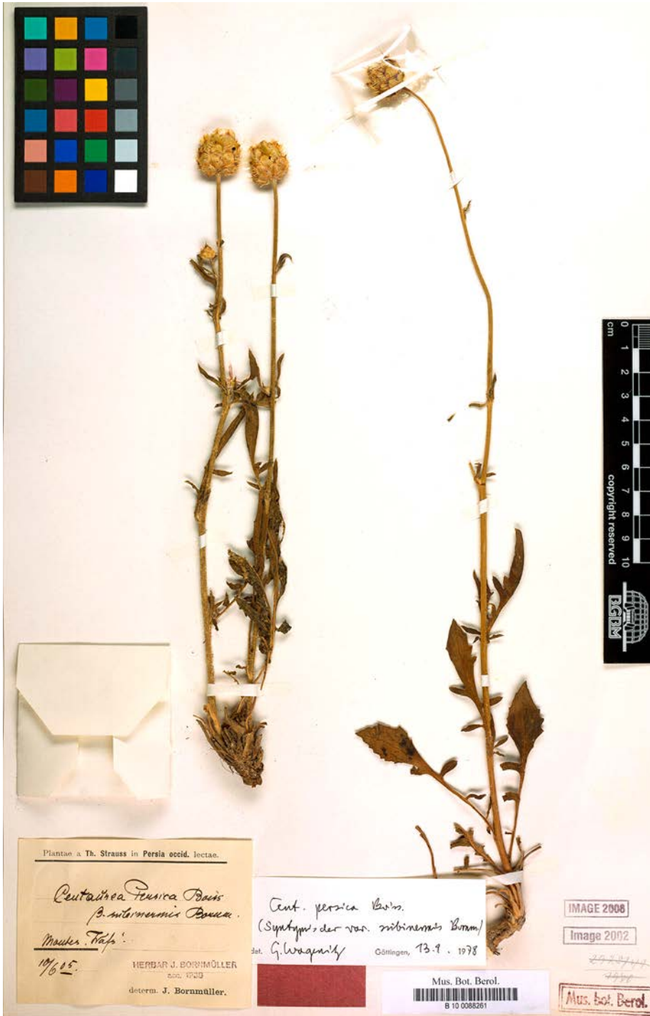
Fig. 4. Lectotype of Centaurea persica var. subinermis BORN. [B (B10 0088261)].