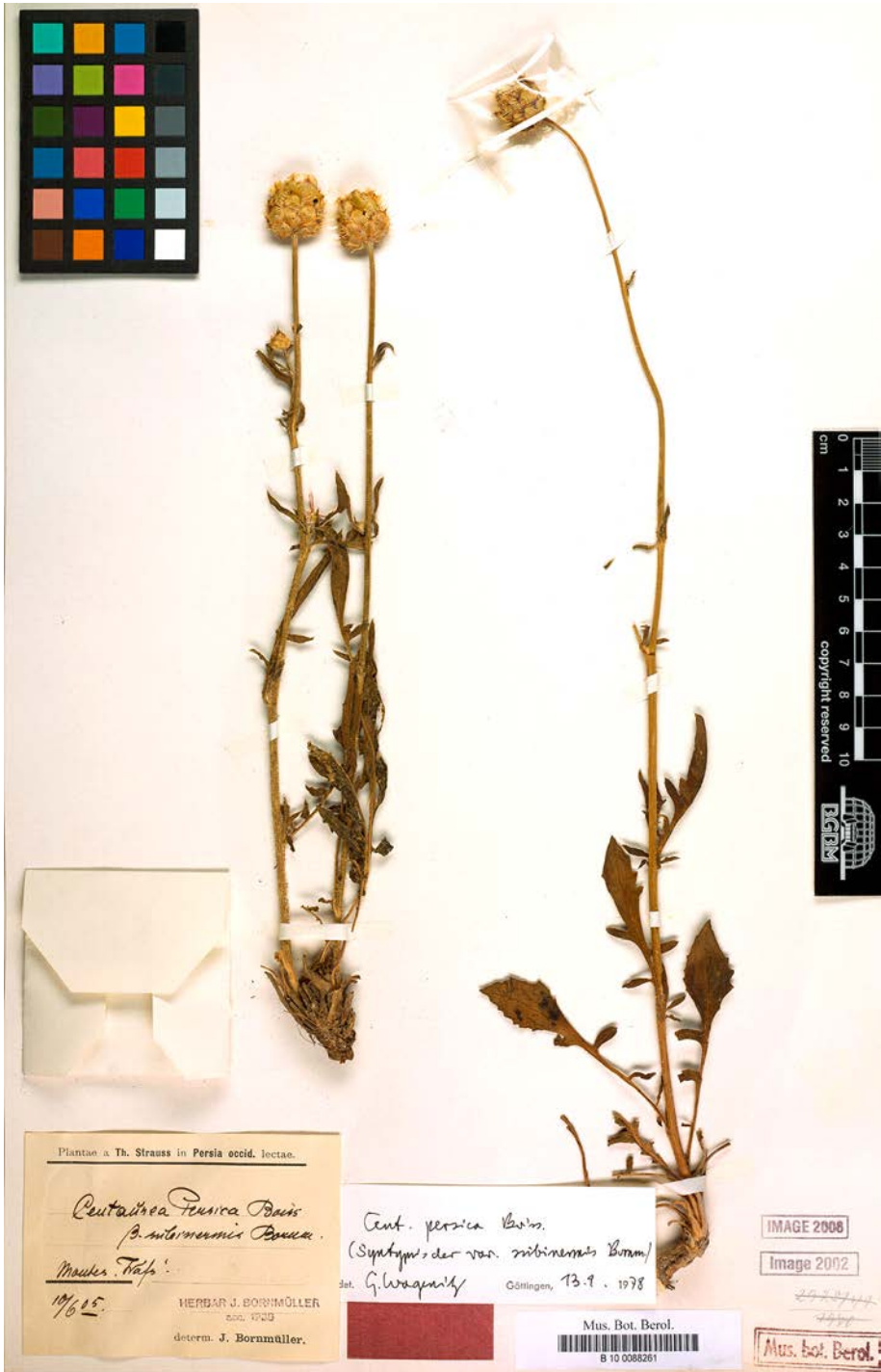
Fig. 4. Lectotype of Centaurea persica var. subinermis BORN. [B (B10 0088261)].