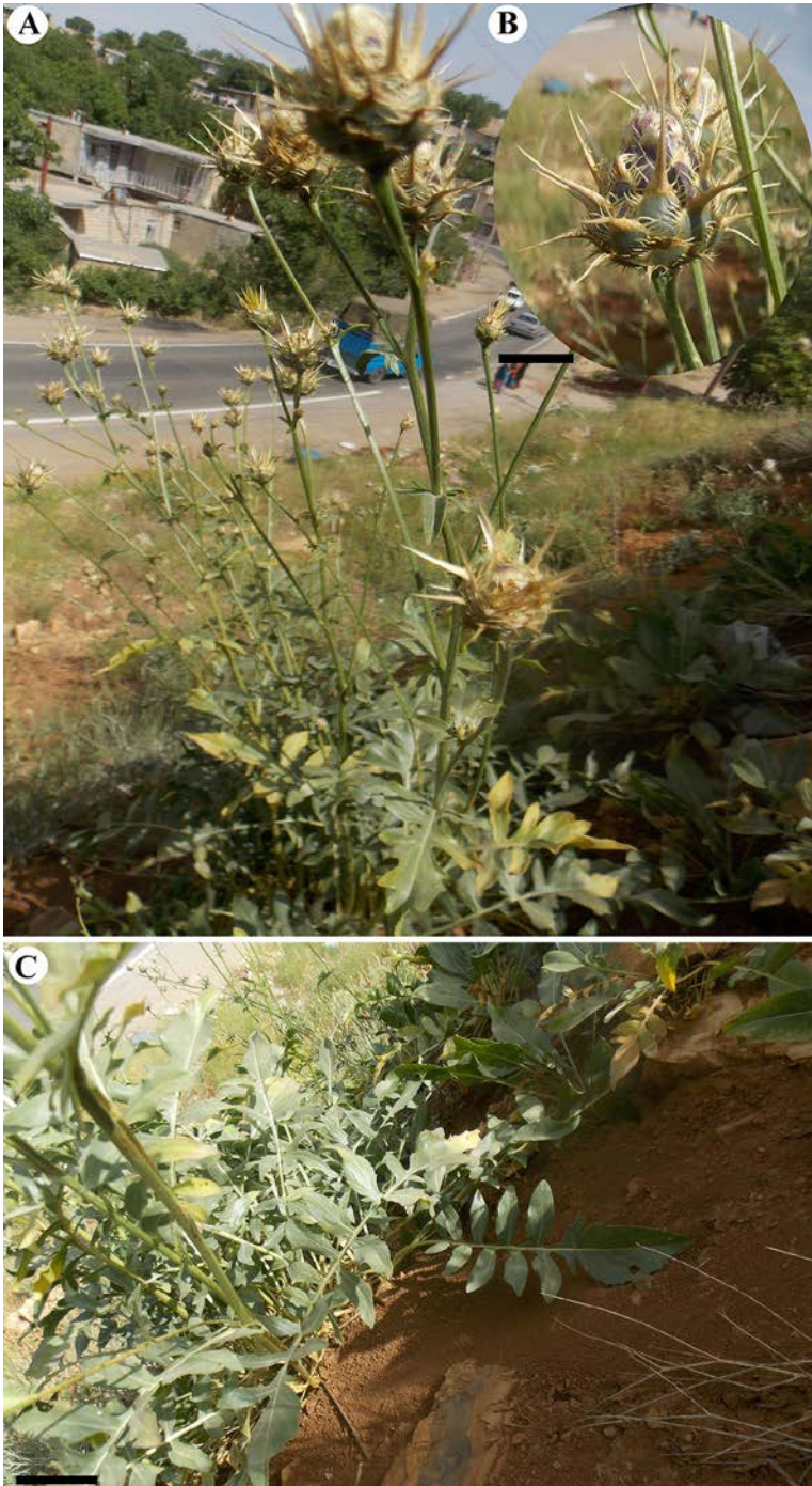
Fig. 7. Centaurea persica var. multijuga : (A) habit and habitat; (B) close up of a capitulum; (C) basal leaves (glabrous). Scale bars B = 1 cm; C = 8 cm. Voucher: Negaresh & Asadbegy 218 [KHAU].