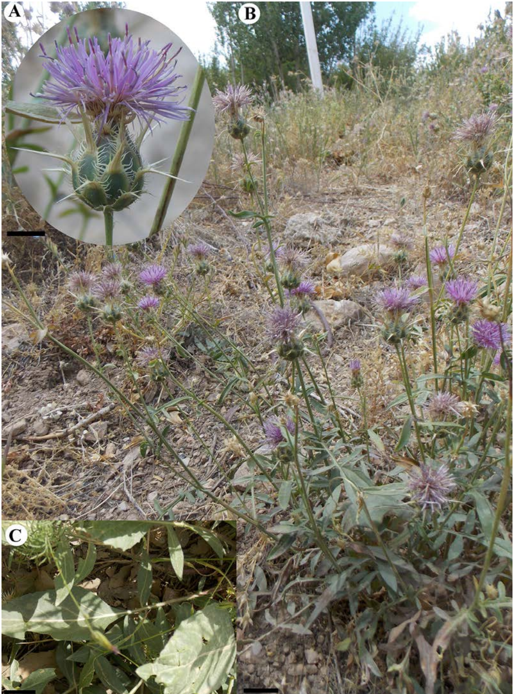
Fig. 2. Centaurea persica var. persica : (A) close up of a capitulum; (B) habit and habitat; (C) basal leaves with pilose indumentum. Scale bars A = 1 cm; B = 3 cm; C = 2 cm. Voucher: Negaresh 500 [KHAU].