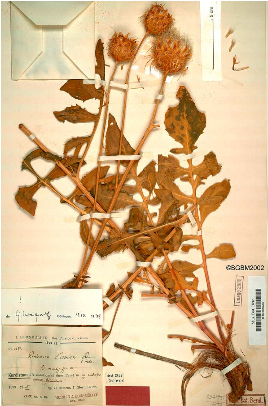
Fig. 6. Lectotype of Centaurea persica var. multijuga BORN. [B (B10 0088260)].