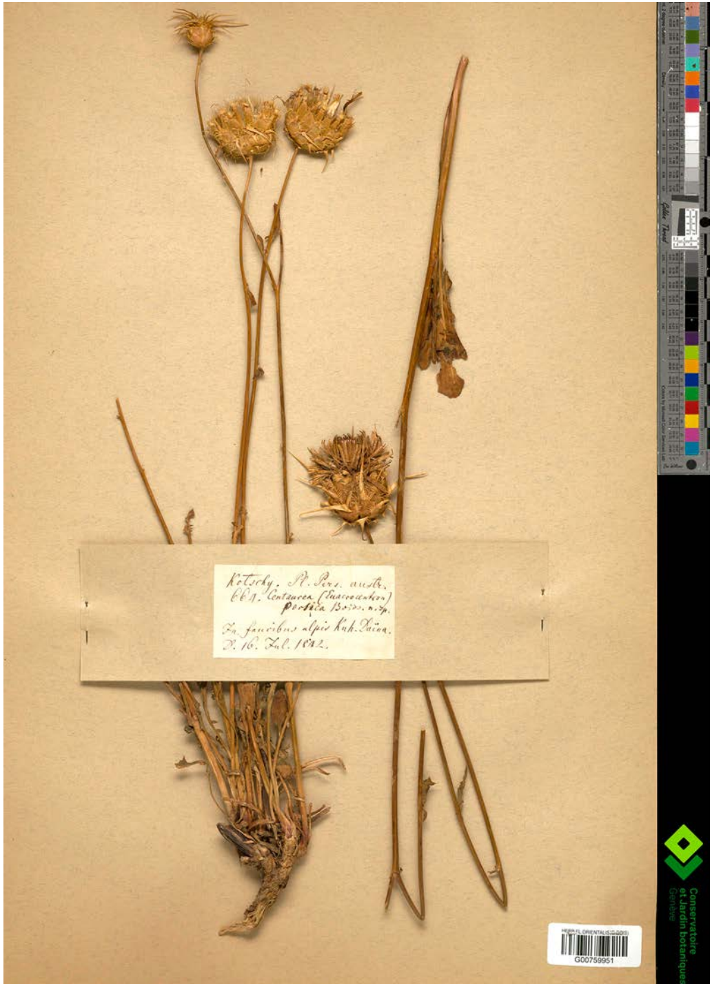
Fig. 1. Holotype of Centaurea persica Boiss. var. persica [G-BOIS (G00759951)].