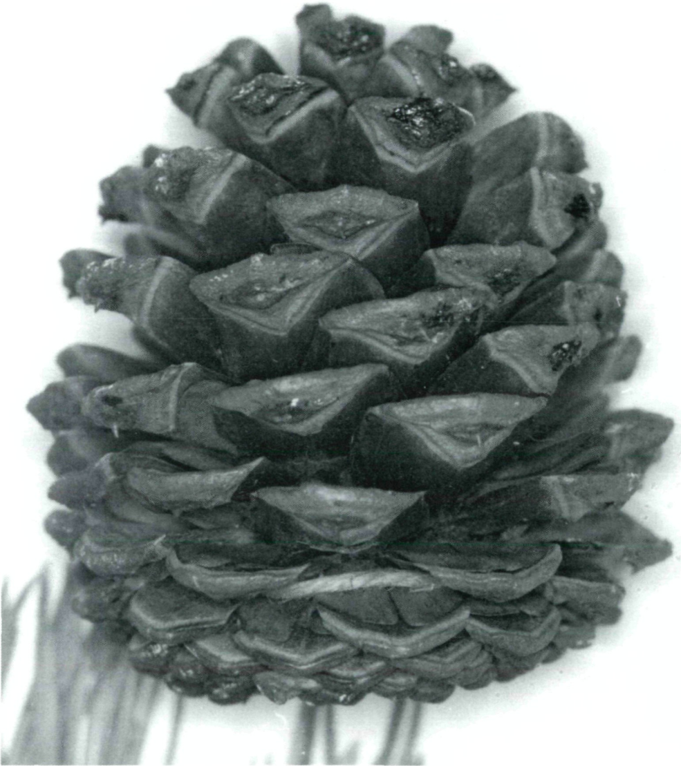
Fig. 3: Cone of Pinus washoensis from isotype in [UC]. Size 67 x 68 mm.

very similar to those of P. washoensis , he concluded that Washoe pine is an offshoot of some Cordilleran alliance of ponderosa pine. Informative figures of ovuliferous cones of Washoe, Arizona and Rocky Mountain ponderosa pines are provided to exemplify this. As far as this assemblage of taxa is concerned AXELROD was quite correct. If, however, North Plateau provenances would also have been included in the comparisons, AXELROD's conclusions would presumably have been quite different. Washoe and North Plateau ponderosa pines are more similar in many respects than are Washoe pine and