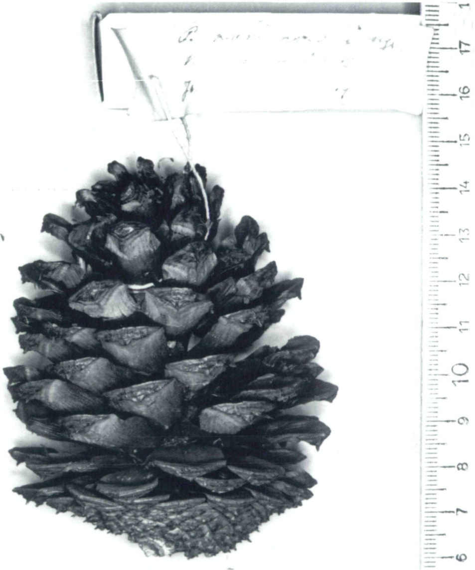
Fig. 4: Cone of Pinus ponderosa DOUGLAS ex C.LAWSON, the neotype [W] (LAURIA 1996): Size 88 x 74 mm.

Rocky Mountain races of ponderosa pine. For example, while immature cone colour for both, P. ponderosa var. scopulorum and P. arizonica , is green, this colour is deep purple not only in Washoe pine, but also in P. ponderosa s.str. (presumably identical with North Plateau ponderosa pine in general). Washoe pine populations on Mount Rose, Nevada (and on other sites in extreme northeastern California), although now recognized to be North Plateau ponderosa pines, would still have to be called relicts, but of a north-western element surviving at the very edge of the Great Basin.