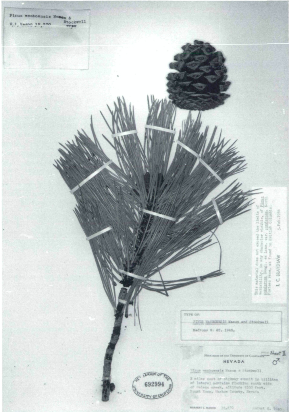
Fig. 2: Isotype of Pinus washoensis H.MASON & STOCKW. [UC], for details see text.