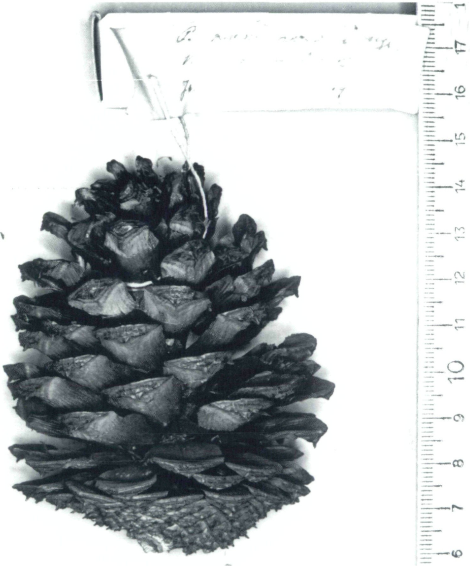
Fig. 4: Cone of Pinus ponderosa DOUGLAS ex C.LAWSON, the neotype [W] (LAURIA 1996): Size 88 x 74 mm.

Rocky Mountain races of ponderosa pine. For example, while immature cone colour for both, P. ponderosa var. scopulorum and P. arizonica , is green, this colour is deep purple not only in Washoe pine, but also in P. ponderosa s.str. (presumably identical with North Plateau ponderosa pine in general). Washoe pine populations on Mount Rose, Nevada (and on other sites in extreme northeastern California), although now recognized to be North Plateau ponderosa pines, would still have to be called relicts, but of a north-western element surviving at the very edge of the Great Basin.