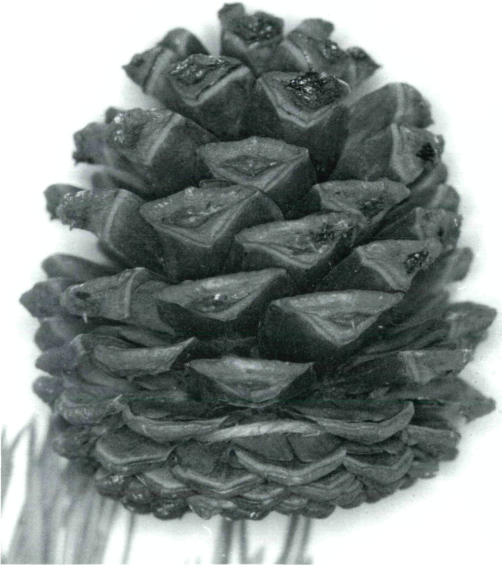
Fig. 3: Cone of Pinus washoensis from isotype in [UC]. Size 67 x 68 mm.

very similar to those of P. washoensis , he concluded that Washoe pine is an offshoot of some Cordilleran alliance of ponderosa pine. Informative figures of ovuliferous cones of Washoe, Arizona and Rocky Mountain ponderosa pines are provided to exemplify this. As far as this assemblage of taxa is concerned AXELROD was quite correct. If, however, North Plateau provenances would also have been included in the comparisons, AXELROD's conclusions would presumably have been quite different. Washoe and North Plateau ponderosa pines are more similar in many respects than are Washoe pine and