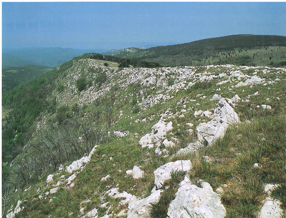
Fig. 6: The habitat of P. boreae sp. n., exposed calcareous ridge of Mt. Lipnik.

Derivatio nominis: The new species is named after bora, the strong and cold northern wind (burja in Slovene, borea in Latin), a strong elemental force in the habitat of P. boreae , situated on the exposed mountain ridge.