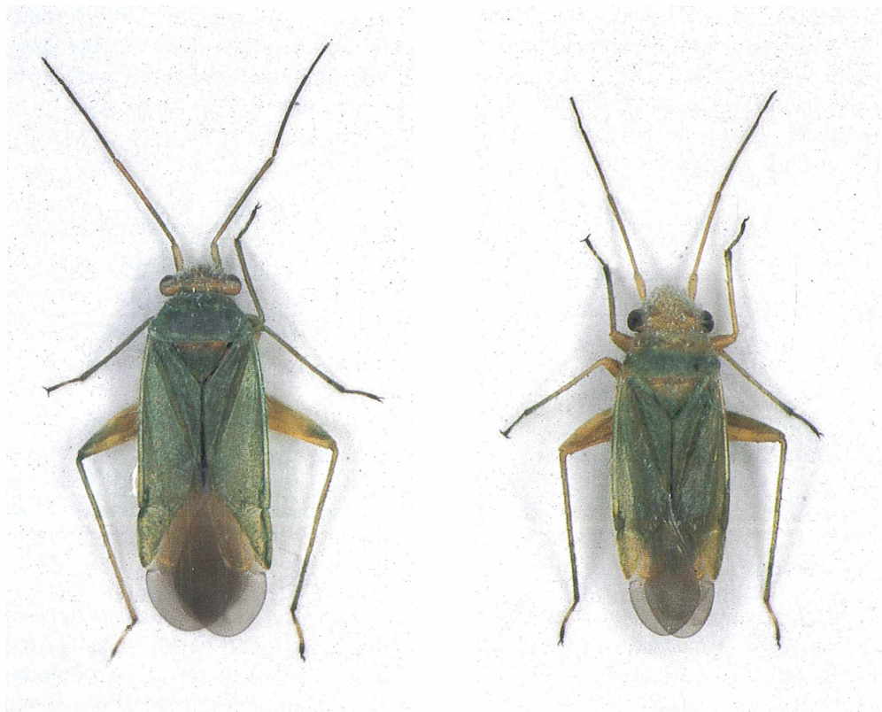
Fig. 1: Platycranus boreae sp. n., left male (holotype), right female (paratype).