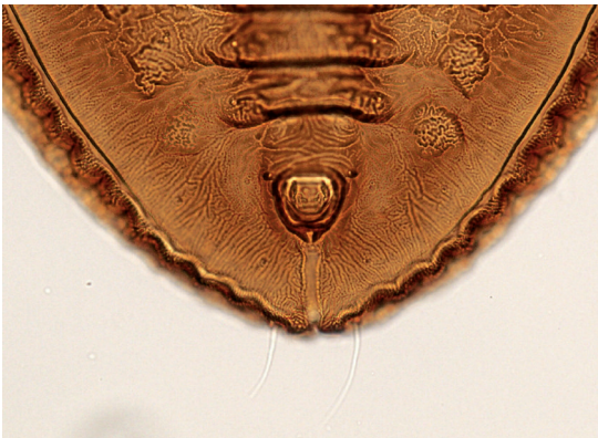
Fig. 6: Aleuroclava aucubae - vasiform orifice

Sl. 5: Aleuroclava aucubae - prepariran puparij