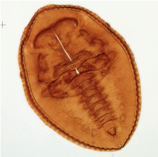
Fig. 5: Aleuroclava aucubae - slide mounted puparium

Sl. 5: Aleuroclava aucubae - prepariran puparij