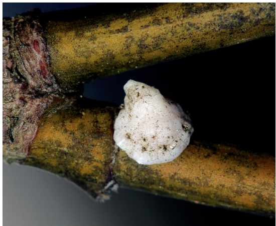
Fig. 8: Ceroplastes ceriferus - mature female (life-size 7-10 mm)

Sl. 8: Ceroplastes ceriferus - odrasla samica (n. v. 7 - 10 mm)