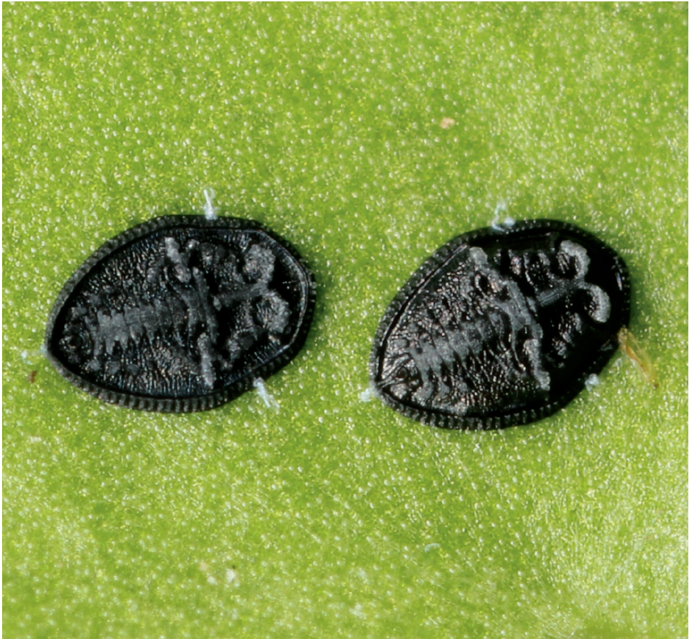
Fig. 4: Aleuroclava aucubae - puparia (life-size 0.7-0.8 mm)