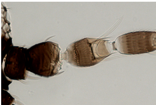
Fig. 3: Dichromothrips corbetti - abdominal segments 8, 9 and 10 with posteromarginal comb on segment 8

Sl. 2: Dichromothrips corbetti - viličast čutni stožec na tretjem členu tipalk