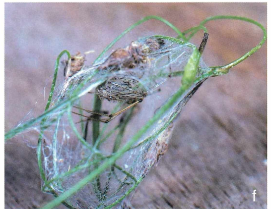
Plate 1. a) Thaumasia sp. (Pisauridae), a representative of the "ground ambusher" guild. b) Nops sp. (Caponiidae), a representative of the "litter stalker" guild. c) Otiiothops hoeferi (Palpimanidae), another representative of the "litter stalker" guild. d) Cupiennius celerrimus (Ctenidae), a "nocturnal aerial ambusher". e) Olios sp. (Sparassidae), another representative of the "nocturnal aerial ambusher" guild. f) Scytodes sp. (Scytodidae), a spitting spider in its retreat. These spiders hunt stalking around and were included in the guild of "nocturnal aerial runners".