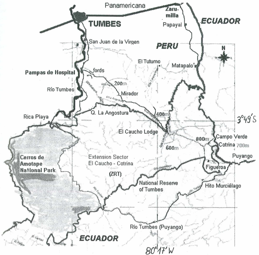
Fig. 1. Map of the study area with the new extended national park boundary. – Karte des Untersuchungsgebietes mit den neuen Nationalparkgrenzen.

The ZRT consists mainly of two vegetation zones, called eco-regions after Brack in D'Achille (1996), blending into each other around 500 m.a.s.l.: a) Tropical Deciduous Forest (Bosque Seco Ecuatorial) between c. 50 and 500 m and b) Tropical Semi-deciduous (or semi-evergreen) Forest (Bosque Tropical del Pacífico) between c. 500 and 950 m. The higher eco-region is unique for Peru. It is defined by higher amount of precipitation as in the former, as clouds from the Tumbes coast empty their load, mostly in the highest part of the Cordillera Larga during January to March. For detailed vegetation lists see Best & Kessler (1995) and Parker et al. (1995).