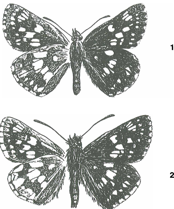
Fig. 1: Syrichtus cribrellum heilong subsp. nov., general view.