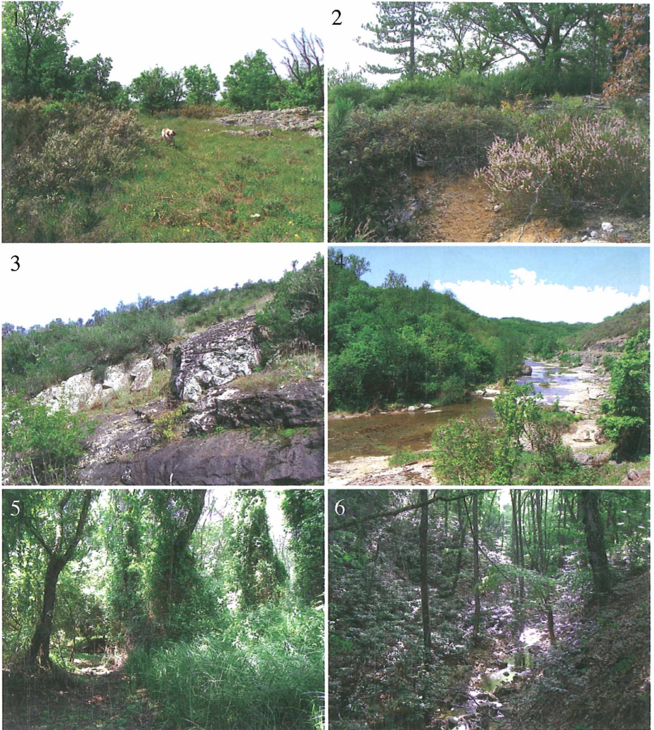
Figs 1-2: "Dyado Vulcho" in "Pirena" protected area above Kosti Village above Kosti Village, X.2008