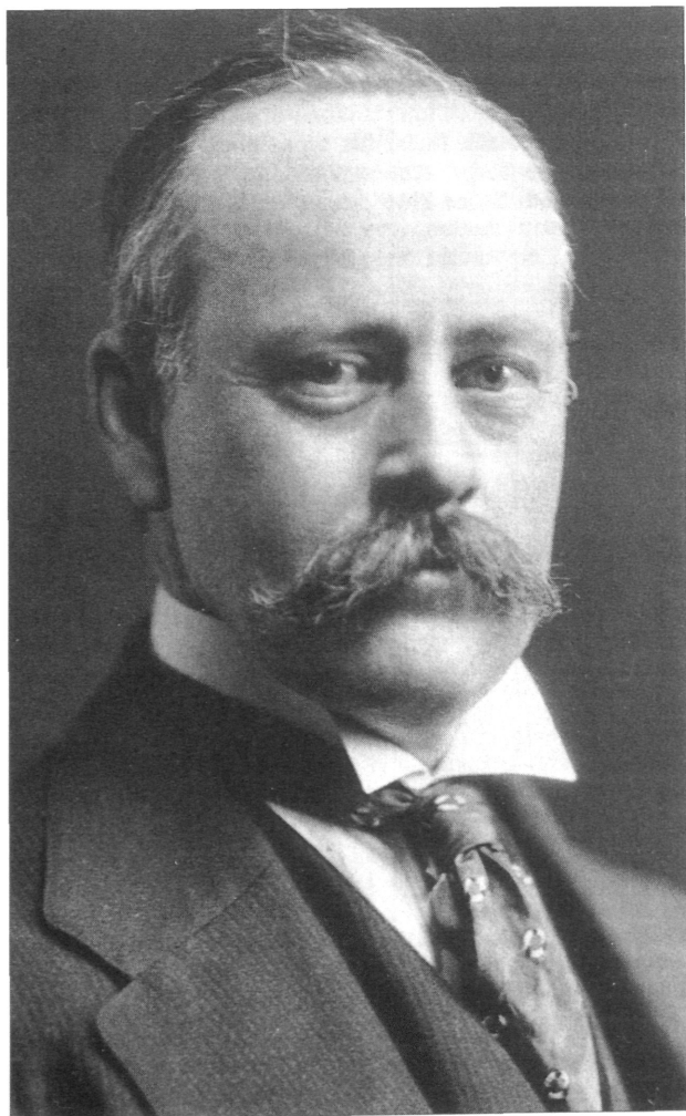
Fig. 1. Nathan Banks (1916), courtesy of the MCZ.

The Trichoptera Collection in the Museum of Comparative Zoology (MCZ), Harvard University, has resulted primarily from the work of two neuropterists (in the broad sense), Hagen and Banks. However, Banks preferred to be recognized as "an entomologist" and not just a specialist of a few orders. The collection is especially important to science because it contains a great number of primary types, mostly from North America, but many are from Africa, Asia, Australia, Europe and South America, too. Herman August Hagen (1817-1893) left Königsberg, East Prussia in 1867 at the invitation of Louis Agassiz to take charge of the Entomology Section at the MCZ. He became Professor of Entomology at Harvard in 1870 and worked until he was stricken with paralysis in 1890 (Mallis 1971). Nathan Banks (1868-1953), Fig.1, began working at the MCZ in November 1916, at which time he donated to the institute his extensive library and his personal collection of more than 120,000 specimens, of which 1,800 were types. Prior to this he had worked for the United States Department of Agriculture in Washington, DC, for 26 years. He became an Associate