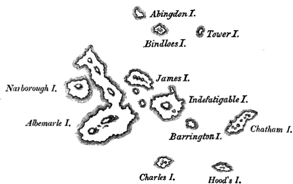
Fig. 2: Map of the Galápagos Islands (from Charles Darwin's "Journal of researches" 1845, p. 372).

Die Inseln des Galápagos-Archipels (Karte aus «Journal of researches» von Charles Darwin 1845, S. 372).