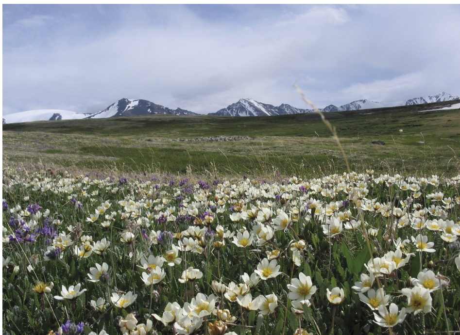
Fig. 2: Dryas oxyodonta community.

Communities of the alliance Thamnelio-Betulion rotundifoliae all. nova prov. (Tab. 1, col. 5-11) predominate in moderately arid climate of central and south-eastern parts of the Altai, where they occur at higher altitudes on the tops of mountain ridges with thinner snow cover (30-40 cm, up to 50 cm). They are characterized by a distinct layer of numerous lichens ( Cladonia amaurocraea , C. sulphurina , C. uncialis , Cetraria laevigata , Thamnelia vermicularis , Flavocetraria cucullata ) and participation of true alpine and arctic-alpine species ( Dryas oxyodonta , Festuca sphagnicola , Pedicularis oederi , Lloydia serotina , fig. 2).