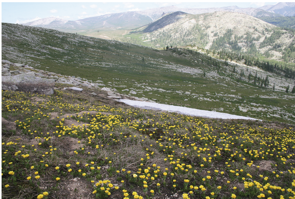
Fig. 3: Ranunculus altaicus subnival meadow.