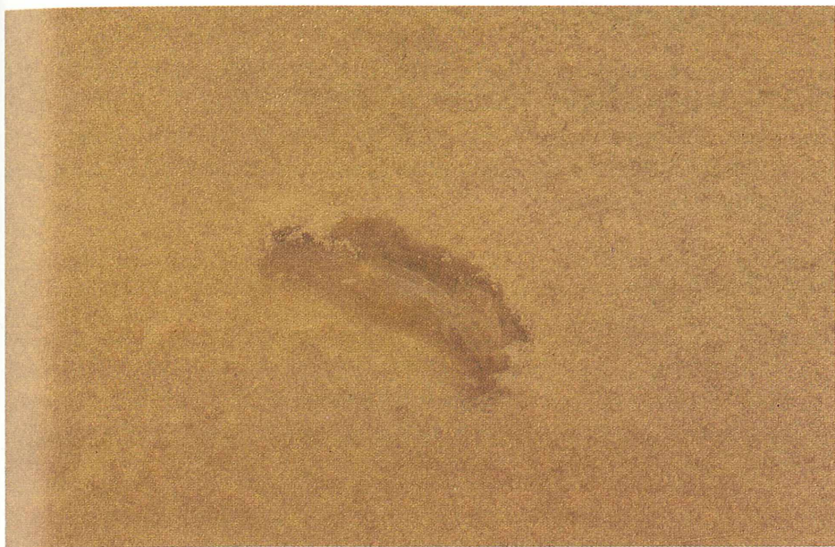
Fig. 3: Penilpidia ludwigi feeding on the sediment surface.

The tube-like opening of the gonoduct is situated in front of the dorsal papillae (Fig. 2E). In most of the specimens, three pairs of retractile dorsal papillae are present (Figs 2A, E). Two pairs are located very closely together in trapezoidal arrangement at about one third of the length, the second pair being a little wider apart than the first pair. The posterior pair of the dorsal papillae is situated at the beginning of the posterior third of the body. In one specimen from station 17 bc3, only three dorsal papillae are present - one anterior pair and a single posterior papilla on the right side of the body.