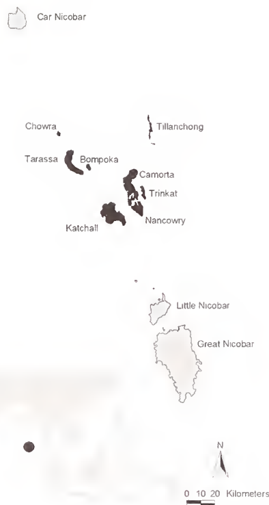
Fig. 1. Map of Nicobar Islands. Black coloured islands illustrate occurrence of B. rubrigularis sp. nov.