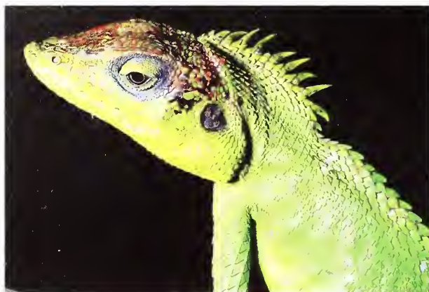
Fig. 3. Bronchocela rubrigularis male in life from Camorta Island.

width in temporal region 16.0 mm; head length from tip of snout to hind margin of tympanum: 30.4 mm. 9 upper labials and 8 lower labials on each side. Diameter of orbit 4.84 mm, diameter of tympanum 4.34 (ratio: tympanum/orbit 0.89). Head concave, covered above with small uniform keeled scales, two slightly enlarged scales intermixed on an upper line between orbit and tympanum 5 scales between nasal and anterior border of orbit along canthus rostralis. Mental wider than high, followed by three postmentals. Gular region covered by keeled scales, gular sac small, covered with little enlarged keeled scales, smaller than ventrals. A skin fold stretches from angle of mouth to insertion of foreleg. Nuchal crest formed by 10 lanceolate erect scales, bordered laterally by smaller erect scales, longest little longer than diameter of orbit. Middorsal scale row forming a small dorsal crest by triangular crest scales, which is lower than nuchal crest, sepa-