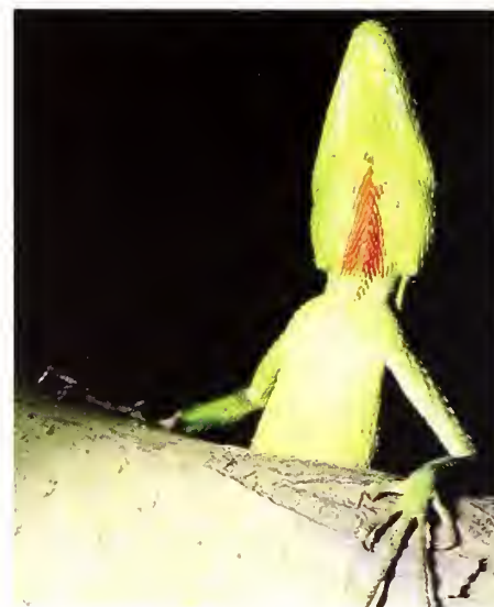
Fig. 4. Bronchocela rubrigularis same specimen as in Fig. 3, showing red gular patch.

width in temporal region 16.0 mm; head length from tip of snout to hind margin of tympanum: 30.4 mm. 9 upper labials and 8 lower labials on each side. Diameter of orbit 4.84 mm, diameter of tympanum 4.34 (ratio: tympanum/orbit 0.89). Head concave, covered above with small uniform keeled scales, two slightly enlarged scales intermixed on an upper line between orbit and tympanum 5 scales between nasal and anterior border of orbit along canthus rostralis. Mental wider than high, followed by three postmentals. Gular region covered by keeled scales, gular sac small, covered with little enlarged keeled scales, smaller than ventrals. A skin fold stretches from angle of mouth to insertion of foreleg. Nuchal crest formed by 10 lanceolate erect scales, bordered laterally by smaller erect scales, longest little longer than diameter of orbit. Middorsal scale row forming a small dorsal crest by triangular crest scales, which is lower than nuchal crest, sepa-