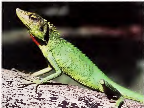
Fig. 5. Bronchocela rubrigularis male in life, from unknown locality in central Nicobar in green morph.

rected rostrally. Tympanum dark, lower side of body between fore legs, underside of upper and lower legs and region around cloacae light brown, lower side of hands and feet whitish. Venter and lower side of tail brown.