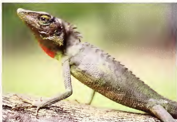
Fig. 6. Bronchocela rubrigularis male in life, from Trincat Island in brown morph.

Variations (see table 1). Females differ from the holotype by a lower nuchal crest, and by the lack of a red gular patch. One female has a pale gular patch and one subadult male has no gular patch. Tail length varies (280–377 mm [336–378 % of SVL]). Body colouration varies (see diagnosis). Body colouration (in alcohol) of venter and ventral side of legs and tail of paratype (ZMH R09272), subadult male, is very similar to the holotype. Scalation (see table 1) is similar. The nuchal crest is lower, no enlarges scales are present between orbit and tympanum.