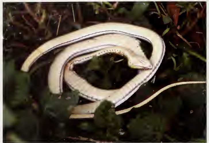
Fig. 17. The same specimen from below.

so earlier records of P. sibilans from West Africa (e.g. Chabanaud 1916) refer to this form which, in our opinion, is not conspecific with the true P. sibilans from Egypt. Many not yet fully grown but nonetheless adult (mature) specimens may retain more or less distinct reddish dorsolateral stripes along the body. The belly is light whitish to yellowish and patternless (no dark hairlines along the ventral plates), but supralabials, sublabials and gulars show some dark pigmented spots (see Böhme et al. 1996). The anal shield is entire. Its taxonomic status and nomenclatural status needs still to be assessed.