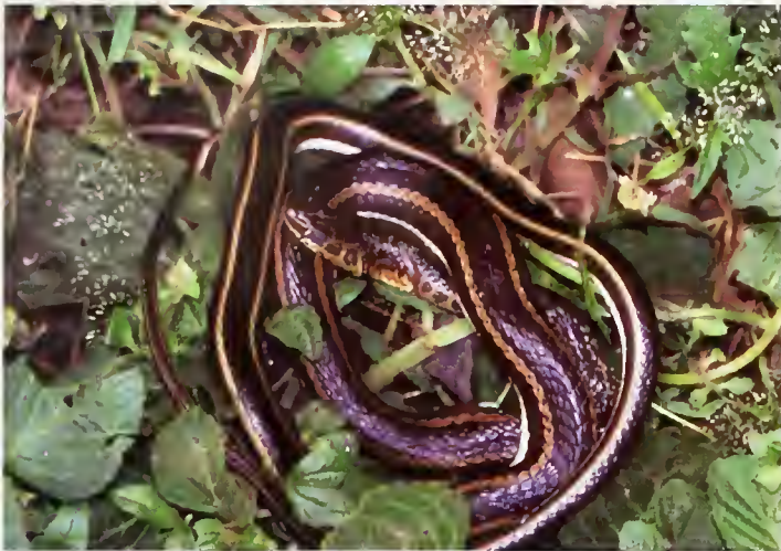
Fig. 16. Psammophis sudanensis from Bohicon, southern Benin.