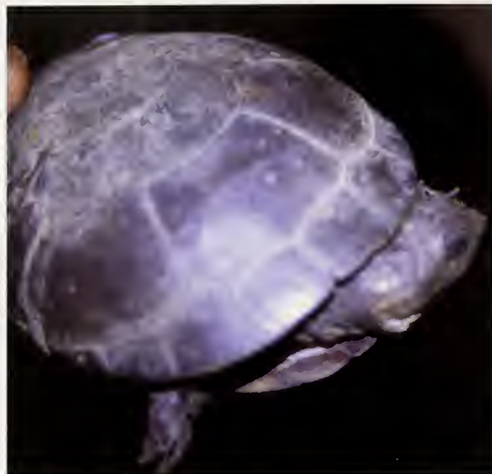
Fig. 7. Pelomedusa subrufa from near Bohicon, southern Benin.

gust/September 1984; ZFMK 77061-062, Bohicon, ZFMK 77063-064, Cotonou, all coll. by K. Ullenbruch, May/June 2002.