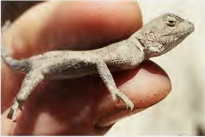
Fig. 20. Agama gracilimembris , Pendjari NP, first rediscovery in Benin after its first description from this country nine decades ago.