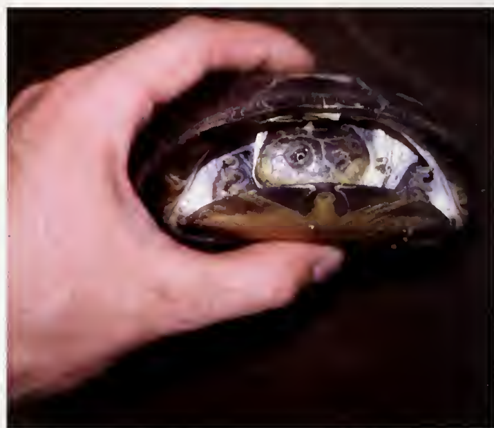
Fig. 8. Pelusios castaneus from near Bohicon, southern Benin.

Remarks. This common and widespread species was observed in all habitats including human settlements where vertical structures such as tree trunks and/or house walls were preferred. It was, however, never seen in the closed forest.