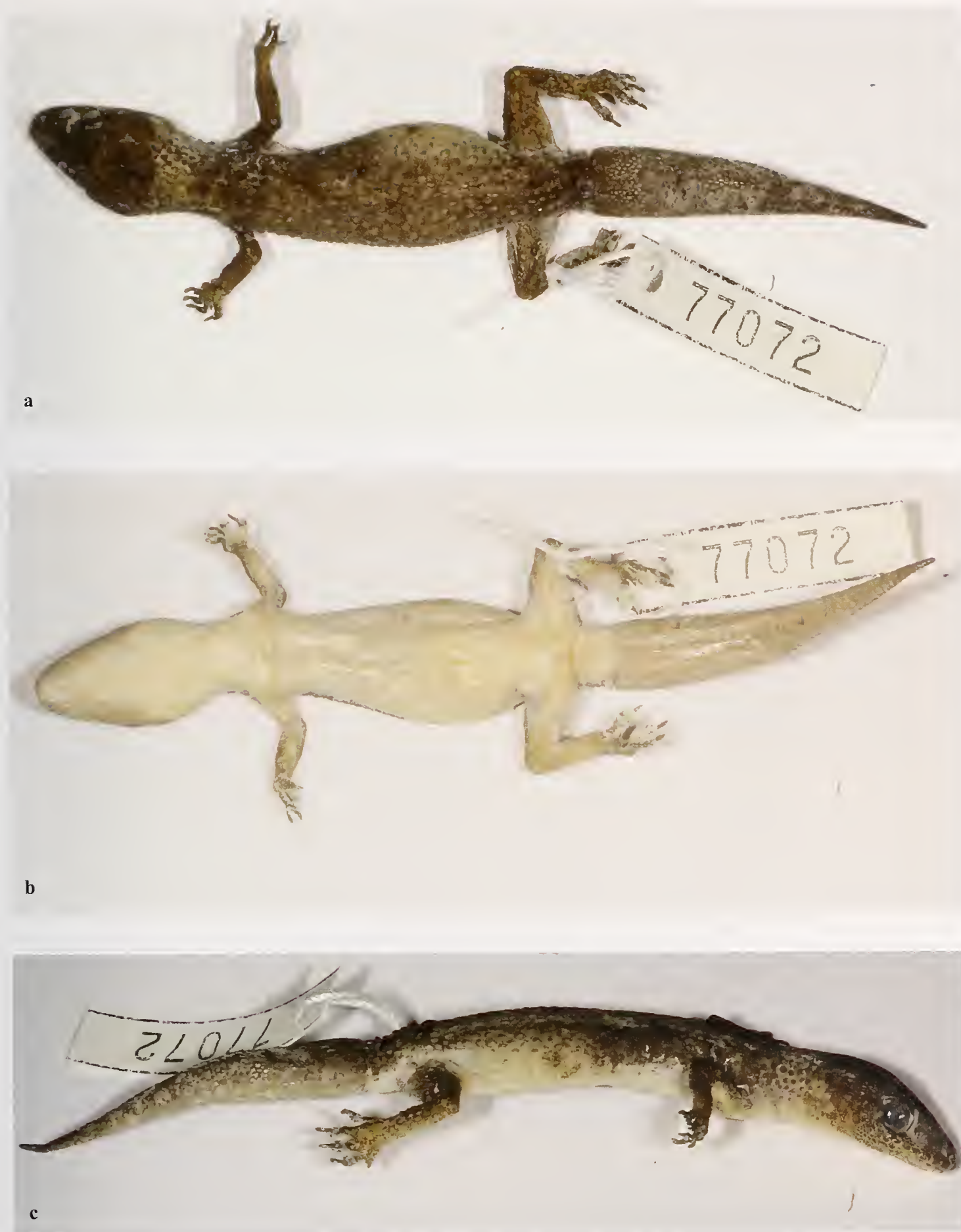
Fig. 13. Hemidactylus lamaensis n. sp., holotype from Lama Forest (Noyeau central) in dorsal (a), ventral (b) and lateral (c) view.