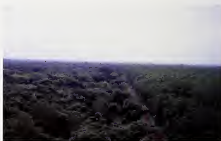
Fig. 2. Primary forest of Forêt de Lama (Noyeau central) (left) with bordering teak plantations (right)

til 1946, large areas of natural forest were already destroyed, and only 11.000 ha remained. Since the 1960ies reforestations are taking place which favoured, however, mainly teak plantations. The natural vegetation has been protected only from 1988 onwards (Emrich et al. 1999). Mean annual precipitation is 1100 mm with two peaks (big and small rainy seasons) in March to June and September to October respectively. The annual mean temperature lies between 25–29°C. The eastern part of the Lama depression is crossed – in north-south direction – by the Ouémé River valley. Close to Lama Forest, there are only few smaller creeks. During the rainy seasons, however, large parts of the area are changed into overflowed marshlands. Due to these repeated inondations and stagnant wates, there are only six dominant tree species in Llama Forest, viz. Dialium guineense , Diospyros mespiliiformis , Albizia zygia , Azelia africana , Khaja senegalensis , and Anogeissus leiocarpus . The Noyeau Central consists mainly of a mixture of relicts of a semideciduous forest which floristically approaches the “Forêt de Samba”