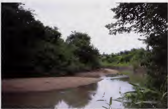
Fig. 4. Gallery forests at the Zou River, southern Benin.