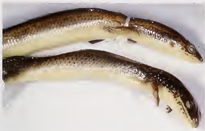
Fig. 14. Mochlus guineensis , from Cotonou (above) and Lama Forest (Noyeau central) (below).

invariably to escape upwards. They were mainly active between 11.00h and 15.00h, at air temperatures of 31–32°C.