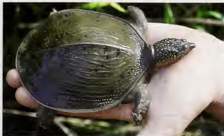
Fig. 18. Cyclanorbis senegalensis , juvenile from Pendjari NP, northern Benin.