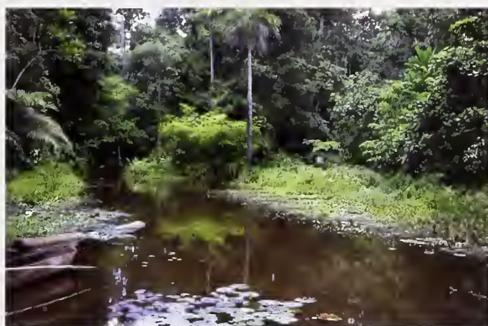
Fig. 5. Flooded forest of Forêt de Lokoli.

Finally, some reptiles were collected also in Cotonou and Bohicon, on house walls and in gardens, and markets were visited to inspect the reptile species offered. Most of the reptiles were collected by UK by visual encounter and focal sampling. Moreover, specimens were brought by the locals, particularly by two snake hunters from Didja and Za-Kpota respectively who even received an alcohol-filled bucket in order to keep interesting snake finds for some days. The Swiss zoologists of the Biolama project provided us with few, but very important voucher specimens (e.g. Hemidactylus sp.n., Holaspis guentheri ) taken in trunk electortraps used for the entomological survey.