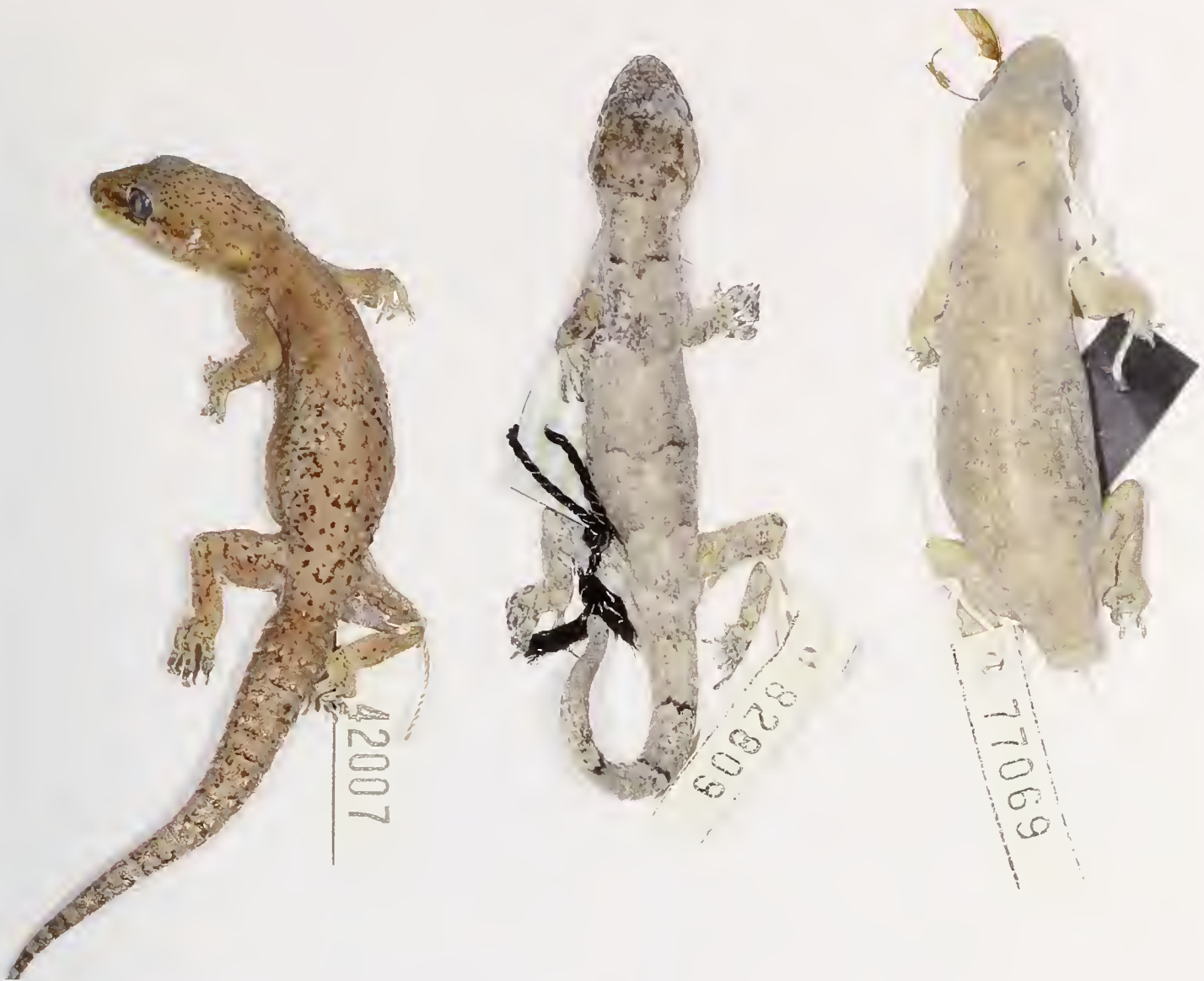
Fig. 12. Hemidactylus angulatus (s.str.) from Godomey near Cotonou (left), H. mabouia from Cotonou (center) and H. aff. mabouia, also from Cotonou (right).