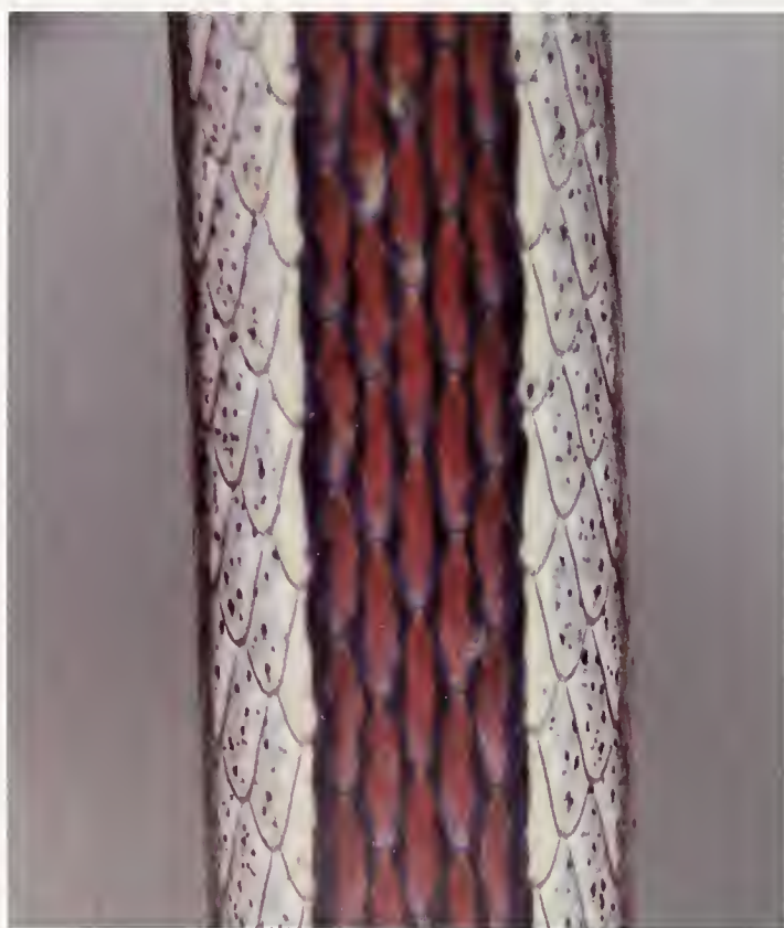
Fig. 22. Psammophis elegans from Pendjari NP, dorsal pattern.

Meizodon coronatus – Trape & Mané (2006 b): on grid map but without specific locality.