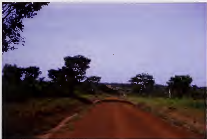
Fig. 3. Landscape round the village of Didja, southern Benin.

type (Mondjokannagni 1969) and of secondary forest in various developmental stages. Within this dynamic system, the South American fast-growing asteracean neophyte Chromolaena odorata is commonly found along small roads and paths and at the forest edges. In smaller plantations, next to the larger ones with teak, trees such as Gmelina arborea , fraké ( Terminalia superba ), samba wood ( Triplochiton skleroxylon ) and, especially in the Toffo sector, the fire-resistant Cassia siamea are cultivated (Specht 2002).