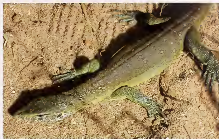
Fig. 21. Varanus niloticus , subadult, unusually light-coloured specimen from Pendjari NP.

Gongylophis muelleri – Trape & Mané (2006 b): on grid map but without specific locality.