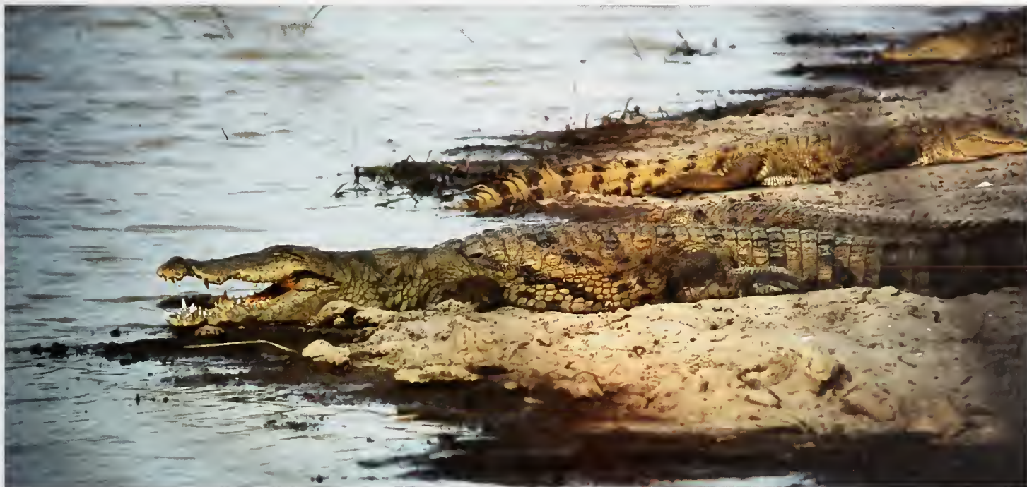
Fig. 19. Crocodylus suchus , Pendjari NP.

Tarentola ephippiata – Bauer et al. (2006): Pendjari NP.