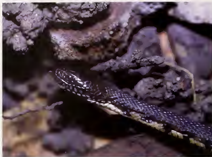
Fig. 15. Afronatrix anoscopus , juvenile, from Lokoli Forest, first country record.

Material examined. ZFMK 77014, Za-Kpota, coll. by native hunter, may 2002.