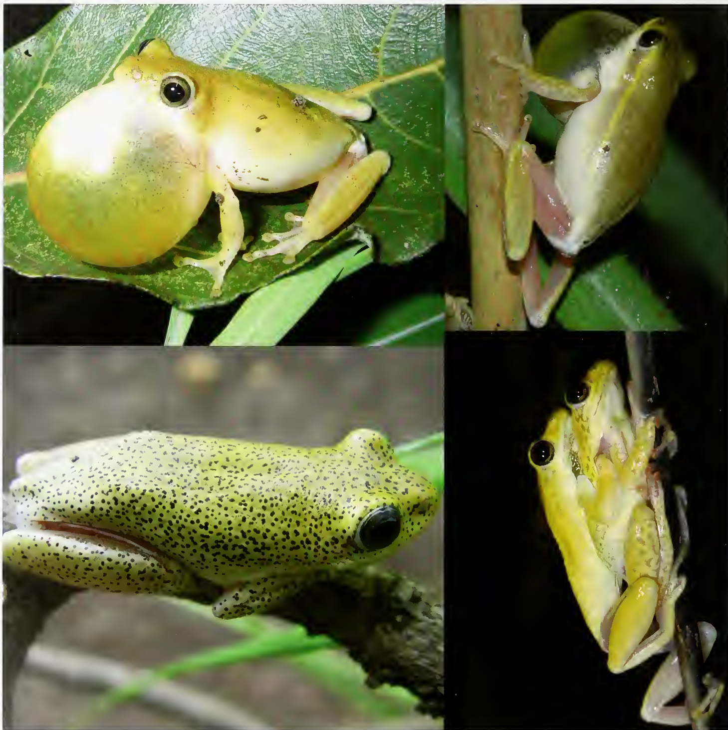
Fig. 1. Life coloration of Hyperolius spatzi and H. nitidulus ; upper left: calling H. spatzi male from Sabodala, Senegal, remark uniform yellow color at night; lower left: daytime coloration of H. spatzi from Sabodala, Senegal, with numerous minute black points; upper right: calling H. nitidulus male from Pendjari National Park, northern Benin, remark dark lateral band; lower right: H. nitidulus couple from Lamto reserve, Ivory Coast, remark almost uniform yellow color of male and grey mottling on legs and on the flanks in the female.

H. nitidulus Peters, 1875, was acknowledged species status, a decision previously already applied for mostly pragmatic reasons by e.g. Schiøtz (1967), Drewes (1984) and Rödel (1996, 2000). This widespread West African savanna frog was described by Peters (1875) from “Yoruba (Lagos)”, Nigeria. It was treated as a synonym of H. marmoratus by Boulenger (1882), as a synonym of H. picturatus by Loveridge (1955) and as synonym or subspecies