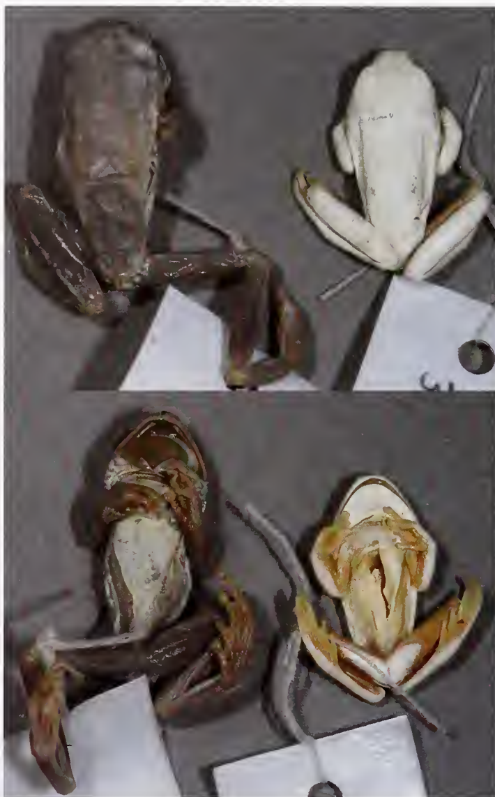
Fig. 2. Dorsal and ventral views of the types of left: Hyperolius nitidulus (ZMB 7729, holotype, adult female) and right: H. spatzi (ZMB 32602, lectotype, subadult male).