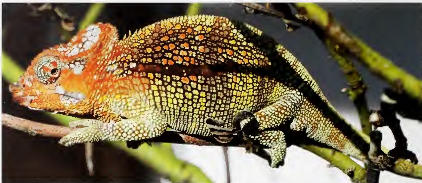
Fig. 9. A six year old K. u. arytator ssp. n. in captivity.

Mertens R (1955) Amphibien und Reptilien aus Ostafrika. Jh. Ver. Vaterl. Naturk. Württ. 110: 47–61