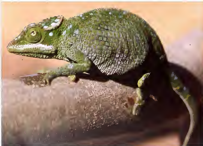
Fig. 7. Female paratype of K. u. arytitor ssp. n. in life (photo: J. Mariaux).

species have been described from montane forests in Kenya and Tanzania (Menegon et al. 2009, Necas 2009, Necas et al. 2009) and several subspecies have also been raised to species status based on genetic divergence and detailed morphological studies (Mariaux et al. 2008). No doubt more species remain to be discovered in the still poorly surveyed mountain ranges across East Africa. The discovery of K. uthmoelleri in the South Pare Mountains also shows that species' distribution ranges are not well documented and it is quite likely that K. uthmoelleri also occurs on other massifs in-between these now known populations, such as Mt. Kilimanjaro and Mt. Meru (Fig. 8). K. uthmoelleri has a similar distribution to the Trioceros sternfeldi species complex, including the recently described T. hanangensis (Krause & Böhme 2010). Although the phylogeography of all T. sternfeldi populations has not been investigated, the Mt. Hanang population has been identified as a divergent sister clade to the Mt. Meru/ Kilimanjaro populations. A similar pattern is found in K. uthmoelleri , the Mt. Hanang populations morphologically di-