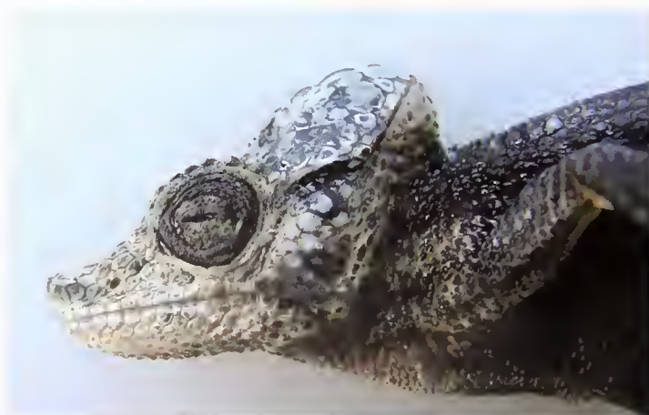
Fig. 4. Portrait of the holotype of K. u. artytor ssp. n..

Variation on the paratypes (MNHG 2612.64, 2612.66–67). All measurements of the paratypes and the other specimens of K. u. artytor ssp. n. are shown in Tables 1–2. MNHG 2612.64 is a juvenile male, the belly is cut and the intestines are removed, the colouration after preservation is very dark, collection and field number (TZ-138) is tied around the right hind leg. MNHG 2612.66 is an adult male and fits quite well with the description of the holotype: belly is cut but the intestines are still present, 2 conical scales in the neck, collection and field number