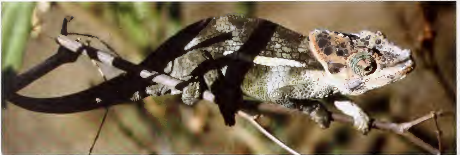
Fig. 6. Holotype of K. u. arytitor ssp. n. in life.

species have been described from montane forests in Kenya and Tanzania (Menegon et al. 2009, Necas 2009, Necas et al. 2009) and several subspecies have also been raised to species status based on genetic divergence and detailed morphological studies (Mariaux et al. 2008). No doubt more species remain to be discovered in the still poorly surveyed mountain ranges across East Africa. The discovery of K. uthmoelleri in the South Pare Mountains also shows that species' distribution ranges are not well documented and it is quite likely that K. uthmoelleri also occurs on other massifs in-between these now known populations, such as Mt. Kilimanjaro and Mt. Meru (Fig. 8). K. uthmoelleri has a similar distribution to the Trioceros sternfeldi species complex, including the recently described T. hanangensis (Krause & Böhme 2010). Although the phylogeography of all T. sternfeldi populations has not been investigated, the Mt. Hanang population has been identified as a divergent sister clade to the Mt. Meru/ Kilimanjaro populations. A similar pattern is found in K. uthmoelleri , the Mt. Hanang populations morphologically di-