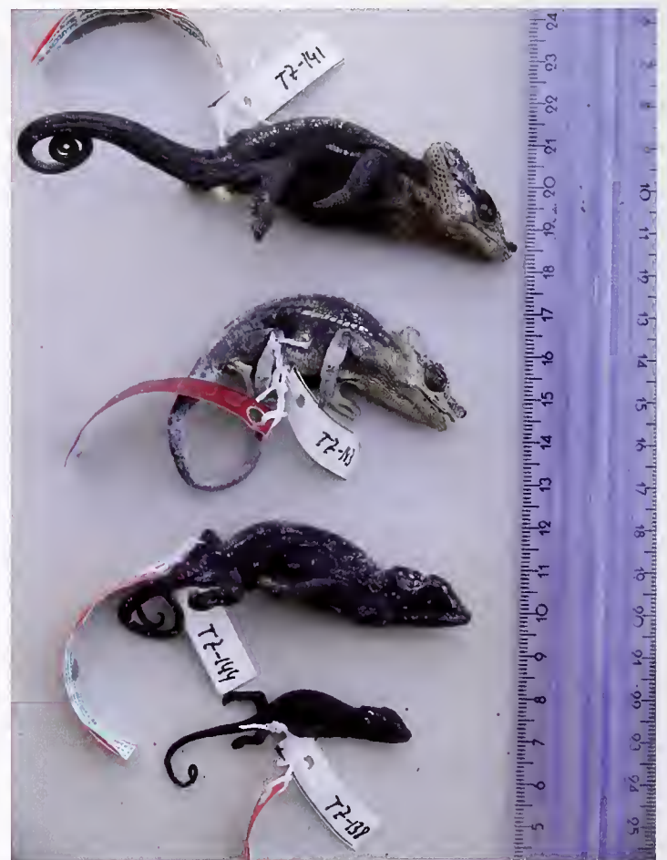
Fig. 2. Type material of K. u. arytator ssp. n..

All measurements and investigated morphological characters of the specimens are listed in Tables 1–3. The morphological traits which differentiate the male specimens of Mt. Hanang from those of the South Pare Mountains and Ngorongoro crater highlands are: higher measurements, a relatively broader and shorter head, rougher (more convex) scalation on the head and body, canthus parietalis (cp) not bi-forked anteriorly but fan-shaped anteriorly and the cp composed of two rows of scales (Fig.