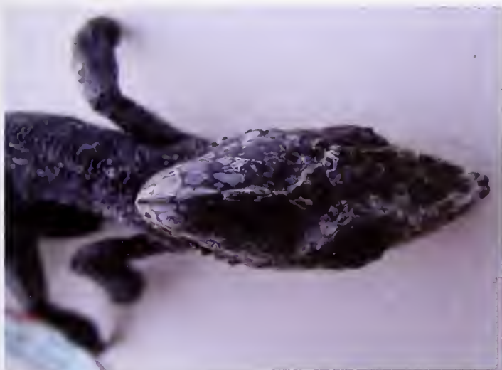
Fig. 5. Head view of the holotype of K. u. artytor ssp. n..