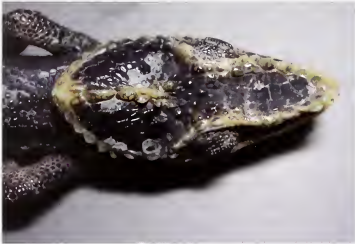
Fig. 1. Head view of the holotype of K. u. uthmoelleri.

moelleri at these locations have not been confirmed. Recently the taxon uthmoelleri was placed with all other east African Bradypodion in a new genus, Kinyongia (Tilbury et al. 2006). In the last 15 years only two authors have published details on the captive husbandry and breeding of K. uthmoelleri , specimens collected from the Ngorongoro crater highlands (Price 1996; Necas & Nagy 2009). Around the year 2000, specimens of “ Bradypodion uthmoelleri ” appeared in the international pet trade. These animals were very small in overall size, more slender and with smoother scalation than K. uthmoelleri specimens from Mt. Hanang. Even after six years of keeping some of these specimens in captivity these distinct characters have not changed and so ontogenetic change in these characters can be ruled out. Unfortunately, the geographic origin of these specimens was not known until four similar specimens were discovered in the collection of the Muséum d’histoire naturelle in Geneva in 2004, which suggests they originate from the same locality, the South Pare Mountains, and belong to the new subspecies described in this paper.