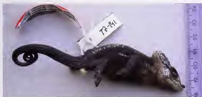
Fig. 3. Holotype of K. u. artytor ssp. n. (photo: N. Lutzmann).

Description of the Holotype (Figs 3–5). MNHG 2612.65, adult male, 1840 m asl, South Pare Mountains, North Tanzania, leg. J. Mariaux & C. Vaucher, 29. 09. 2000. HBL 80.0 mm, TL 100.0 mm, ToL 180.0 mm, HL 31.0 mm, HW 13.0 mm, the belly is cut and the intestine removed, both hemipenes are partly everted, length of lower jaw 21.0 mm, distance from front edge of eye to nostril 9.8 mm, distance from nostril to snout tip 5.4 mm, distance from lower jaw to the tip of casque 7.5 mm, head width between eyes 6.5 mm, canthus temporalis from eye to angle 7.7 mm, canthus parietalis (cp) is bi-forked anteriorly (Fig. 5), distance from bifurcation of cp to the top of