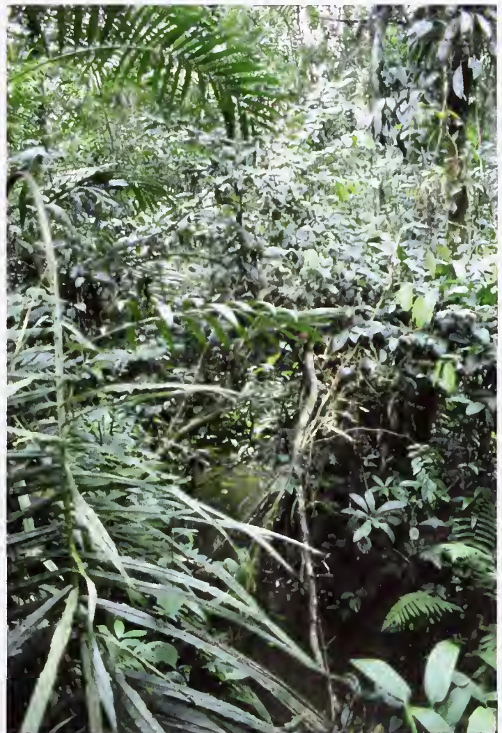
Fig. 25. Habitat near Malweta village where O. tetraspis was observed.

Remarks: The existence of the dwarf crocodile in Ziama Forest is proven by a photograph by W. Bützler (Fig. 24) taken near Sérédou in summer 1993. A particular site where the species was observed near Malweta is shown in Fig. 25. According to Villiers (1958), this species is