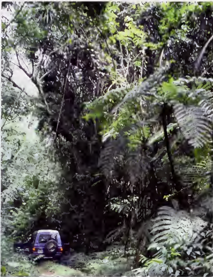
Fig. 3. “Antenna hill” at Sérédou, submontane forest with the tree fern Cyathea manniana.

for completeness’ sake: Agama agama (ZFMK 64473–479), Chamaeleo gracilis (ZFMK 64489), Varamus exanthematicus (ZFMK 64471: head only), V. niloticus (ZFMK 66470), Crotaphopeltis hotamboeia (ZFMK 64467–468), Grayia smithii (ZFMK 64465–466), Philothamnus irregularis (ZFMK 64469), Psammophis el-