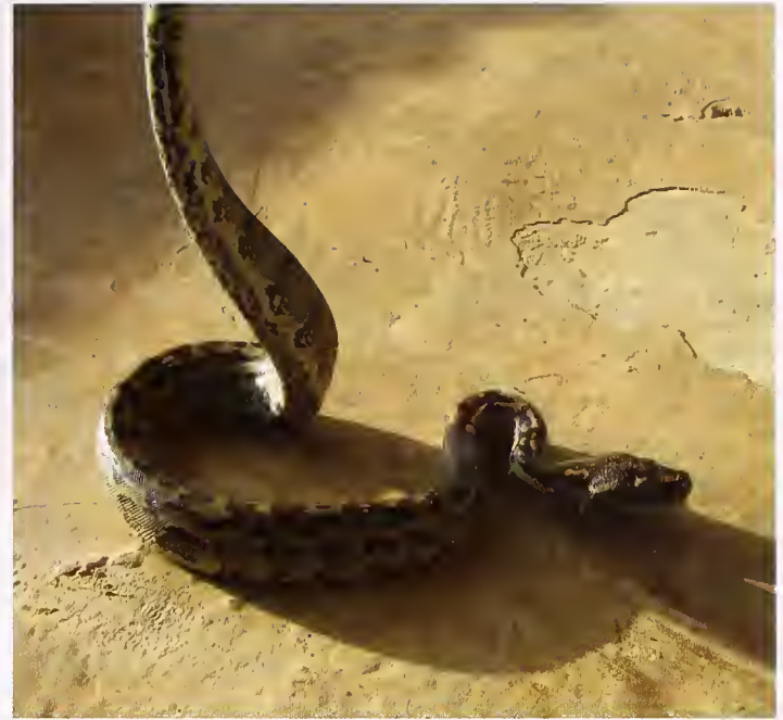
Fig. 13. Python sebae , subadult specimen from Mt. Nimba.

Remarks: A second individual was seen in the "Centre Entomologique" in N'Zérékoré (H. Olsen coll.). According