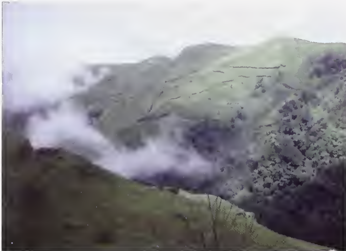
Fig. 6. Mt. Nimba, at 1750 m.

ted in 1953, but larger parts are currently explored for iron ore. The Simandou range is in the transition between the forest and savanna zones, offering a wide range of different habitat types. Especially the rain and montane gallery and ravine forest on the western slopes range far more North than anywhere else in West Africa (for more details see Rödel & Bangoura 2004a, b and literature cited therein). Three other forest sites were surveyed in November/December 2003: The Diéeké Classified Forest, situated about 25 km south of N'Zérékoré, comprises an area of 59,143 ha, with a mean altitude of 400–500 m a.s.l. The reserve comprises (almost) primary as well as secondary and highly degraded rainforest (for more details see Rödel et al. 2004). Currently it is under mining prospecting activities. The Mont Béro Classified Forest (26,850 ha) is situated at the northern limit of the rainforest zone, 56 km north of N'Zérékoré, 52 km south of Beyla and 40 km west of Lola. Its highest elevation is 1,210 m a.s.l. The dominant habitat types are semi-evergreen forest (Fig. 8) and savanna (Rödel et al. 2004). The Déré Classified Forest is situated at the eastern base of Monts Nimba and di-