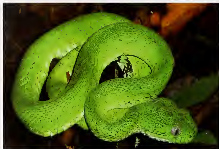
Fig. 21. Atheris chlorechis from Mt. Nimba (Photo: C. Brede).

Remarks: Apart from the altitude, this photographic record (Fig. 22) is remarkable because it shows a dorsal pattern where the light chevron marks typical for this species vanish already after the first half of the body, passing grad-