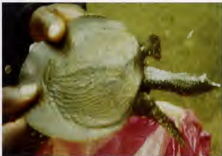
Fig. 10. Trionyx triunguis from Zياما Forest.

Remarks: Several photographs by W. Bützler, document the occurrence of this species in Zياما Forest near Sérédou where it does not seem to be rare: a hatchling from December 1991, and two adults in March 1995. MOR found it in Diécké Forest (Fig. 9). Villiers (1958) gave only the imprecise information “depuis Sierra Leone jusq'au Nord de l'Angola” et à Uganda. Cité aussi de Gambie (?). The latter questionable record is cited as a fact by Wer-muth & Mertens (1961): “Von Gambia südwärts bis Belgisch-Congo”. In contrast, Pritchard (1979) listed the countries with reliable records separately: in West Africa only Ivory Coast, Liberia and Sierra Leone. Ineich (2003), however, recorded two specimens from the Guinean part of Mt. Nimba, thus proving the existence of K. erosa in this country. Our photographic vouchers provided the second Guinean locality and the first site outside of Mt. Nimba. However, recent work revealed this tortoise to be more broadly distributed in Guinée forestière, viz. also in Déré and Diécké Forests as well as on Mt. Béro (Rödel & Bangoura 2006).