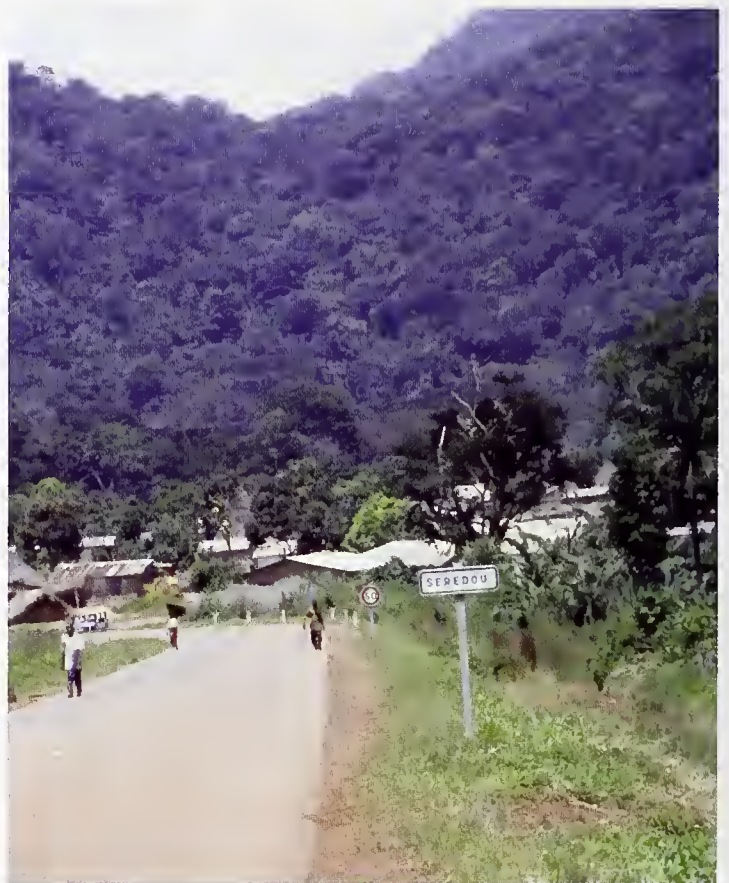
Fig. 2. Village of Sérédou, Ziama Forest, with forested slopes in background.

the Haut Niger National Park. These specimens, including the first record of the black mamba for Guinea, were left by us for publication to Eli Greenbaum to complement his and J.L. Carr's paper on the herpetofauna of this park (see Greenbaum & Carr 2005). They are summarized here