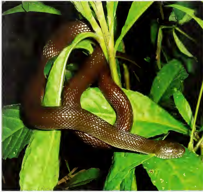
Fig. 18. Afronatrix anoscopus , unicoloured specimen from Mt. Nimba.