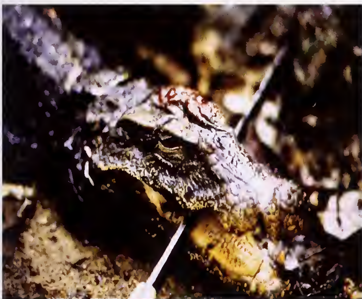
Fig. 24. Osteolaemus tetraspis killed by local hunter near Malweta village, Ziama Forest (Photo: W. Bützler).