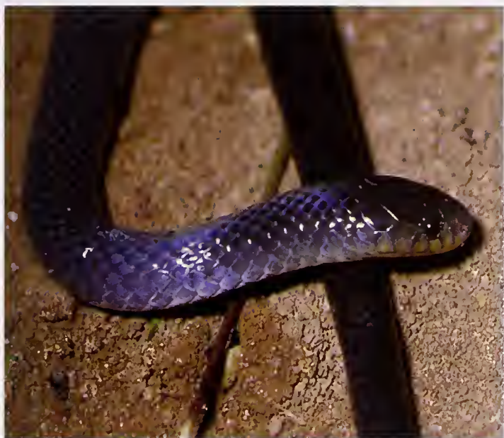
Fig. 20. Aparallactus modestus , ZFMK 82157, from Diécké Forest.

Remarks: At Malweta village, next to A. lineatus and A. niger , the sympatric occurrence of the third congener is proven.