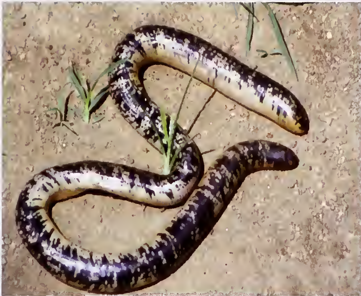
Fig. 12. Typhlops liberiensis , Diani River, near Nzérékoré.