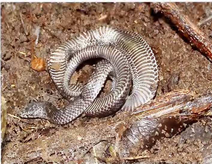
Fig. 15. Lycophidion sp., ZMB 75508 from Mt. Tétini, Déré Forest.

Material examined: 56121–122, Ziama Forest north of Sérédou: Balassou village, W. Böhme coll. 6–26 Oct. 1993; 58610, Ziama Forest west of Sérédou: Soundédou village, W. Bützler leg. Apr. 1994.