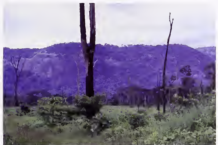
Fig. 5. Ziama Forest near Sérédou: reforestation of fire-degraded foreground with Terminalia sp., slopes in the background still with primary forest.

Further Guinean sites where surveyed with a main emphasis on amphibians. From 27 November to 6 December 2002, in autumn 2004 and in September 2008 we surveyed the Simandou Mountain Range, which extends for 100 km from Komodou in the north to Kouankan in the south. The altitudinal range is about 600 m with the Pic de Fon at the southern part being the highest peak (1,656 m a.s.l.: Fig. 7). Approximately 25,600 ha of this forest were protec-