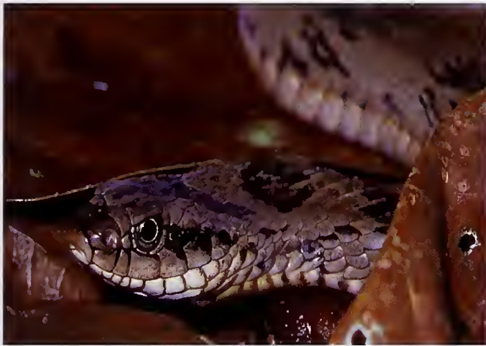
Fig. 23. Causus maculatus from Déré Forest.

Remarks: Recorded by Rödel & Bangoura (2006) also from Déré Forest (Fig. 23).