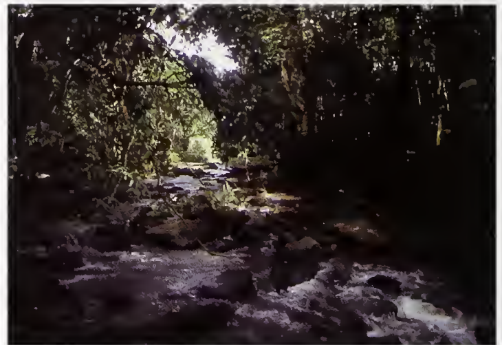
Fig. 8. Mt. Béro with one of its mountain creeks (Photo: M.-O. Rödel).

rectly borders Ivory Coast. It comprises lowlands and hillsides (highest peak Mont Tiéton, 740 m a.s.l.). Originally the vegetation consisted of evergreen rainforest, but most of the reserve is now in a very degraded state. From 22 April to 12 Mai 2005 we surveyed several sites in the Préfecture de Boké in north-west Guinea: Sarabaya (Rio Kapatehez), Kamsar et Boulléré. The survey focused on the (few) remaining forested sites and humid zones (for details see Hillers et al. 2006, 2008e). CB surveyed further sites in southeastern Guinea incl. Simandou and Mt. Nimba, the Zياما forest, and several sites in the Fouta Djallon.