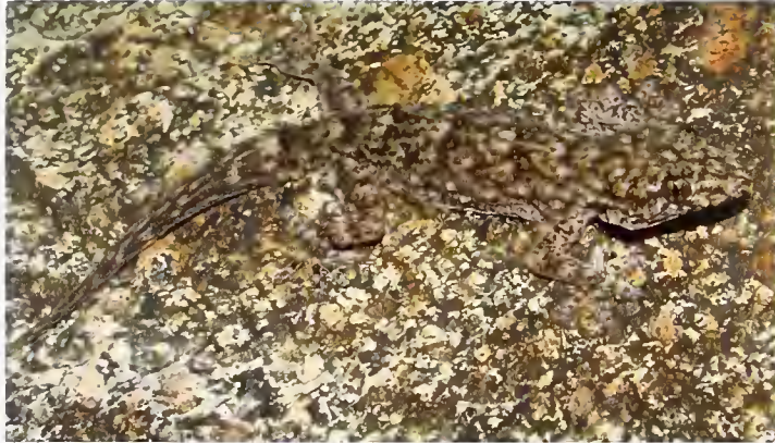
Fig. 26. Tarentola parvicarinata from Fouta Djallon Mts., W Guinea.

– Hemidactylus fasciatus – Rödel & Bangoura (2006): Diécké Forest; this paper; Mt. Nimba, photo record, C. Brede.