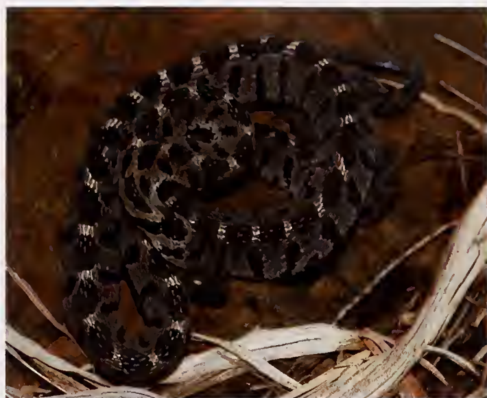
Fig. 16. Dasyveltis scabra , ZFMK 75496, from Mt. Nimba.

60569, Zياما Forest near Sérédou, W. Bützler coll. Jan./Apr. 1995.