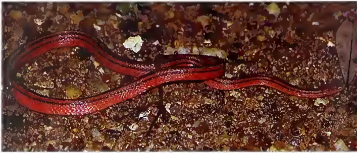
Fig. 14. Bothrophthalmus lineatus , ZFMK 82159, from Diécké Forest.

taxon brunnens . However, as east of the distribution range of the latter (eastern DRC, Ruanda) again typical lineatus are found, we prefer to regard both distinct forms as separate species.