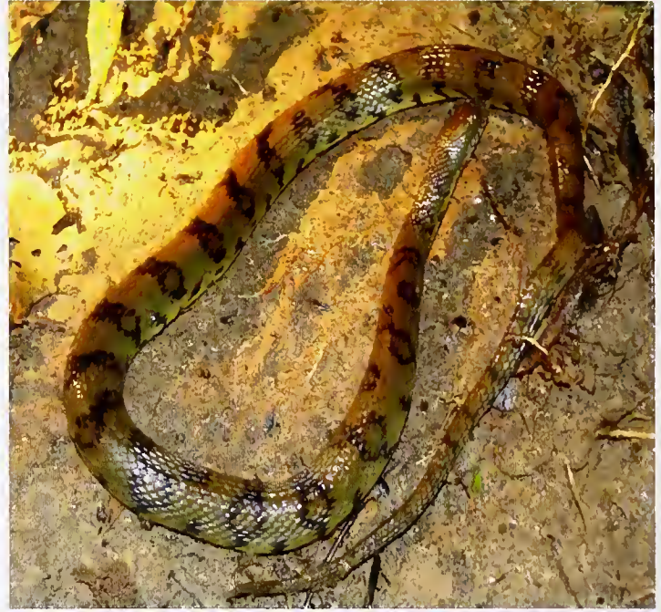
Fig. 19. Afronatrix anoscopus , patterned specimen from Pic de Fon.

Guinea exceeds that of our series in most of the data taken. A modern revision including also the central African populations seems highly desirable.