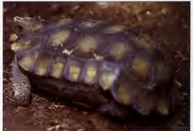
Fig. 9. Kinixys erosa from Diéeké Forest.

This paper aims to make the faunistic and autecological data of our material available, and to summarize the current state of knowledge of the reptile fauna of the Republic of Guinea in the form of a checklist.