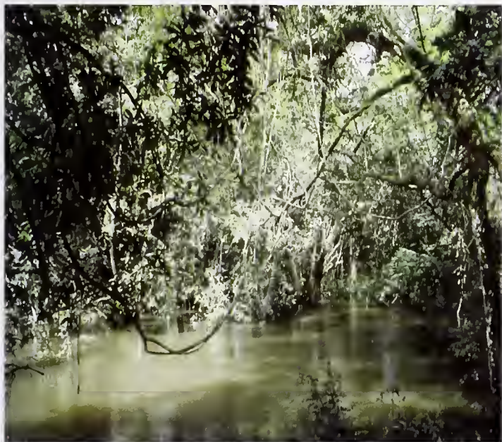
Fig. 4. Inundated lowland forest at Malweta village, Ziama Forest.

for completeness’ sake: Agama agama (ZFMK 64473–479), Chamaeleo gracilis (ZFMK 64489), Varamus exanthematicus (ZFMK 64471: head only), V. niloticus (ZFMK 66470), Crotaphopeltis hotamboeia (ZFMK 64467–468), Grayia smithii (ZFMK 64465–466), Philothamnus irregularis (ZFMK 64469), Psammophis el-