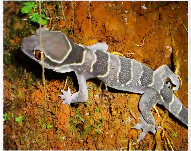
Fig. 11. Hemidactylus fasciatus , juvenile from Mt. Nimba.

Material examined: ZMB 75507, Mt. Nimba, 1274 m a.s.l., L. Sandberger coll. 5 August 2008.