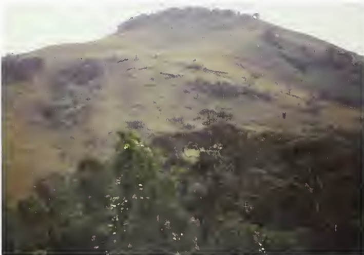
Fig. 7. Pic de Fon showing rain forest remnants (Photo: M.-O. Rödel).

ted in 1953, but larger parts are currently explored for iron ore. The Simandou range is in the transition between the forest and savanna zones, offering a wide range of different habitat types. Especially the rain and montane gallery and ravine forest on the western slopes range far more North than anywhere else in West Africa (for more details see Rödel & Bangoura 2004a, b and literature cited therein). Three other forest sites were surveyed in November/December 2003: The Diéeké Classified Forest, situated about 25 km south of N'Zérékoré, comprises an area of 59,143 ha, with a mean altitude of 400–500 m a.s.l. The reserve comprises (almost) primary as well as secondary and highly degraded rainforest (for more details see Rödel et al. 2004). Currently it is under mining prospecting activities. The Mont Béro Classified Forest (26,850 ha) is situated at the northern limit of the rainforest zone, 56 km north of N'Zérékoré, 52 km south of Beyla and 40 km west of Lola. Its highest elevation is 1,210 m a.s.l. The dominant habitat types are semi-evergreen forest (Fig. 8) and savanna (Rödel et al. 2004). The Déré Classified Forest is situated at the eastern base of Monts Nimba and di-