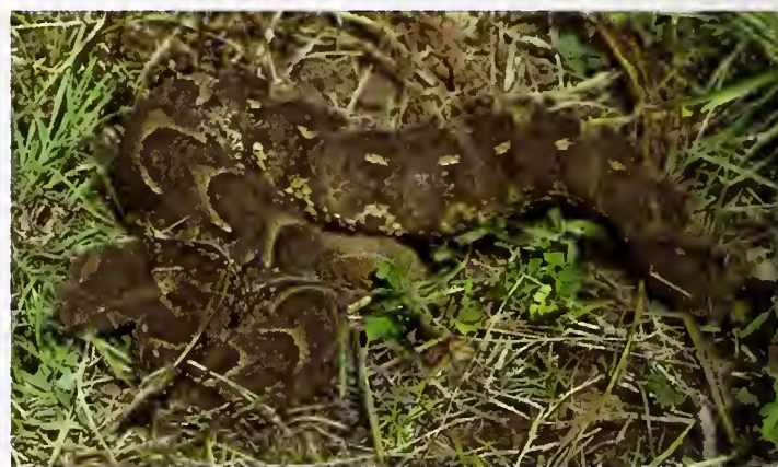
Fig. 22. Bitis arietans , specimen from Pic de Fon, 1600 m, note the restriction of chevron pattern to the anterior half of body.

ually into subquadrangular light spots. The same pattern type is seen in the photographic voucher from Kissidougou mentioned above and seems to be commoner in West Africa than a chevron-mark pattern along the entire body as it is typical for eastern and southern African populations.