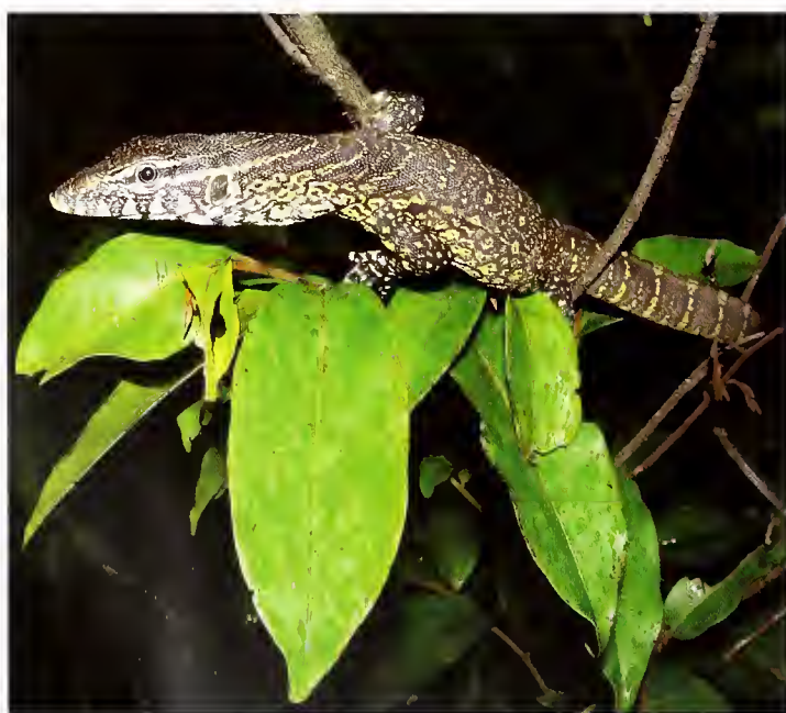
Fig. 30. Varanus uiloticus , juvenile specimen from the Fouta Djallon range, W Guinea.

– Lamproplis virgatus – Chabanaud (1921): N'Zérékoré (as Boodon virgatus ); Villiers (1950), Angel et al. (1954 b): Mt. Nimba (as Boaedon virgatus ); Condamin (1959): Sérédou; Böhme (2000): Ziama Forest; Ineich (2003): Mt. Nimba; this paper.