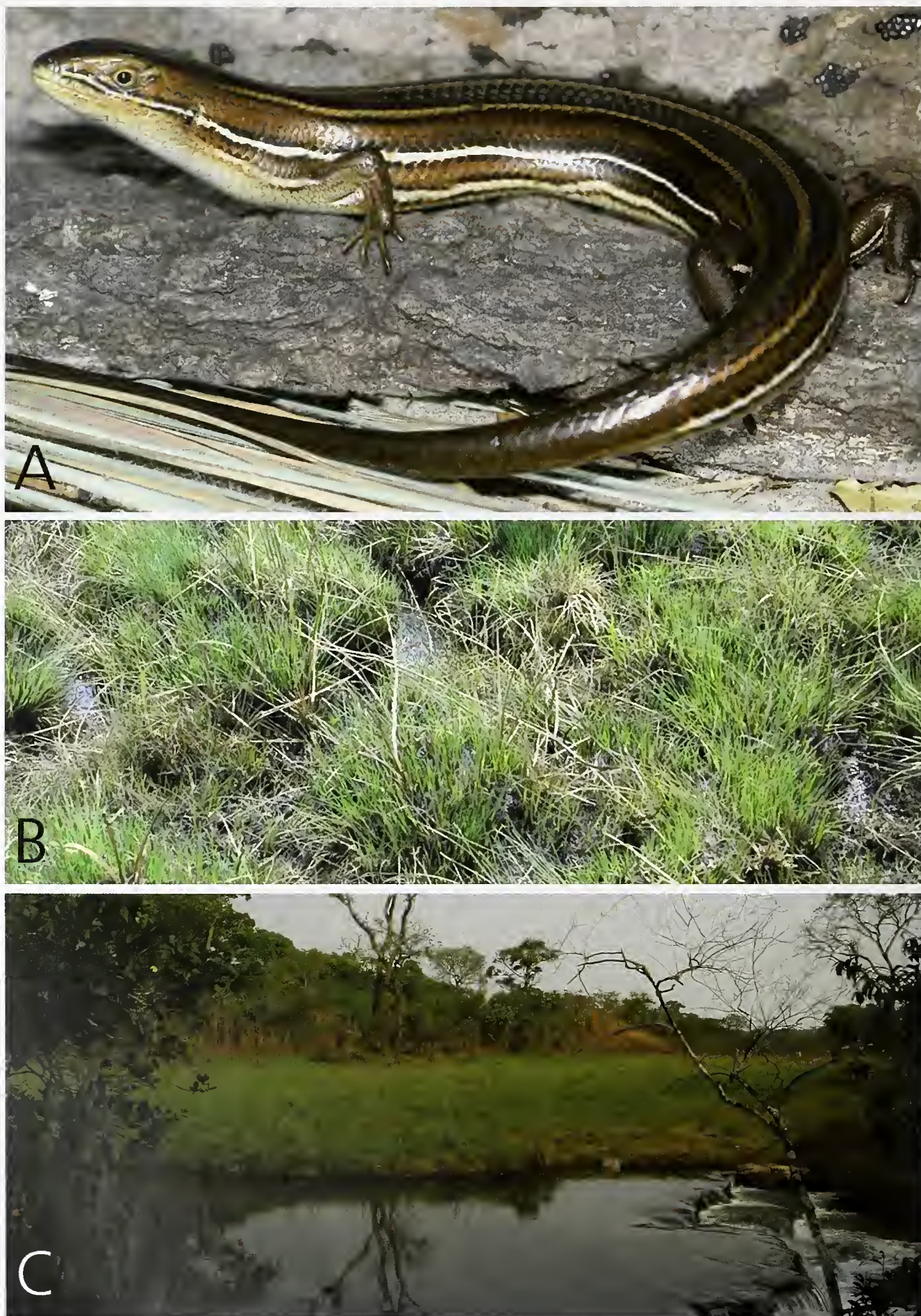
Fig. 3. Trachylepis ivensii . A = Specimen from Nchila Reserve, Hillwood Farm, Ikelenge, Zambia. B = Typical habitat of T. ivensii in the Nchila Reserve. C = Typical habitat of T. ivensii at the Zambezi north of Ikelenge.