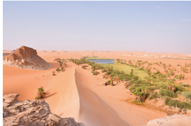
Fig. 4. View of Lake Boukou.

monocuspid. Upper profile of snout concave. Premaxilla extremely protrusible. Lower jaw distinctly prominent. Dorsal fin with 14 spines and 12 soft rays. Anal fin with 3 spines and 9 soft rays. Number of lateral-line scales: 29. Five dark blotches on sides, the first blotch confluent with the opercular spot, the fifth on caudal-fin base. Standard length 180 mm.