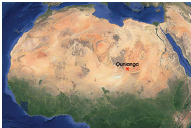
Fig. 1. Satellite view of the Sahara with location of Ounianga lakes (Chad).

Relict fish populations are known in several perennial bodies of waters of the Sahara desert, most of them located in mountainous massifs of central Sahara: the Adrar mountains in Mauritania, the Ahaggar, Tassili n'Ajjer and Mouydir in Algeria, and the Tibesti and Ennedi in Chad (Lévêque 1990, 2006; Trape 2009). Fish diversity is low, only two dozen of species have been recorded for the whole Sahara, and most species are known from a very low number of permanent water bodies, often from a single spring, guelta, pound or lake (Trape 2009). The number of species sharing the same water body usually ranges from one to three, with a maximum of four species