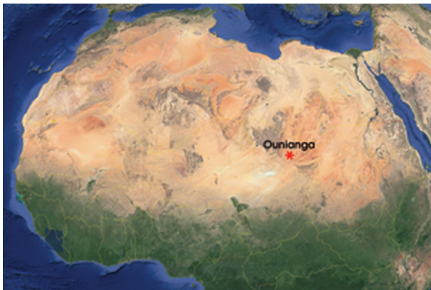
Fig. 1. Satellite view of the Sahara with location of Ounianga lakes (Chad).

Relict fish populations are known in several perennial bodies of waters of the Sahara desert, most of them located in mountainous massifs of central Sahara: the Adrar mountains in Mauritania, the Ahaggar, Tassili n'Ajjer and Mouydir in Algeria, and the Tibesti and Ennedi in Chad (Lévêque 1990, 2006; Trape 2009). Fish diversity is low, only two dozen of species have been recorded for the whole Sahara, and most species are known from a very low number of permanent water bodies, often from a single spring, guelta, pound or lake (Trape 2009). The number of species sharing the same water body usually ranges from one to three, with a maximum of four species