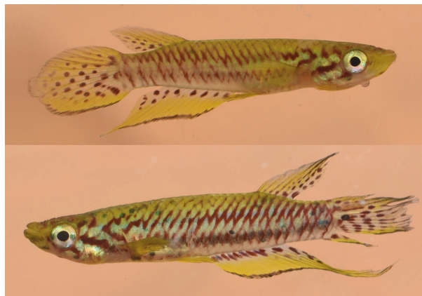
Fig. 5. Two specimens of Epiplatys bifasciatus from Lake Djara in life.

Material examined. MNHN 2016.0273, 5 specimens collected in Lake Djara (18°55'09"N, 20°53'39"E, elev. 355 m) (Fig. 6) on April 9 th 2016 by Jean-François Trape. Specimens were collected at night on the shore of the lake using a dipnet.