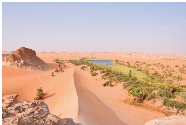
Fig. 4. View of Lake Boukou.

monocuspid. Upper profile of snout concave. Premaxilla extremely protrusible. Lower jaw distinctly prominent. Dorsal fin with 14 spines and 12 soft rays. Anal fin with 3 spines and 9 soft rays. Number of lateral-line scales: 29. Five dark blotches on sides, the first blotch confluent with the opercular spot, the fifth on caudal-fin base. Standard length 180 mm.