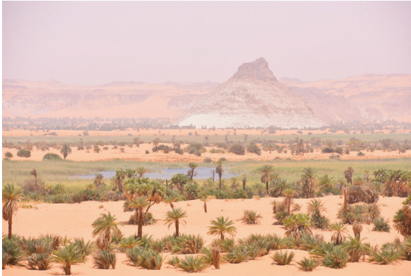
Fig. 6. View of Lake Djara.

Description. A tubular pre-ocular system with five pores. A frontal supra-orbital neuromast system consisting of one pit with two neuromasts. Dorsal fin 8–9 rays, anal fin 14–18 rays. Scales on mid-lateral series 26–27. Life colours of males (Fig. 5) are typical of this species (see Wildekamp & Van der Zee 2003) with in particular oblique red stripes on the opercle, a large number of oblique red bars on the sides and the back, a wide dark grey longitudinal band extending from the opercle to the caudal peduncle, and a number of red spots on the anal, dorsal and caudal fins. Standard length 37–39 mm.