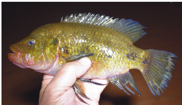
Fig. 3. Hemichromis fasciatus from Lake Boukou in life.

Description. Two lateral lines. Scales cycloid. No pharyngeal hanging pad between gills. Outer jaw teeth