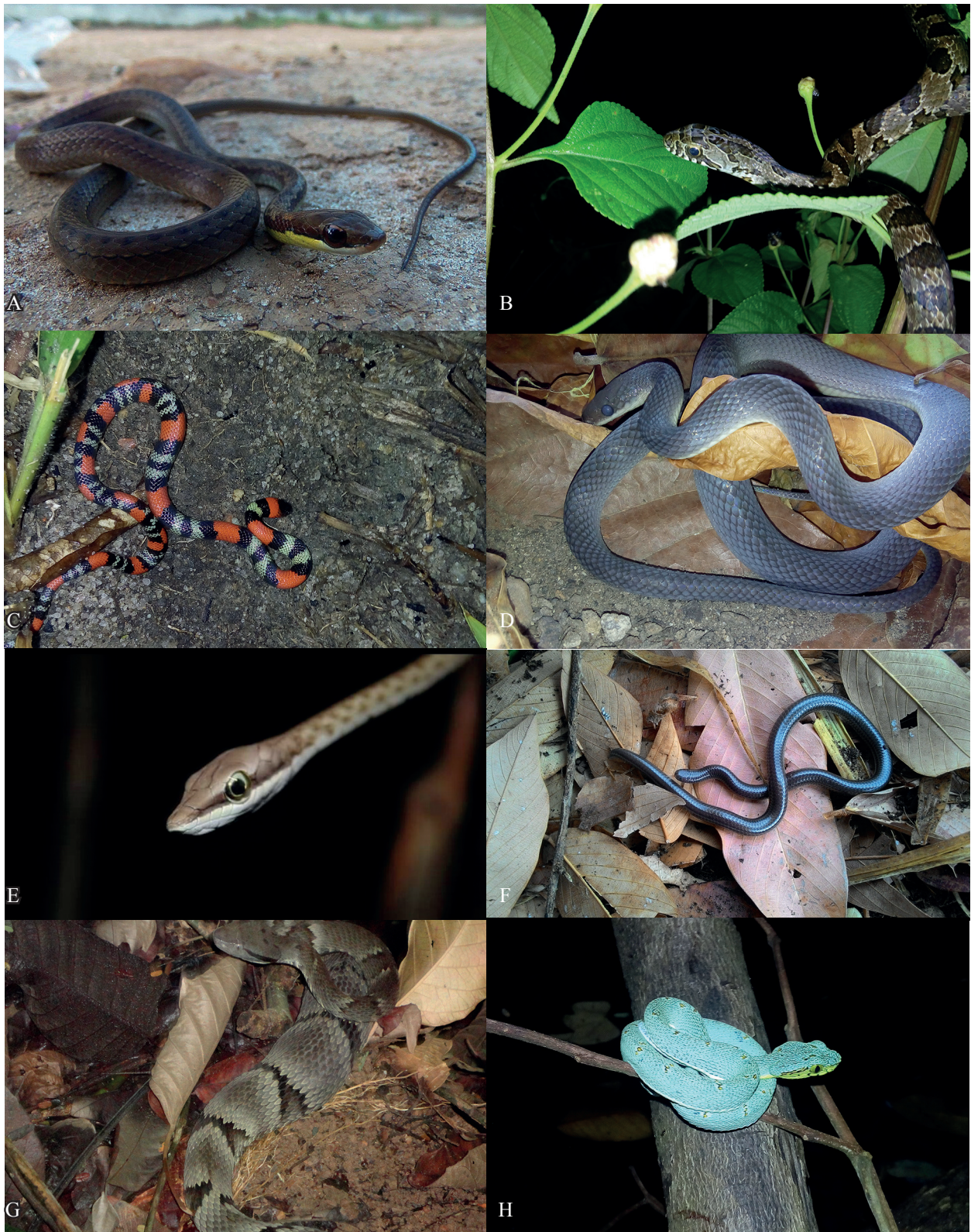
Fig. 4. Squamata recorded at Serra do Mandim and Serra Azul in southwestern Bahia, Brazil. A. Echinanthera cephalostriata ; B. Mastigodryas bifossatus ; C. Oxyrhopus trigeminus ; D. O. petolarius ; E. Oxybelis aeneus ; F. Trilepida salgueiroi ; G. Bothrops jararaca ; H. B. bilineatus .