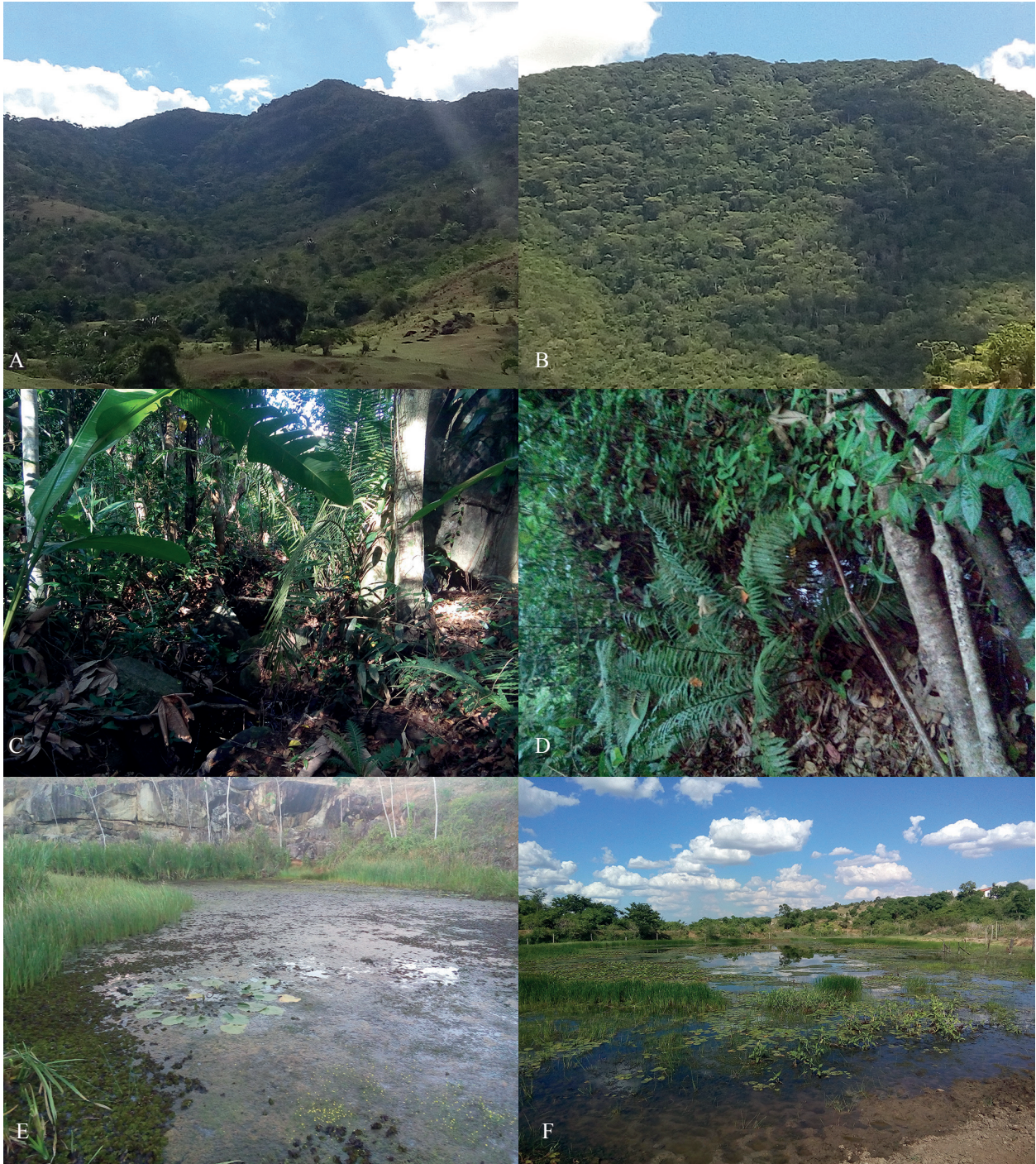
Fig. 2. Study areas in the southwestern region of Bahia. Fugiama farm in the Serra do Mandim (A, C and E). A: Semi-deciduous forest fragment; C: stream; E: permanent pond. Serra Azul farm in the Serra Azul (B, D and F). B: Semi-deciduous forest fragment; D: stream; F: permanent pond.

and emphasized the importance of more research aimed at other still under sampled groups, as, for example, reptiles. Therefore, the objective of our study was to inventory squamate reptile species from the Serra Azul and