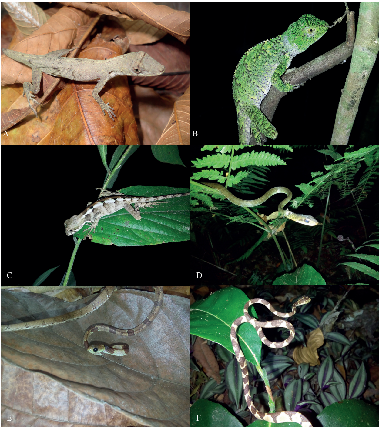
Fig. 3. Squamata recorded at Serra do Mandim and Serra Azul in southwestern Bahia, Brazil. A. Norops fuscoauratus ; B. Enyalius catenatus (male); C. E. catenatus (juvenile); D. Chironius fuscus ; E. Dipsas sazimai ; F. Imantodes cenchoa .

The rarefaction curve did not reach the asymptote and remained in ascending function (Fig. 5), even though 69% to 86% of the species indicated by the richness estimators (Chao 2 = 32.1 \pm 4.3 ; Jackknife 1 = 36.2 \pm 4.2 . Jackknife 2 = 39.2 and Bootstrap = 31.4) were sampled. However, the use of additional sampling methods as pit-