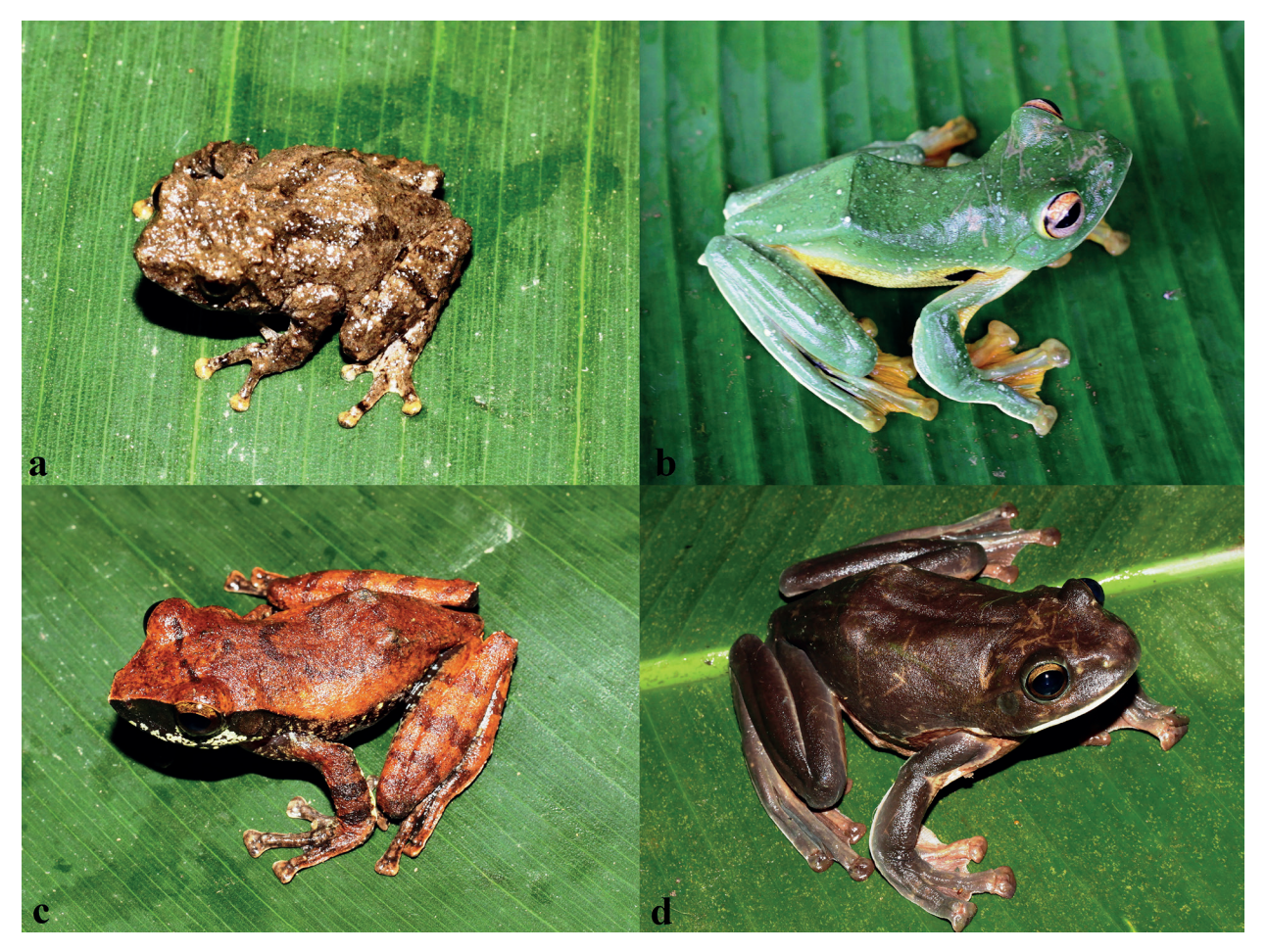
Fig. 3. Dorsolateral view of four newly recorded amphibian species from Tuyen Quang Province. a. Raorchestes parvulus (IEBR 4602). b. Rhacophorus kio (IEBR 4607). c. Rhacophorus orlovi (IEBR 4608). d. Zhangixalus pachyprotus (VNMN.06923).

Skin: Dorsal surface of head and body, upper part of flanks smooth; dorsal parts of limbs finely shagreened; ventral surface smooth.