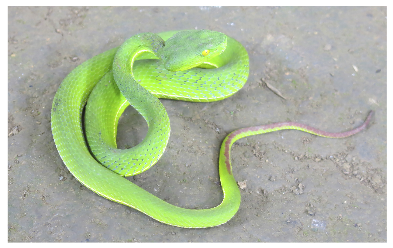
Fig. 5. Trimeresurus stejnegeri, adult male (IEBR 4759) from Tuyen Quang Province, Vietnam.

in a forest. The surrounding habitat was mixed secondary forest consisting of small hardwoods and shrubs. Air temperature was 30°C and relative humidity was 82%.