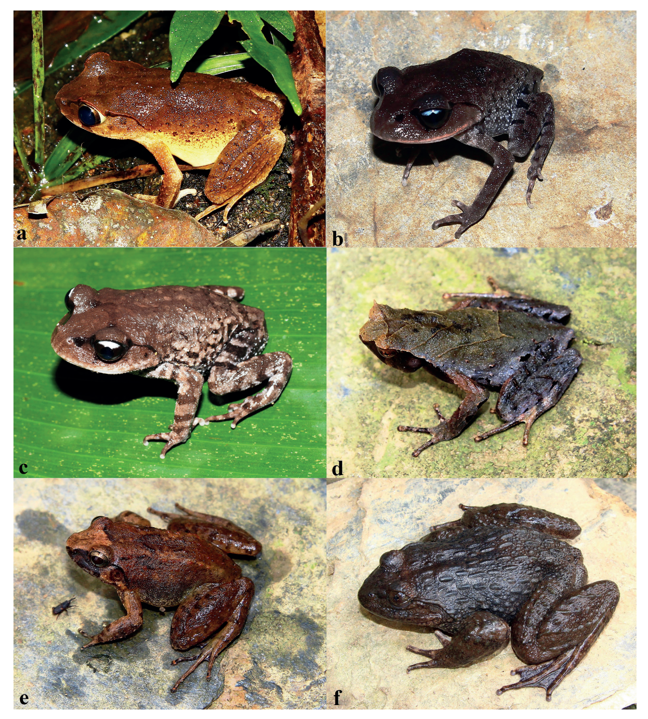
Fig. 2. Dorsolateral view of six newly recorded amphibian species from Tuyen Quang Province. a . Leptobrachella sungi (IEBR 4583). b . Leptobrachium chapaense (IEBR 4587). c . Leptobrachium guangxiense (IEBR 4589). d . Megophrys microstoma (IEBR 4590) e . Limnonectes limborgi (IEBR 4593) f . Quasipaa boulengeri (IEBR 4597).

Hindlimbs: Thigh short (FL 17.8–24.8 mm); tibia five times longer than wide (TbL 15.5–22.24 mm, TbW 3.1–5.7 mm); relative toe lengths I < II < III < V < IV; webbing formula I1-2III_{2}-2III1-3IV3-1V ; subarticular tubercles distinct; inner metatarsal tubercle oval.