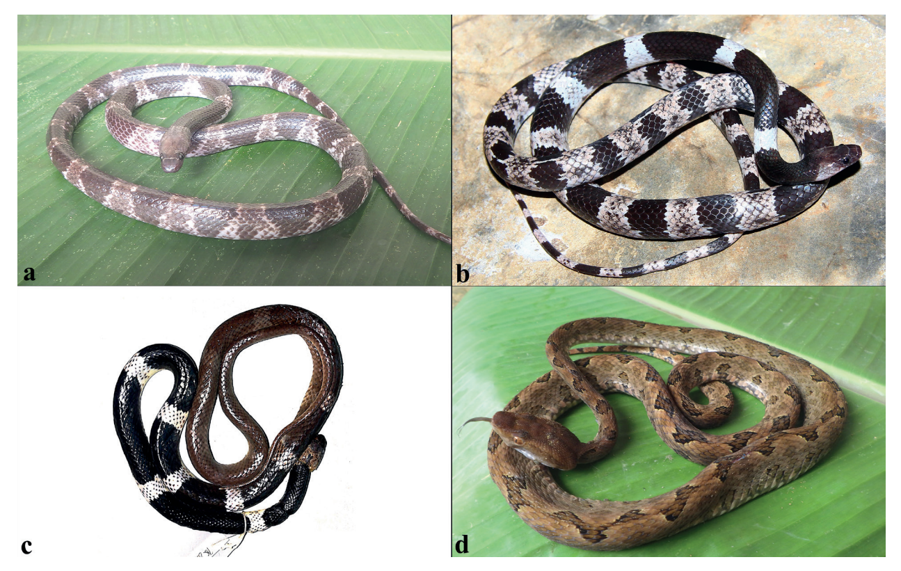
Fig. 4. a. Lycodon futsingensis, adult female (IEBR 4755). b. Lycodon pictus, adult female (IEBR 4756). c. Lycodon subcinctus, adult female (IEBR 4757). d. Protobothrops mucrosquamatus, adult male (IEBR 4758) from Tuyen Quang Province, Vietnam.

ing chin shields; dorsal scale rows 17–17–15, smooth; scales of the outer dorsal scale row slightly enlarged; ventrals 180–211; subcaudals 81–90, paired; cloacal undivided.