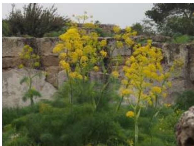
Ferula communis : Salamis. 2017 -03-12.