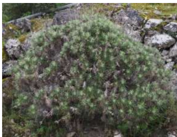
Ptilostemon chamaepeuce : Retaining walls above Karmi (Karaman). 2017-03-10.