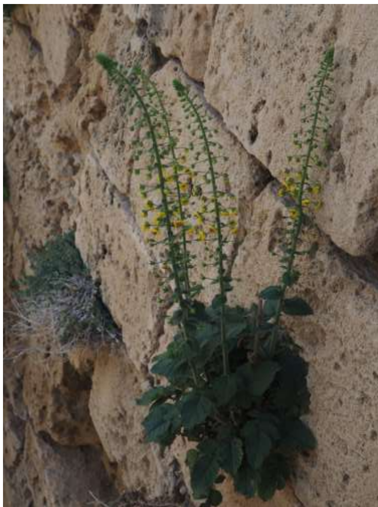
Verbascum levanticum : Kyrénia (Girne). 2019-03-13.