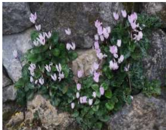
Cyclamen persicum : Karmi (Karaman). 2017-03-10.