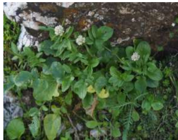
Valeriana italica : Kantara castle. 2019-03-15.