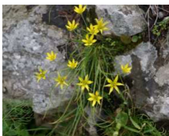
Gagea cf. peduncularis : St. Hilarion. 2017-03-1.