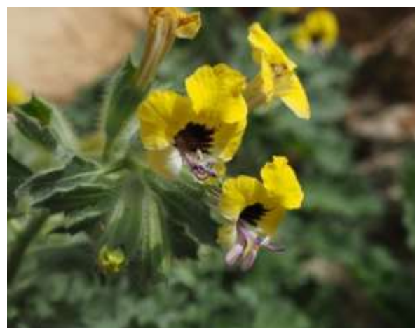
Hyoscyamus aureus : Famagusta (Gazimagusa). 2017-03-12.