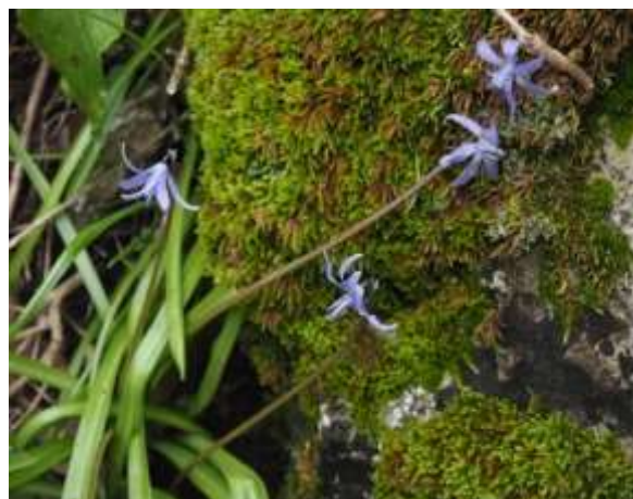
Scilla cilicica : St. Hilarion. 2019-03-13.