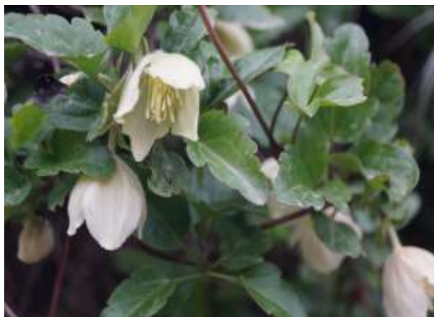
Clematis cirrhosa : Karmi(Karaman). 2017-03-10.