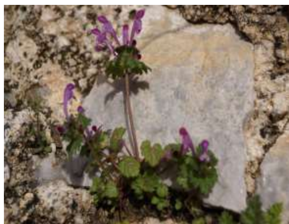
Lamium amplexicaule : St. Hilarion. 2017-03-13.