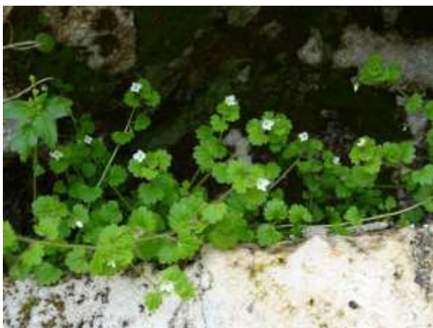
Veronica cymbalaria : St. Hilarion. 2019-03-12