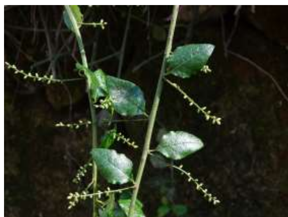
Borea cyprica : Bellapais (Beylerbeyi). 2019-03-11.