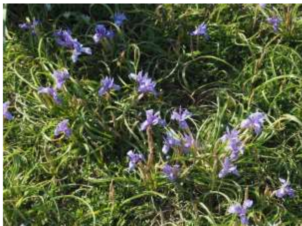
Moraea sisyriuchium : Kyrénia (Girne). 2019-03-13.