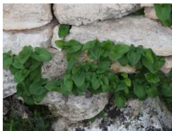
Arisarum vulgare : Karmi (Karaman). 2017-03-10.