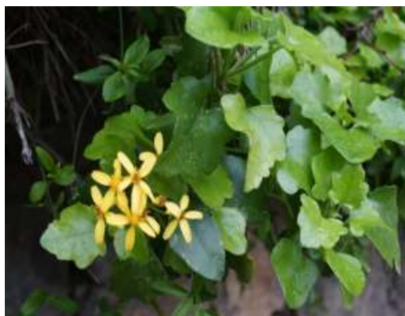
Senecio angulatus : Karmi (Karaman). 2017-0310.