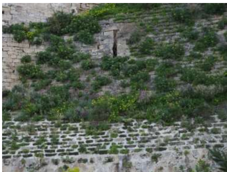
Kyrénia (Girne), vegetation (mainly Hyoscyamus aureus ) in fissures of the fort. 2019-03-13.