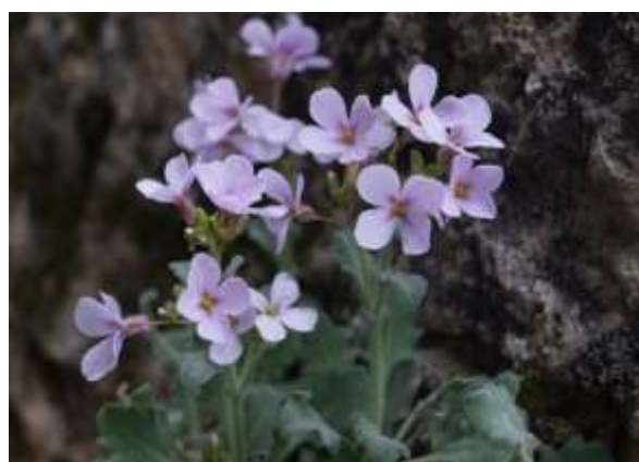
Arabis cyprica : St. Hilarion. 2019-03-12.