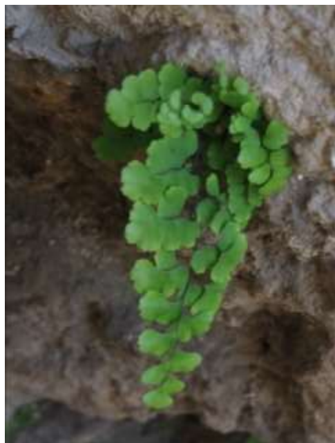
Adiantum capillus-veneris : Bellapais (Beylerbeyi). 2017-03-11.