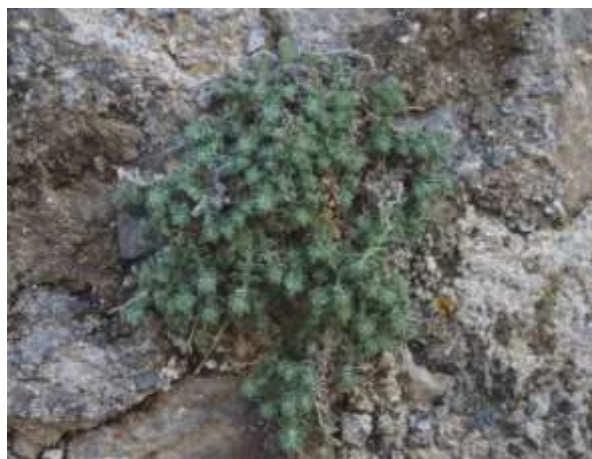
Galium canum : St. Hilarion. 2017-03-13.