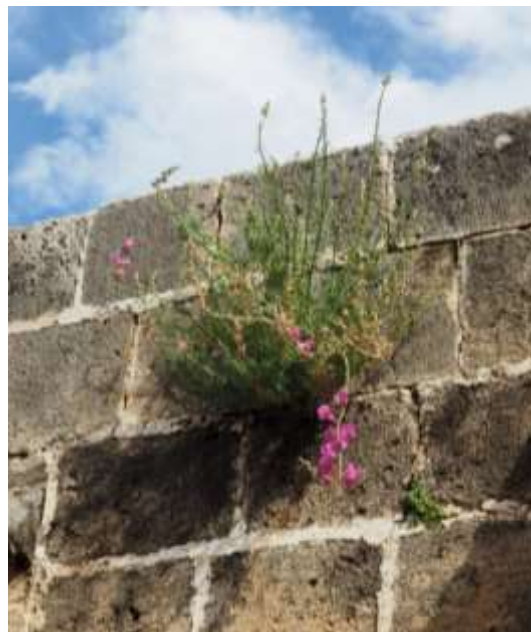
Antirrhinum majus : Bellapais (Beylerbeyi). 2017-03-11.