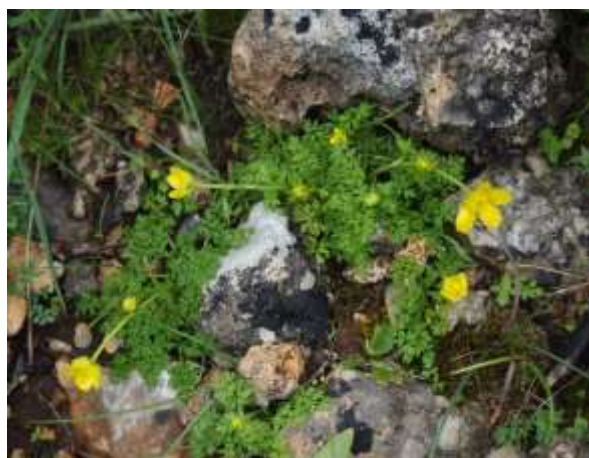
Ranunculus millefoliatus : Retaining wall in the Pentadactylos area. 2017-03-11.