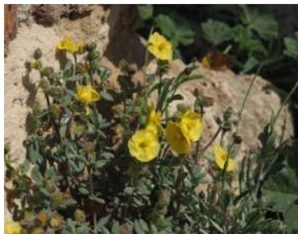
Helianthemum stipulatum : Salamis. 2017-03-12.