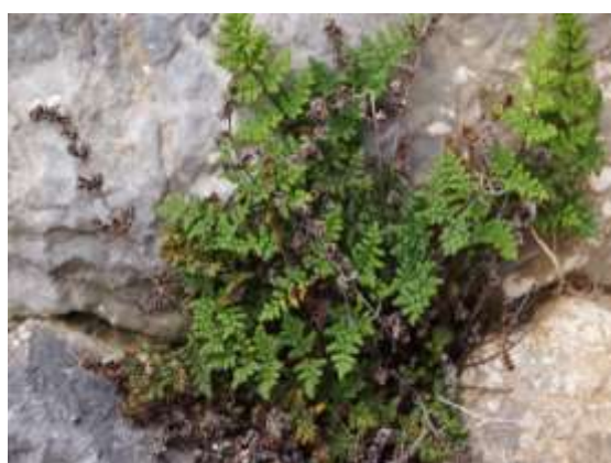
Cheilanthes acrostica : St.Hilarion. 2017-03-13.