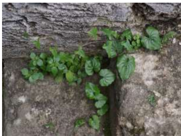
Dioscorea communis : Bellapais (Beylerbeyi). 2017-03-11.