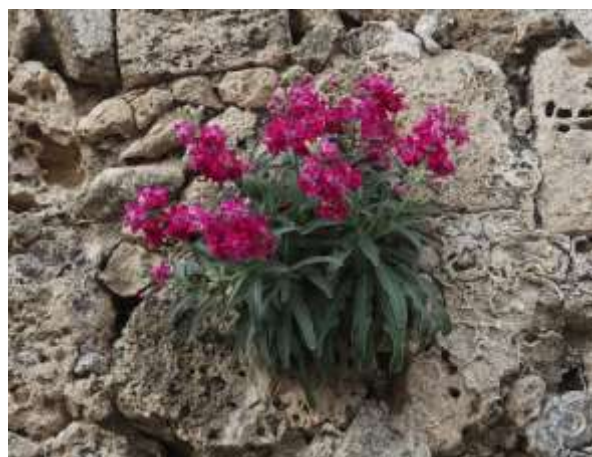
Matthiola incana : Kyrénia (Girne). 2018-03-13.