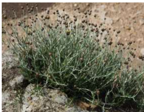
Phagnalon rupestre subsp. rupestre : Salamis. 2017-03-12.