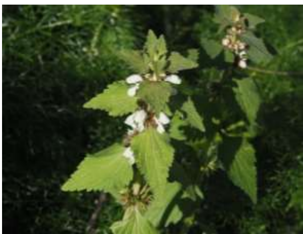
Lamium moschatum : Kyrénia (Girne). 2019-03-13.