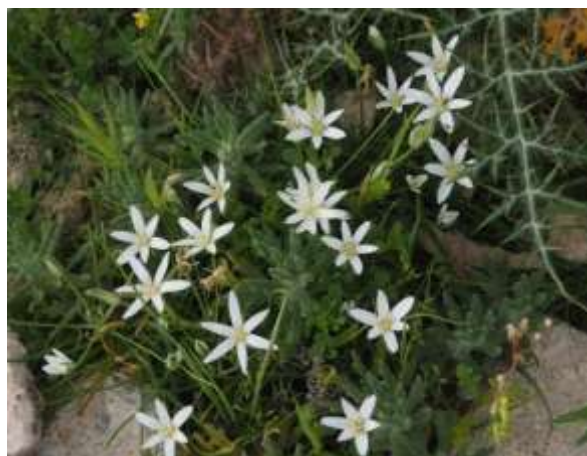
Ornithogalum pedicellare : Kyrénia (Girne). 2019-03-13.