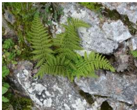
Dryopteris pallida subsp. libanotica : St. Hilarion. 2019-03-12.