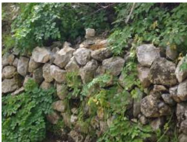
Smyrniurn olusatrum : St. Hilarion. 2017-03-13.