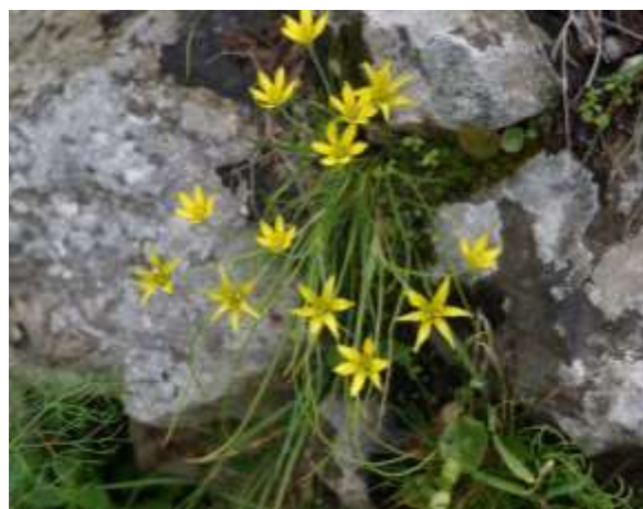
Gagea cf. peduncularis : St. Hilarion. 2017-03-1.