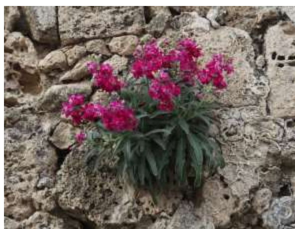
Matthiola incana : Kyrénia (Girne). 2018-03-13.