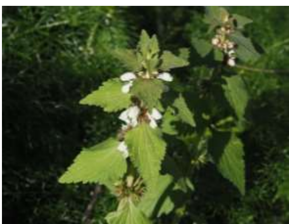
Lamium moschatum : Kyrénia (Girne). 2019-03-13.