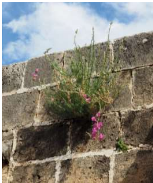
Antirrhinum majus : Bellapais (Beylerbeyi). 2017-03-11.