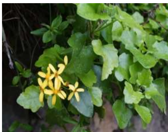
Senecio angulatus : Karmi (Karaman). 2017-0310.