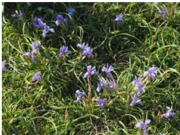
Moraea sisyriochium : Kyrénia (Girne). 2019-03-13.