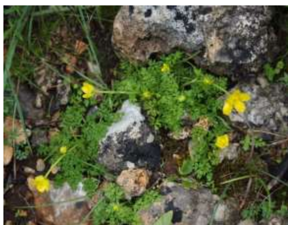
Ranunculus millefoliatus : Retaining wall in the Pentadactylos area. 2017-03-11.