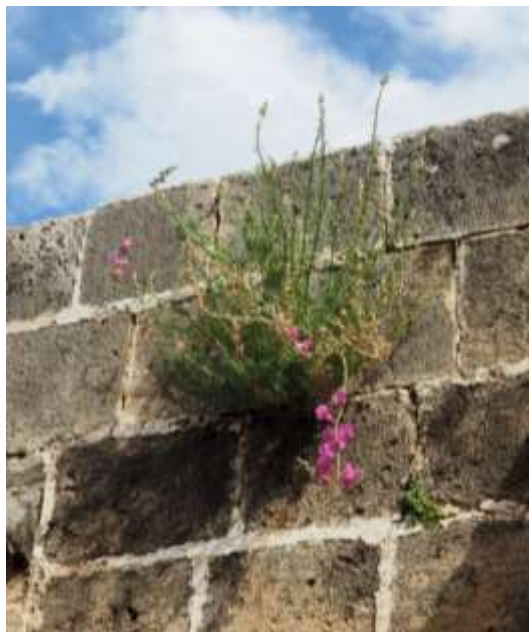
Antirrhinum majus : Bellapais (Beylerbeyi). 2017-03-11.