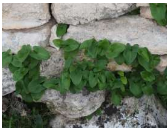
Arisarum vulgare : Karmi (Karaman).2017-03-10.