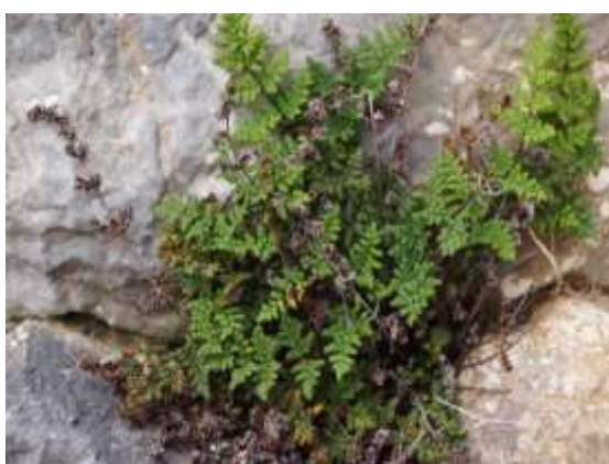
Cheilanthes acrostica : St.Hilarion. 2017-03-13.