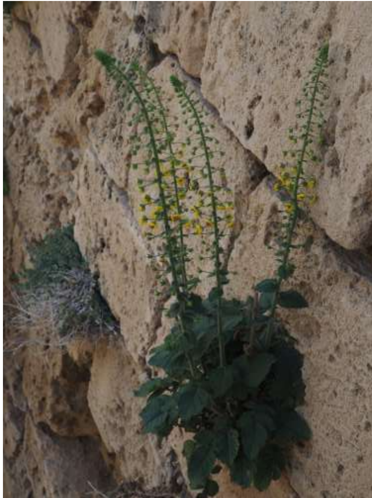
Verbascum levanticum : Kyrénia (Girne). 2019-03-13.