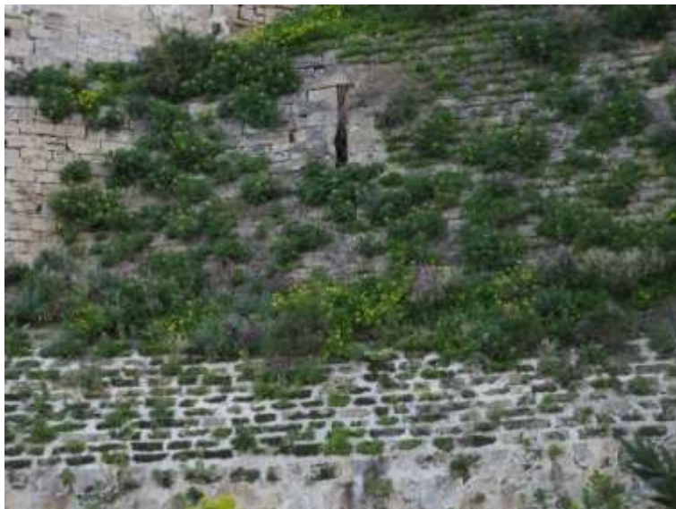
Kyrénia (Girne), vegetation (mainly Hyoscyamus aureus ) in fissures of the fort. 2019-03-13.