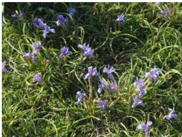
Moraea sisyrinchium : Kyrénia (Girne). 2019-03-13.