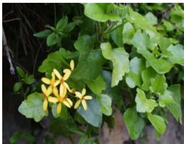
Senecio angulatus : Karmi (Karaman). 2017-0310.