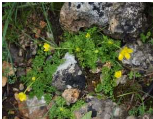
Ranunculus millefoliatus : Retaining wall in the Pentadactylos area. 2017-03-11.