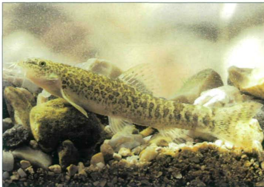
Fig. 6: Nemacheilus insignis from Mujib River.

Dorsal fin extending over much of body length. Dorsal fin rays usually over 30 without a leading spine. Dorsal fin discontinuous or united to caudal fin. Wide gill openings. Barbels 4 pairs. Airbreathing is accomplished with a labyrinthic organ arising from