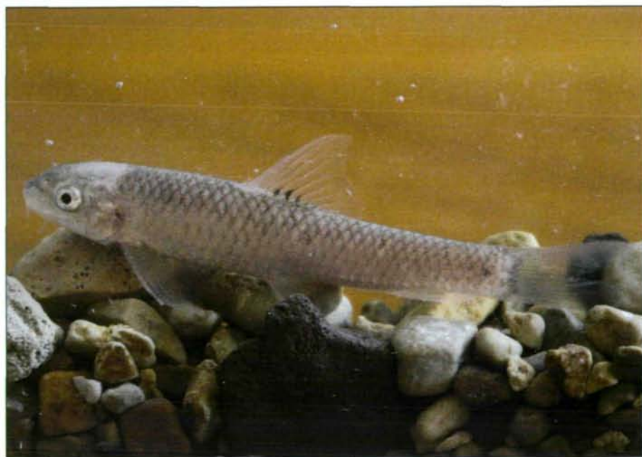
Fig. 5: Garra rufa from Zarka River.

origin. HAMIDAN & MIR (2003) found this species to survive in streams with temperature ranged from 23,5°C in Wadi al-Hassa and Khneizera dam to 41°C in Afra hot spring and Wadi al-Burbaita. The population structure of G. ghorensis in most localities showed a disturbed population where few Young of Year (YOY) fish have success to survive. This fish inhabits shallow, fast and clear waters with stony beds. It remains attached to the stony bottom with the help of an adhesive pad which lies on the ventral side of the head. (HAMIDAN & MIR 2003).