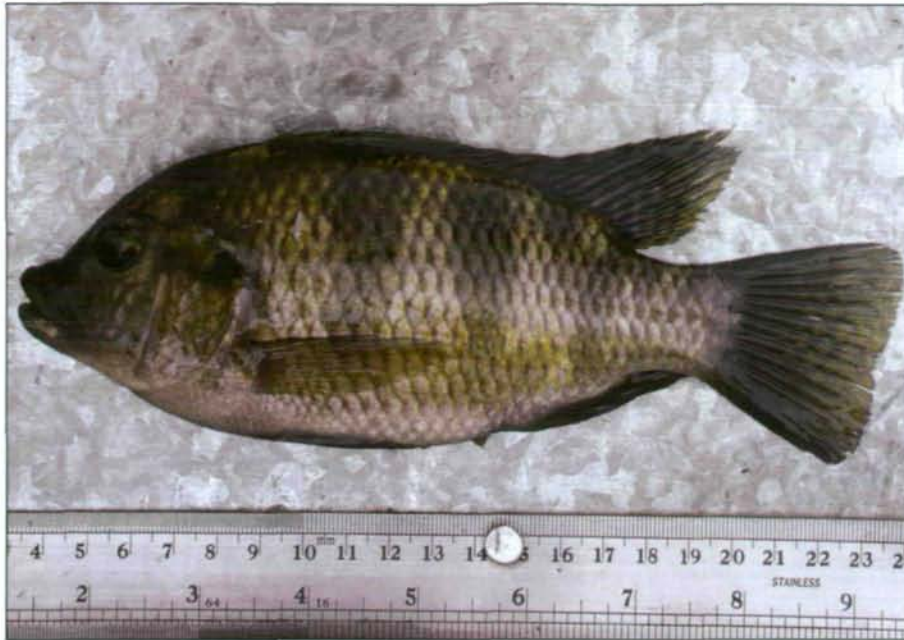
Fig. 11: Tilapia zillii is a common species in the Jordan valley.

Azraq Oasis. It was found to compete with the endemic fish, A. sirhani , for breeding ground since it guards its egg and had territorial behaviour (being very aggressive) towards any other fish that comes close to its nest. Direct predation of other fishes was observed.