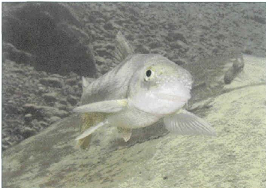
Fig. 2: Capoeta damascina showing breeding tubercles from Hydan River.

Diagnosis: Medium sized cyprinid. Pelvic fin origin posterior to dorsal fin origin, dorsal fin with four unbranched and