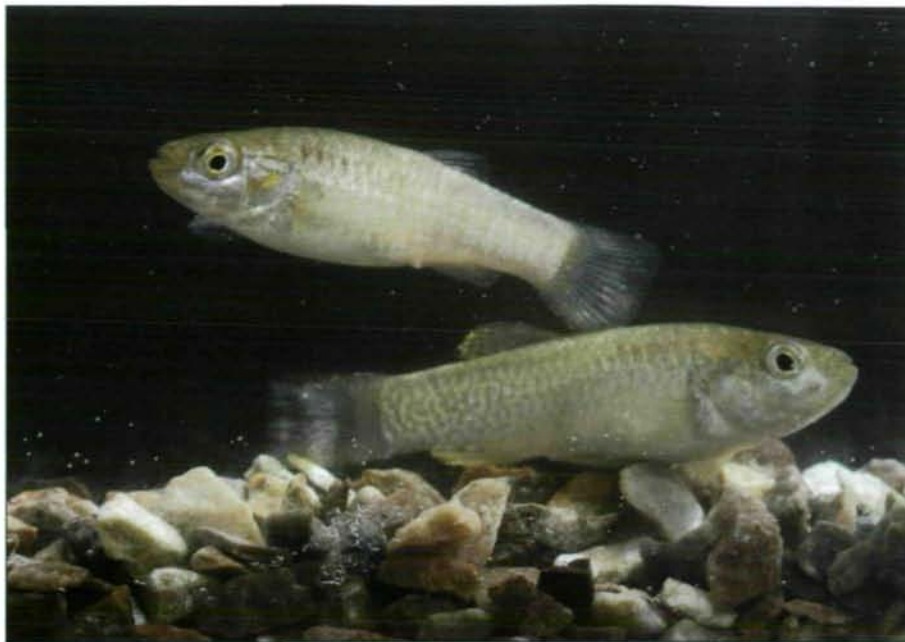
Fig. 7: Aphanius dispar richardsoni showing male (above) and females (below) from Fifa.