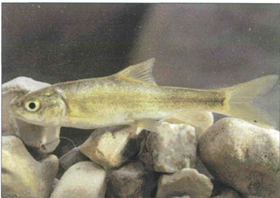
Fig. 3: Capoeta damascina from Mujib River.

Remarks: This is an endemic species to the Dead Sea region. It was originally described as a subspecies of G. tibanica , however, later studies revealed that G. ghorensis is separate from G. tibanica (KRUPP 1982). The species is believed to have an African