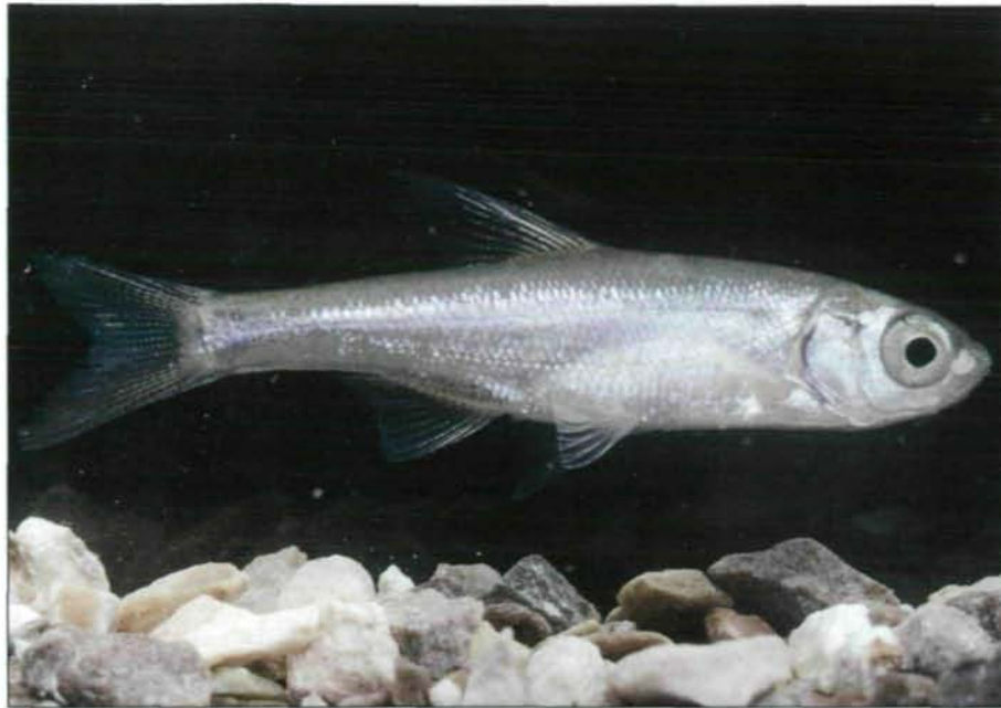
Fig. 1: Acanthobrama lissneri is an endemic species to the Jordan River basin.

or absent. Praemaxilla usually borders the upper jaw making the maxilla entirely or almost entirely excluded from the gape. Upper jaw is usually protrusible. Dorsal fin with spine-like rays in some species. Maximum length at least 2,5 m to probably 3 m in Catlocarpio siamensis ; many species are less than 5 cm (NELSON 1994).