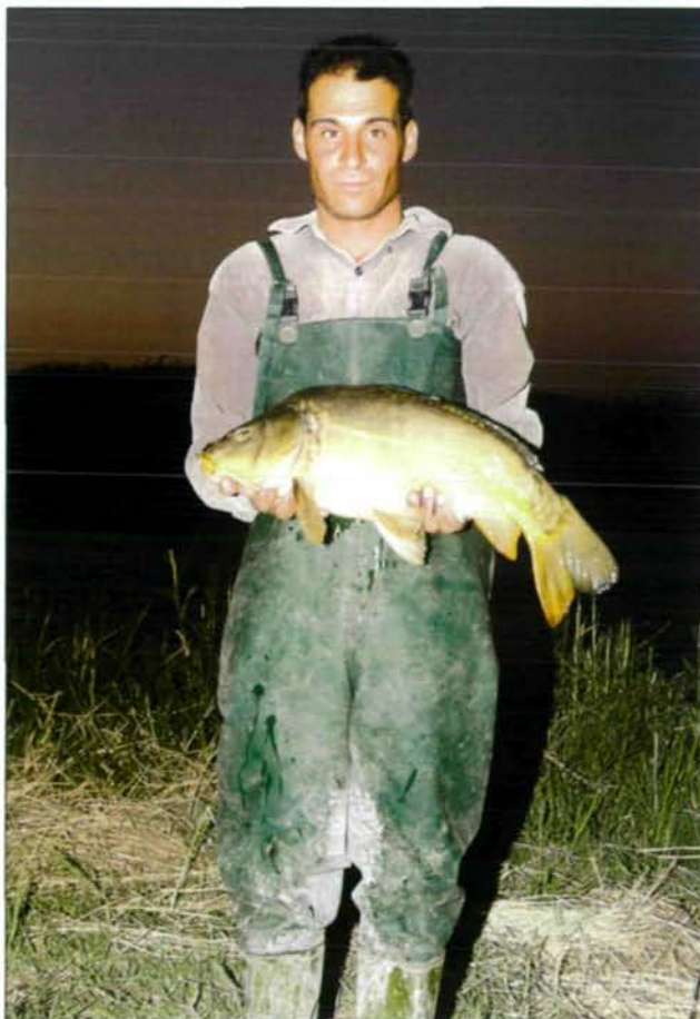
Fig. 12: Cyprinus carpio is an introduced species. This specimen was collected from Azraq pools.

Remarks: Both male and female participate in mouthbrooding and juveniles are released at about 12 mm (TREWAVAS 1983). Recent field studies in Azraq failed to capture this species.