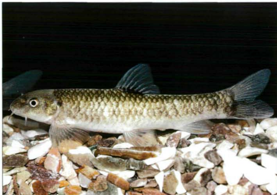
Fig. 4: Garra ghorensis from Ain Al Haditha.

origin. HAMIDAN & MIR (2003) found this species to survive in streams with temperature ranged from 23,5°C in Wadi al-Hassa and Khneizera dam to 41°C in Afra hot spring and Wadi al-Burbaita. The population structure of G. ghorensis in most localities showed a disturbed population where few Young of Year (YOY) fish have success to survive. This fish inhabits shallow, fast and clear waters with stony beds. It remains attached to the stony bottom with the help of an adhesive pad which lies on the ventral side of the head. (HAMIDAN & MIR 2003).