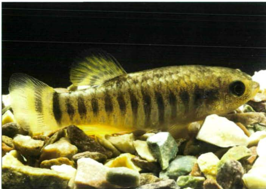
Fig. 8: Aphanius sirhani male from Azraq pools.

Remarks: The species is threatened of extinction due to extensive water extraction from Azraq oasis (KRUPP & SCHNEIDER 1989). Recent efforts to recover the population of this threatened species in Azraq Wetland Reserve begun since 2000.