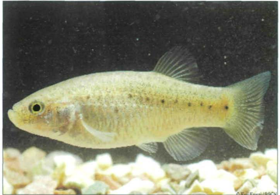
Tilapia zillii (GERVAIS 1848) (Fig. 11)

Medium size cichlids, anal fin with three spines, and scales usually cycloid. Substrate spawner and guarders of the brood, sexual dimorphism, dichromism minimal or missing (KRUPP & SCHNEIDER 1989).