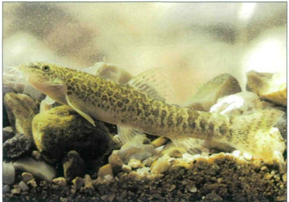
Fig. 6: Nemacheilus insignis from Mujib River.

Dorsal fin extending over much of body length. Dorsal fin rays usually over 30 without a leading spine. Dorsal fin discontinuous or united to caudal fin. Wide gill openings. Barbels 4 pairs. Airbreathing is accomplished with a labyrinthic organ arising from