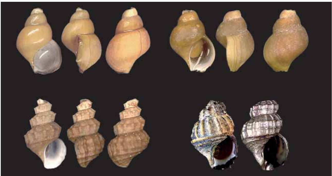
1 top left: P. laevis ; top right: P. variabilis ; bottom left: P. ios ; bottom right: P. buccinoides