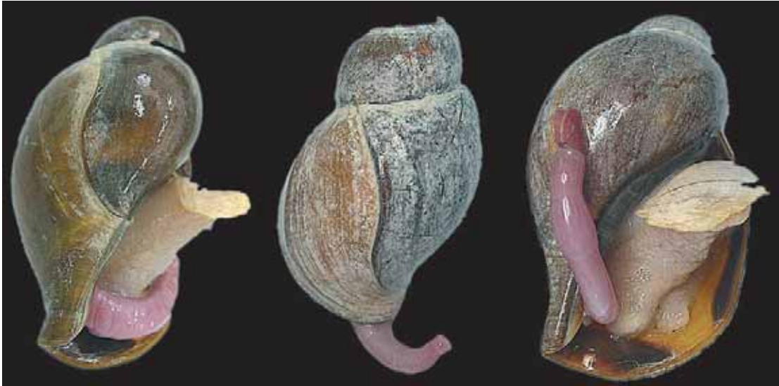
2: E. auzendei, in vivo specimens