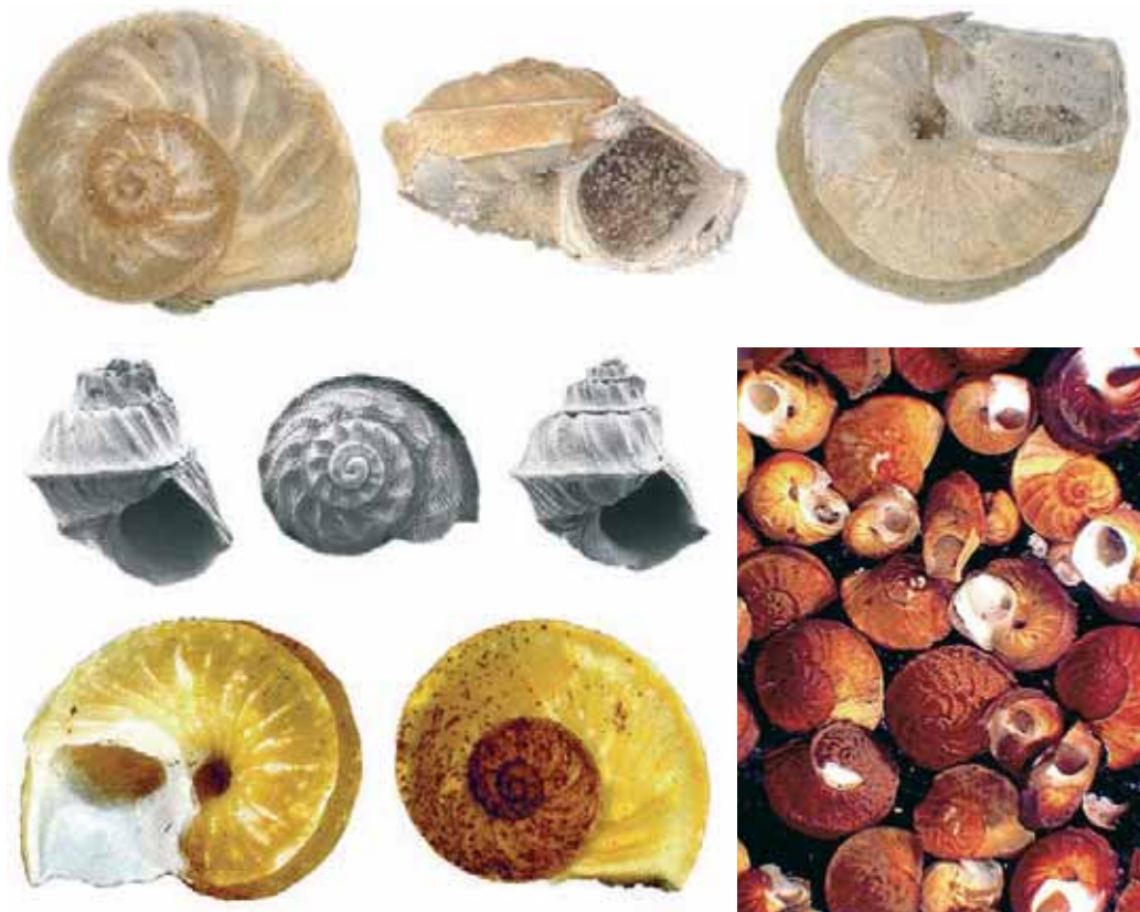
1: Top: M. aurantiaca ; middle: M. aurantiaca ; bottom: M. galeronae

Biology: Genus with three species endemic in vents. The species are locally common in washings of Riftia , Ridgeia , Calyptogena and Alvinella . Genus endemic to vents. Food consists of the detrital surface layer of the bottom. Larval development lecithotrophic with planktonic dispersal stage.