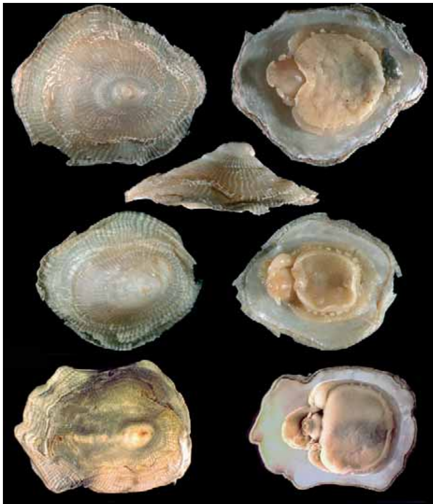
1: S. regularis

Biology: Symmetromphalus regularis occurs in dense aggregations on the walls of vents; the species at Lau and Fiji lives on mussels and on the subsutural ramp of Ifremeria nautili . Endemic to vents. Sexually dimorphic, with males much smaller. Feeding biology not known. Pallial furrow and especially epipodial tentacles with growth of large filiform bacteria. Larval development lecithotrophic with planktonic dispersal stage.