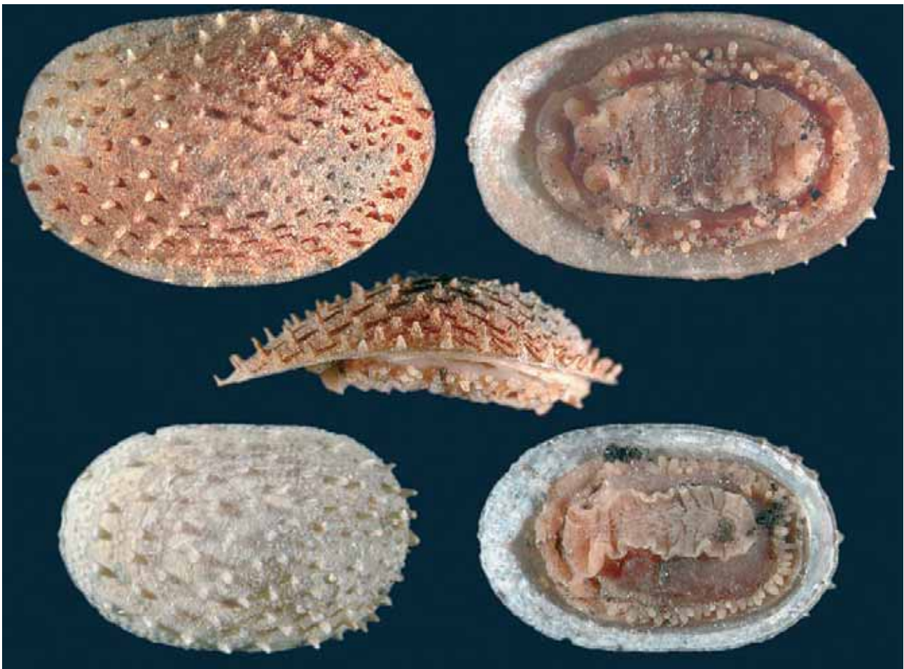
1: Two specimens in various views; by R. von Cosel.

Distribution: East Pacific Rise: 21°N, 13°N.