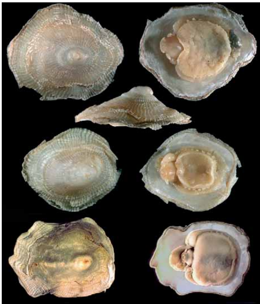
1: S. regularis

Biology: Symmetromphalus regularis occurs in dense aggregations on the walls of vents; the species at Lau and Fiji lives on mussels and on the subsutural ramp of Ifremeria nautili . Endemic to vents. Sexually dimorphic, with males much smaller. Feeding biology not known. Pallial furrow and especially epipodial tentacles with growth of large filiform bacteria. Larval development lecithotrophic with planktonic dispersal stage.