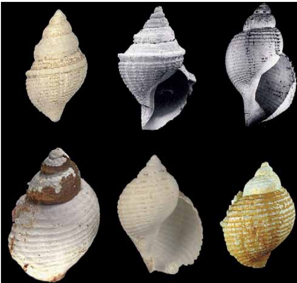
1 top row, left to right: Two specimens of P. carinatus ; one specimen of P. moskalevi ; bottom row: Three specimens of P. ovatus, from Mid-Atlantic Ridge

Biology: Often observed at the periphery of dying vents, probably predator on molluscs and scavenger. Genus known from seeps and vents as well as free-living. Larval development planktotrophic.