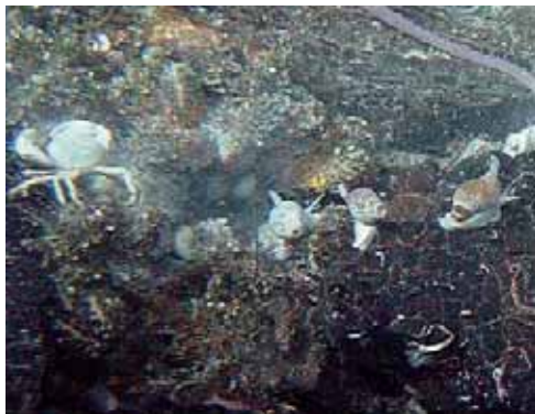
3: E. auzendei in situ, with bythograeid crab, chiridotid holothurian and serpulid worm Laminatubus alvini from southern East Pacific Rise, cruise Biospeedo.