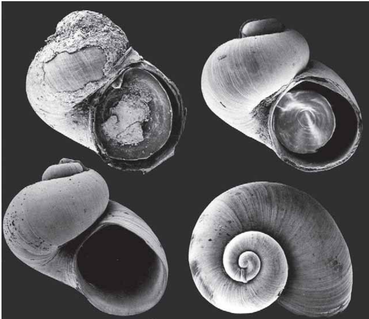
1 upper left: Specimen 1, 1.19 mm, apertural view, with periostracum; upper right: specimen 2, 1.19 mm, cleaned; both from cruise Biolau, Lau Back-Arc Basin; lower left: specimen 3, apertural view, 2.31 mm; lower right, specimen 4, apical view, 1.9 mm; both cruise Starmer II North Fiji Back-Arc Basin; after WARÉN & BOUCHET (1993).

Distribution: North Fiji and Lau Back-Arc Basins.