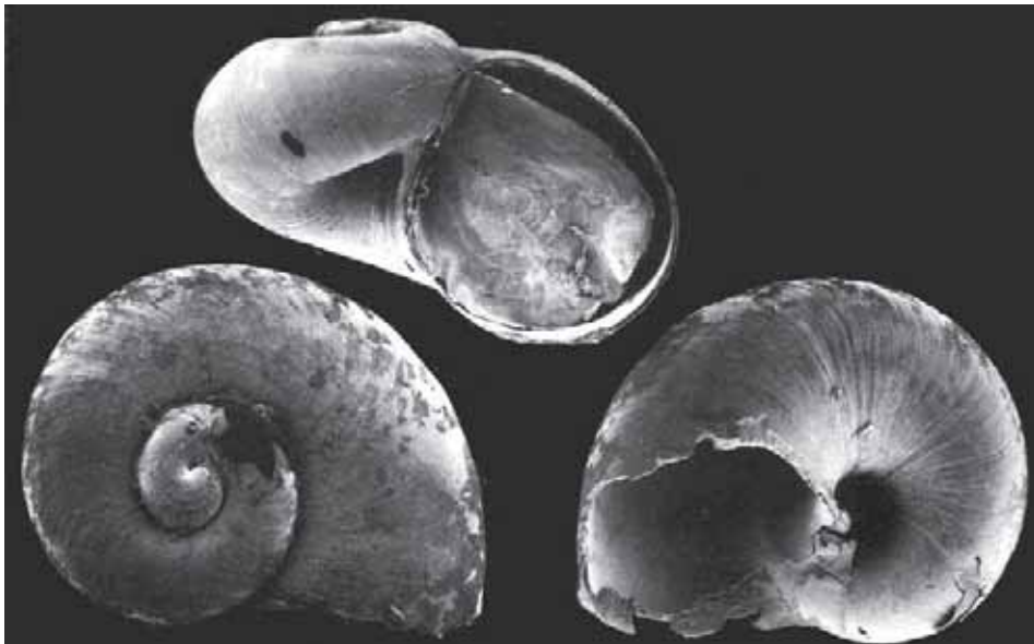
1 top: holotype apertural view, 1.56 mm; bottom: paratype 1.10 mm, apical and basal view; Lau Basin; from WARÉN & BOUCHET (1993).

Distribution: Only known from Lau Back-Arc Basin: Hine Hina vent field.