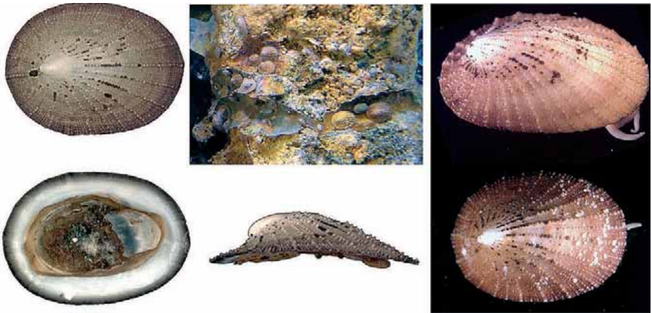
2: L. cristatus , on an active chimney, near an alvinellid colony; East Pacific Rise: 13°N; cruise Phare.