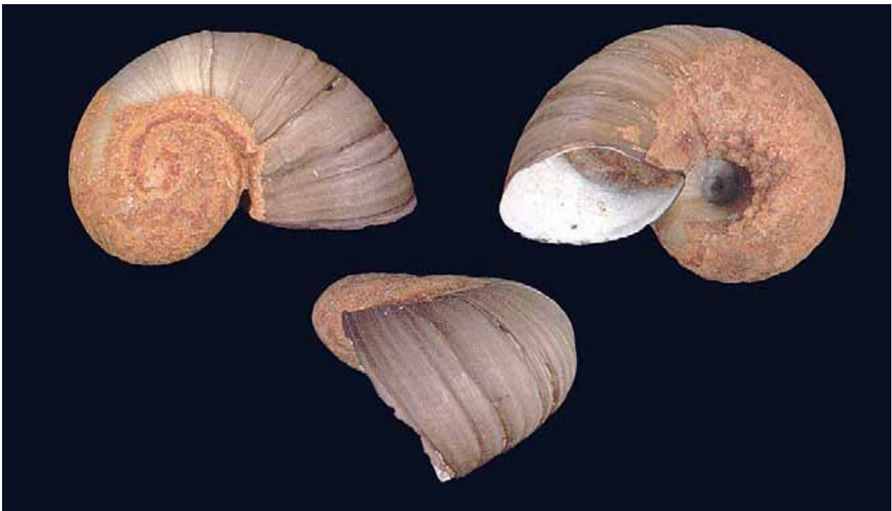
1 top left, right and bottom: Dorsal, ventral and apertural view of P. planispira

Biology: Found in washings of tubes of Alvinella and siboglinids. Genus endemic to vents. Stomach contained only undefined organic material. Larval development lecithotrophic with planktonic dispersal stage.