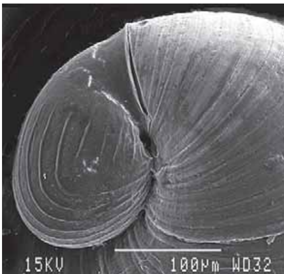
4: Larva (SEM)