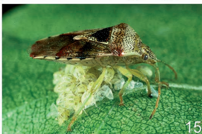
Figs 12-15: (12-14) A pair of Elasmucha grisea in tail-to-tail copulation position. While walking around on birch leaves and branches, male and female remain in copula up to 6 days. The bigger female is always leading with the male following. Here, the female is more vividly coloured, and the male appears duller overall. (15) Female guards her newly hatched first instar nymphs. First instar nymphs aggregate on empty eggshells. Female remains in the same guarding position while guarding her egg-clutch and first instar nymphs.

Males and females meet on birch and while in copula they walk around on leaves and branches until the female oviposits on a leaf. It has never been observed that pairs in copula change to a new tree. That means, we did not find any copulating pairs on the ground that would make a change to another birch tree likely. Flying to another tree while in tail-to-tail copula can be excluded. There is a short period between termination of copulation and oviposition. In the laboratory, females only move on the same branch. Usually, the male follows and attends the female. Therefore, we assume that the tree chosen as the mating site is also the one where oviposition eventually takes place and that the female chooses the oviposition site. Birch catkins provide the essential food resource for the offspring, which begin feeding on catkins as second instars nymphs. Evidently, birch trees play an important role in the reproductive biology of E. grisea , but do all aspects take place on the same tree? Our study reveals that egg-guarding females of E. grisea appear in clumps, i.e. some birch trees were preferred.