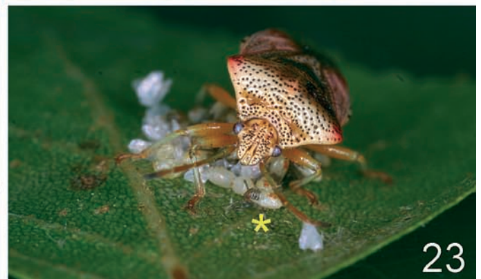
Figs 16-23: Female guarding behaviour of Elasmucha grisea (16) egg-clutch with 53 eggs (17-19) Different angles of view of a female guarding freshly hatched first instar nymphs. Note that the female remains in the same guarding position as the tarsi of all six legs remain in the same position. In case of disturbance, the female only tilts and shifts her body (20-23) A first instar nymph left the aggregation in front of the female. The female tilts her body, stretches with her left antenna to reach the nymph and pushes the nymph back to the aggregation (see yellow asterisk).