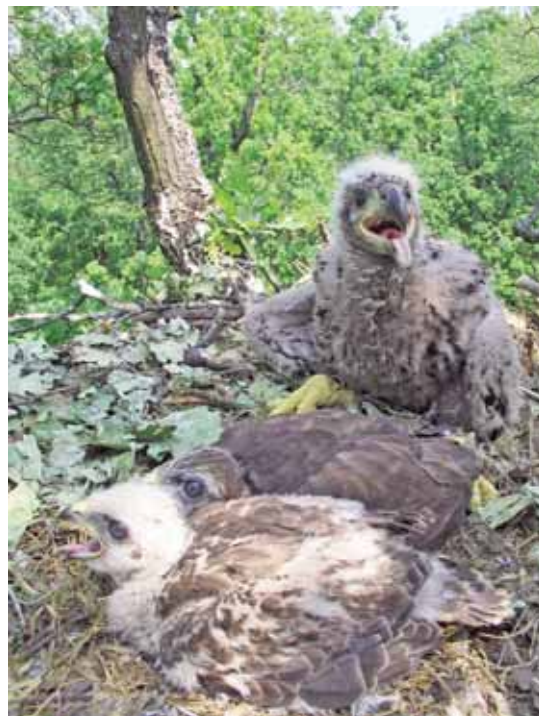
Fig. 3: Common Buzzard nestlings in a White-tailed Eagle nest. — Mäusebussard-Nestling in einem Seeadlerhorst.

the conservation programme that was launched in 1987 – breeding pairs have been successfully protected in increasing numbers. The breeding population started to increase, with the number of known territories reaching 41 in 1991. The results of the programme and the numbers of breeding pairs between 1987 and 1997 were summarised by HORVÁTH (1997). The number of known breeding pairs and the number of eagle territories in