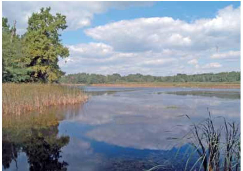
Fig. 7: Fishpond habitat (Photo: L. Fenyösi). — Fischteich-Habitat.

Northwestern Plain, Hortobágy and Békés county). Birds with Hungarian rings have been observed in Romania, Poland, Russia and Austria. Within our country, especially young birds tend to migrate mostly to the Hortobágy region.