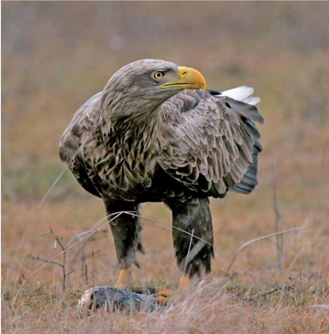
Fig. 8: Feeding in wintertime. — Winterfütterung.

case of pairs nesting in undisturbed localities, nesting can become unsuccessful even if minor disturbance is experienced. It is important that disturbance directly affecting the nest be avoided, and it is a basic principle in eagle protection that disturbing works are launched only after the completion of nesting, around the designated protection zone, and it should be advancing away from the nest and not the other way round. If conducted this way, the eagles arriving for the following season to occupy and renovate the nest will be able to see the changes, and if the surroundings of the nest are untouched, they will occupy the nest and start breeding (site-fidelity is very strong in well established pairs). In Hungary, tree felling can be done with a restriction of a circular zone around the nest of 100 m diameter, within which tree removal is prohibited throughout the year. During the nesting season, a circle of 300-400 m diameter is established, inside which tree removal and other forestry activities are allowed only after nesting has