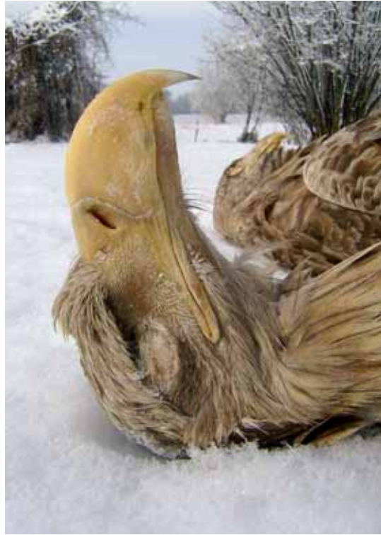
Fig. 2: A White-tailed Eagle poisoned by carbofuran. — Ein mit Carbofuran vergifteter Seeadler.

the conservation programme that was launched in 1987 – breeding pairs have been successfully protected in increasing numbers. The breeding population started to increase, with the number of known territories reaching 41 in 1991. The results of the programme and the numbers of breeding pairs between 1987 and 1997 were summarised by HORVÁTH (1997). The number of known breeding pairs and the number of eagle territories in