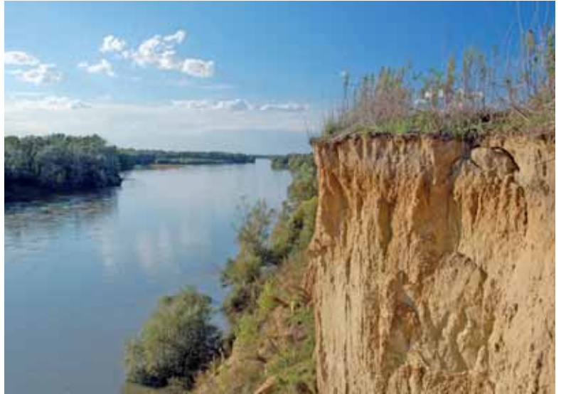
Fig. 6: A natural – undisturbed – section of the river Drava. — Ein natürlicher, ungestörter Flussabschnitt der Drau.

Plain uncoloured aluminium rings are used as year-code rings because when ringing was launched, it was unknown how many rings would be used annually. Based on experience from former years, the number of rings that has to be ordered can be determined, so unused year-code rings do not have to be discarded. As revealed by observation data of colour-ringed birds, the northern White-tailed Eagles arrive in Hungary mainly from Russia, Finland, Sweden and the Baltic states, to stay in the plain region areas of the country (areas of the