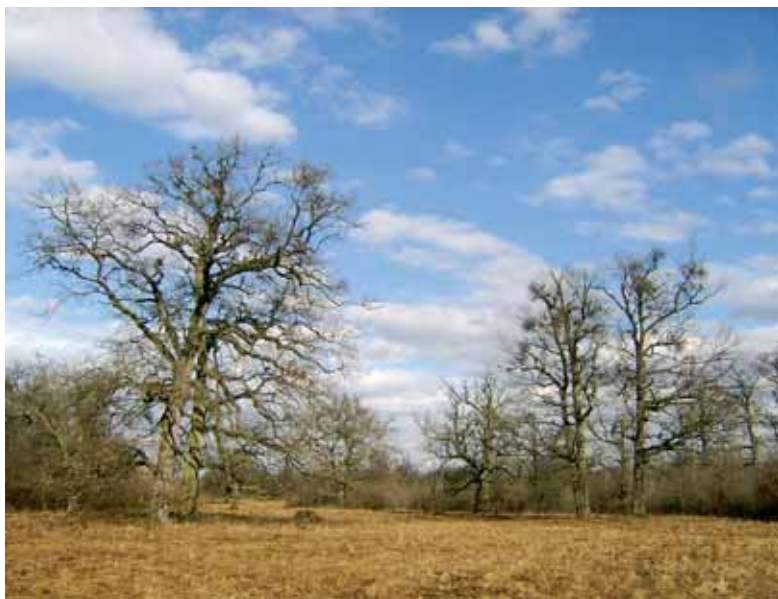
Fig. 4: Characteristic wooden pasture habitat in southern Hungary. — Charakteristisches Waldweide-Habitat in Südungarn.