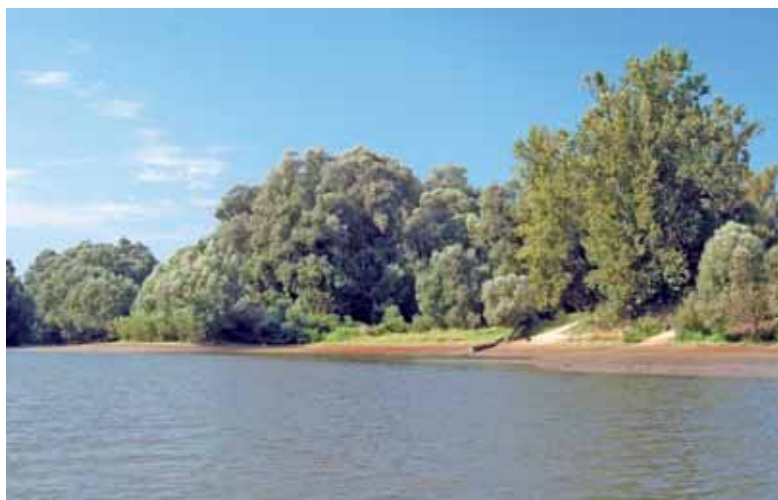
Fig. 5: The tributaries are very important feeding places for the White-tailed Eagle. — Die Nebenflüsse sind sehr wichtige Nahrungsplätze für den Seeadler.

1997 was 62 and 78, respectively. Based on information published by HORVÁTH et al. (2006), the number of known breeding pairs in 2004 was 133, and a total of 130 young birds left their nests from 85 successful broods. Then, the populations were reported to continue growing in 2005 (HORVÁTH et al. 2007), with the number of known breeding pairs, successful broods and fledged chicks being 141, 95 and 142, respectively.