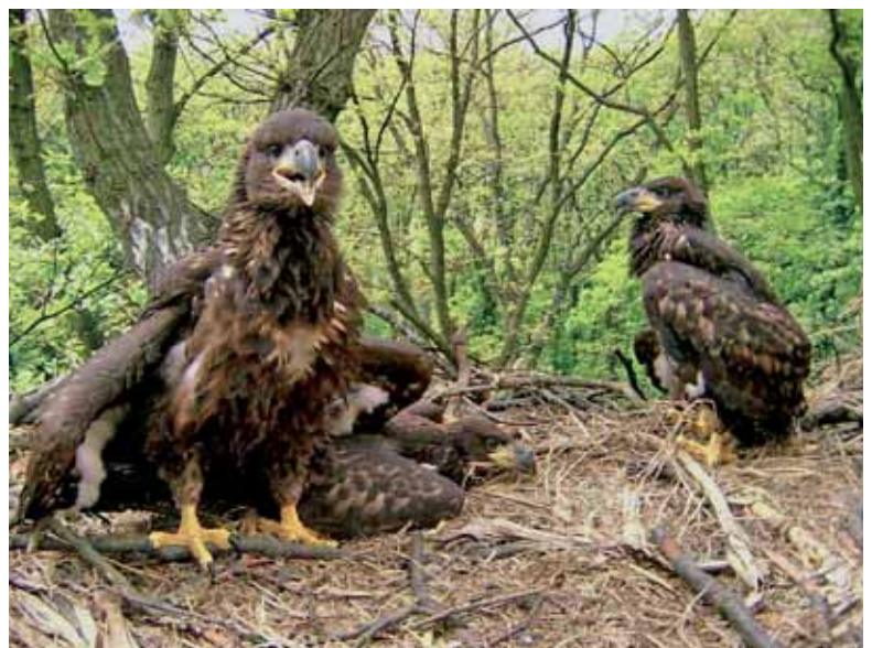
Fig. 9: A White-tailed Eagle nest with three nestlings. — Ein Seeadlerhorst mit drei Jungvögeln.

case of pairs nesting in undisturbed localities, nesting can become unsuccessful even if minor disturbance is experienced. It is important that disturbance directly affecting the nest be avoided, and it is a basic principle in eagle protection that disturbing works are launched only after the completion of nesting, around the designated protection zone, and it should be advancing away from the nest and not the other way round. If conducted this way, the eagles arriving for the following season to occupy and renovate the nest will be able to see the changes, and if the surroundings of the nest are untouched, they will occupy the nest and start breeding (site-fidelity is very strong in well established pairs). In Hungary, tree felling can be done with a restriction of a circular zone around the nest of 100 m diameter, within which tree removal is prohibited throughout the year. During the nesting season, a circle of 300-400 m diameter is established, inside which tree removal and other forestry activities are allowed only after nesting has