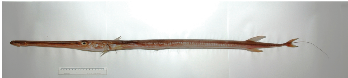
Fig. 3. Fistularia petimba Lacepède, 1803.

Fistularia tabacaria Linnaeus, 1758 – Cornetfish; Corneta-malhada, ②