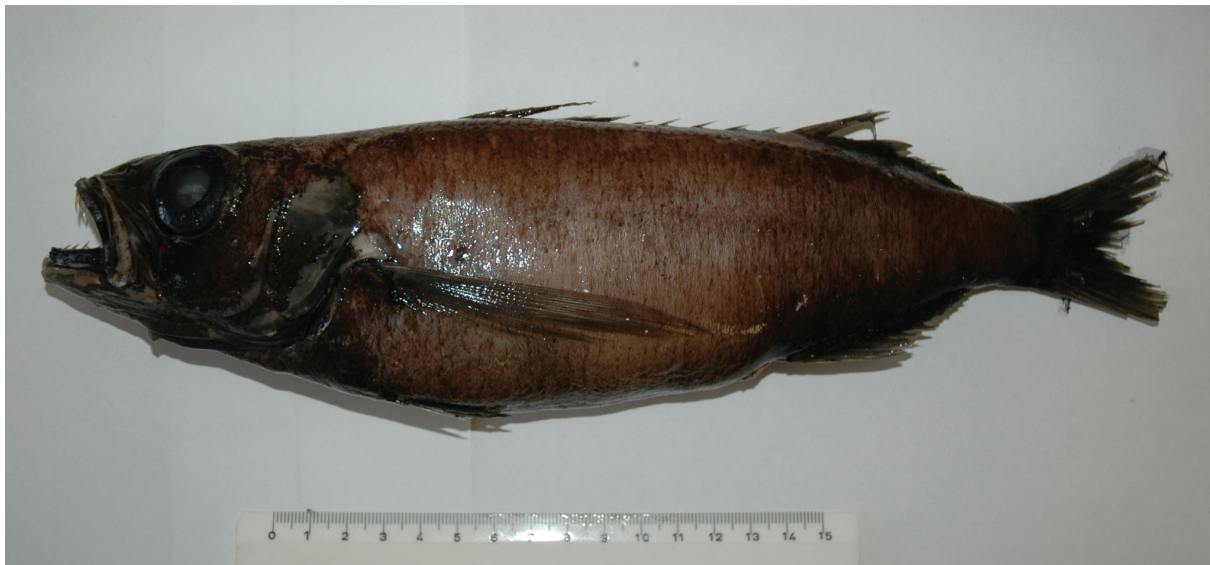
Fig. 4. Scombrobrax heterolepis Roule, 1921.

New record for Portuguese mainland waters; the first specimen of S. heterolepis (Fig. 4) was caught on the 15 th of November 2008 (300 mm TL and 375.63 g), using a bottom trawl (39°59.257’N, 10°3.025’W) and other specimens were collected in commercial fisheries in 2008 and 2009. Bold Systems Sample ID – MLFPI62, available on the Barcode of Life Data Systems (BOLD; www.barcodinglife.org , under the project titled “Fish of Portugal and Italy [MLFPI]”).