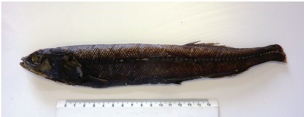
Fig. 2. Bajacalifornia megalops (Lütken, 1898).