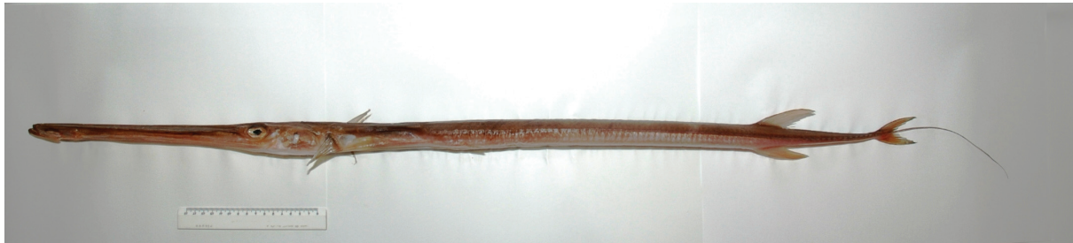
Fig. 3. Fistularia petimba Lacepède, 1803.

Fistularia tabacaria Linnaeus, 1758 – Cornetfish; Corneta-malhada, ②