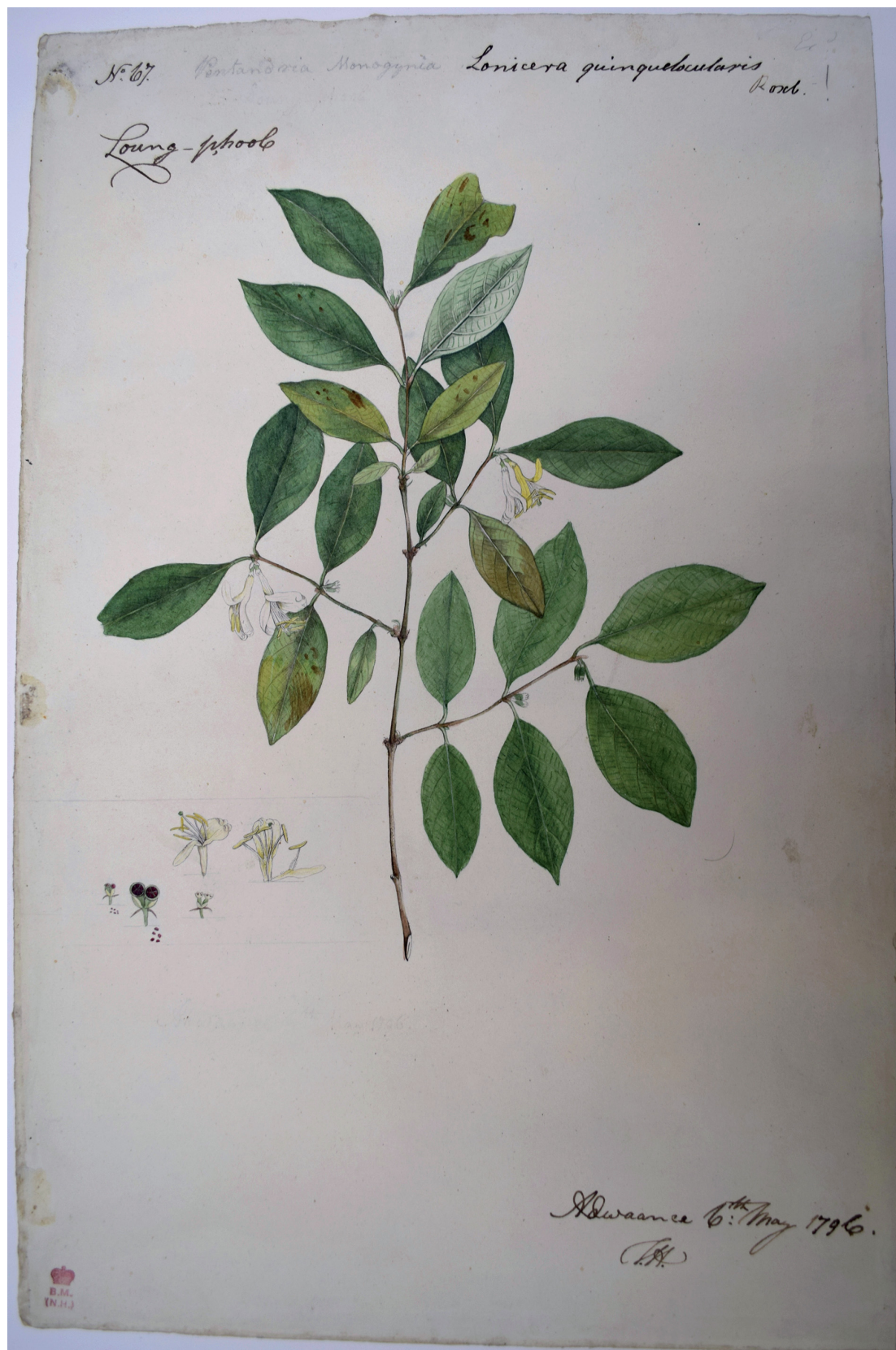
Fig. 3. Lectotype of Lonicera quiquelocularis Hardw., Hardwicke Drawing no. 67 from the collection of the Botany Library, Natural History Museum. © The Natural History Museum, London.