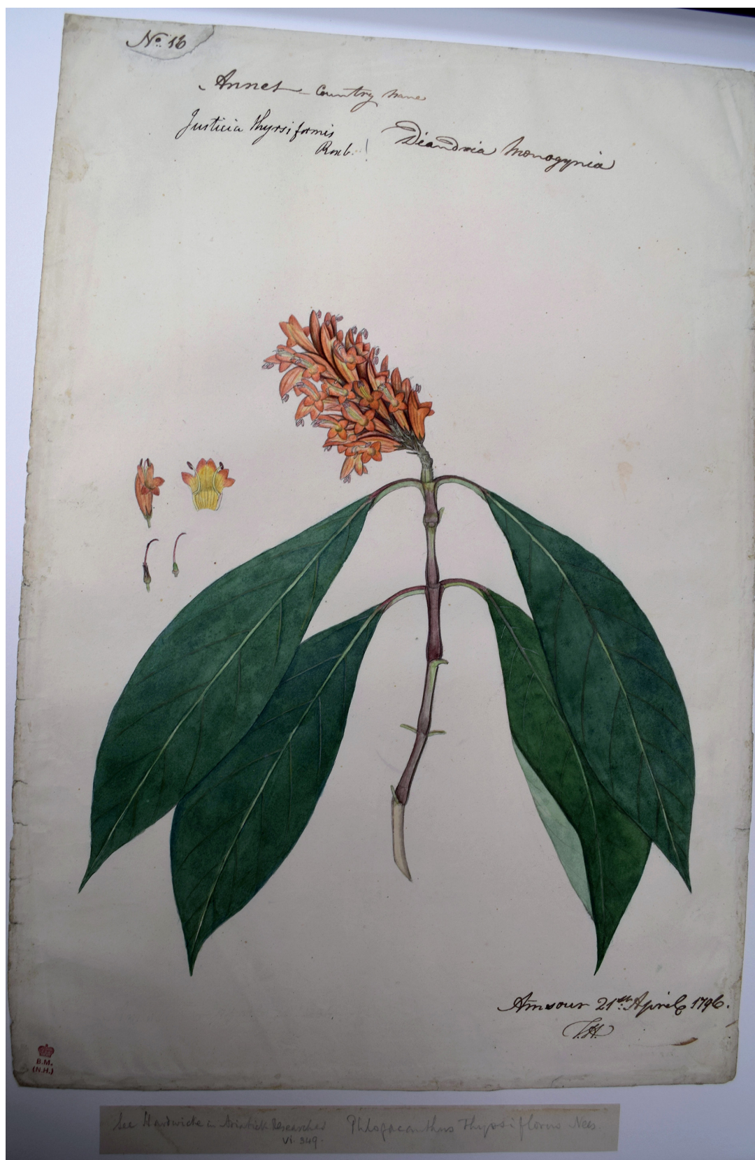
Fig. 1. Lectotype of Justicia thyrsoformis Roxb. ex Hardw., Hardwicke Drawing no. 16 from the collection of the Botany Library, Natural History Museum.