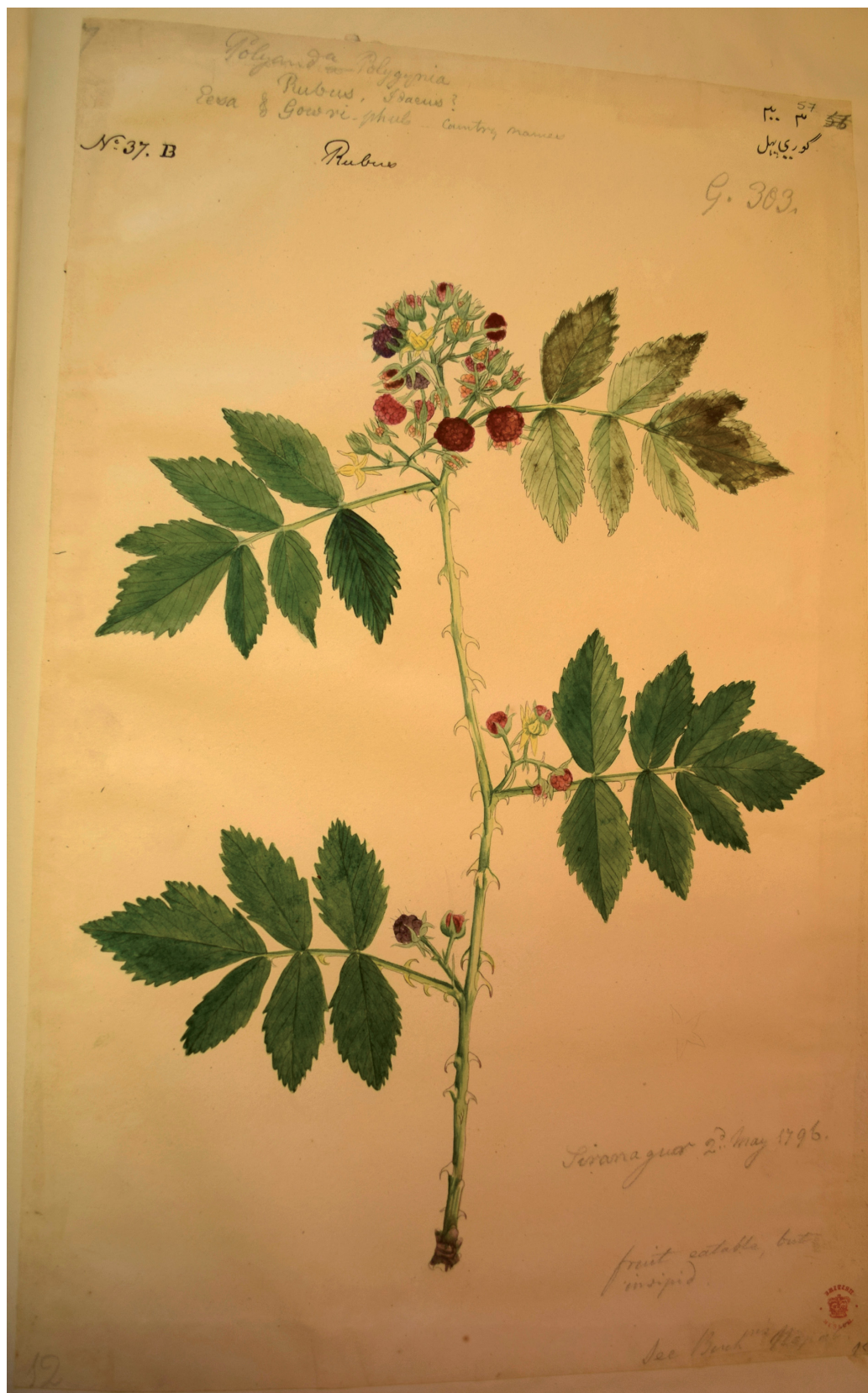
Fig. 9. Lectotype of Rubus rosiflorus Roxb., Hardwicke, Plants of India Vol. X (Add MS 11019): drawing no. 58.