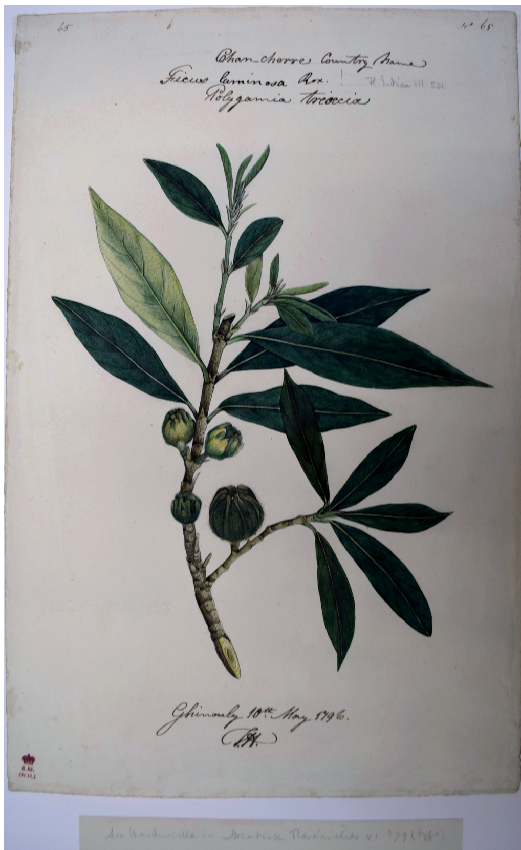
Fig. 5. Lectotype of Ficus laminosa Hardw., Hardwicke Drawing no. 65 from the collection of the Botany Library, Natural History Museum.