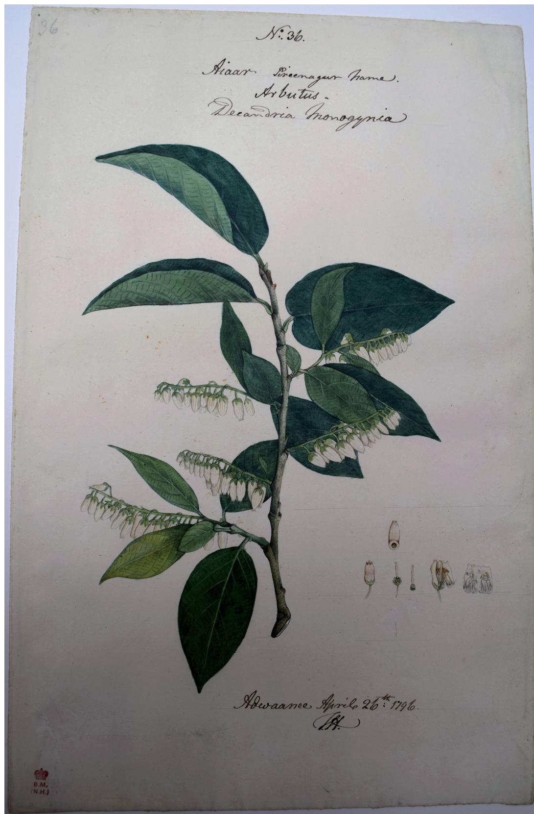
Fig. 8. Lectotype of Arbutus herpetica Coleb. ex Roxb., Hardwicke Drawing no. 36 from the collection of the Botany Library, Natural History Museum.