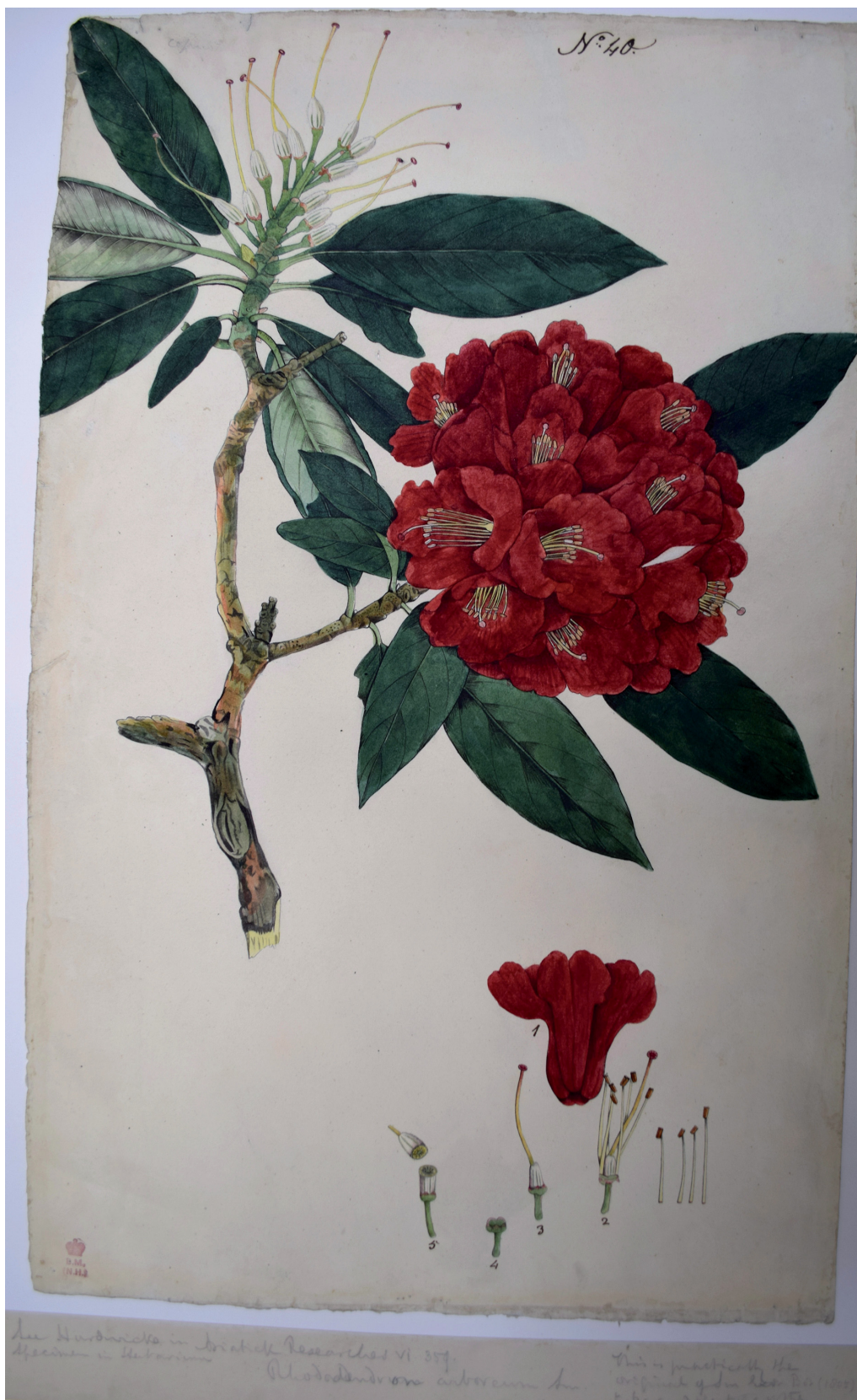
Fig. 6. Lectotype of Rhododendron arboreum Sm., Hardwicke Drawing no. 40 from the collection of the Botany Library, Natural History Museum.