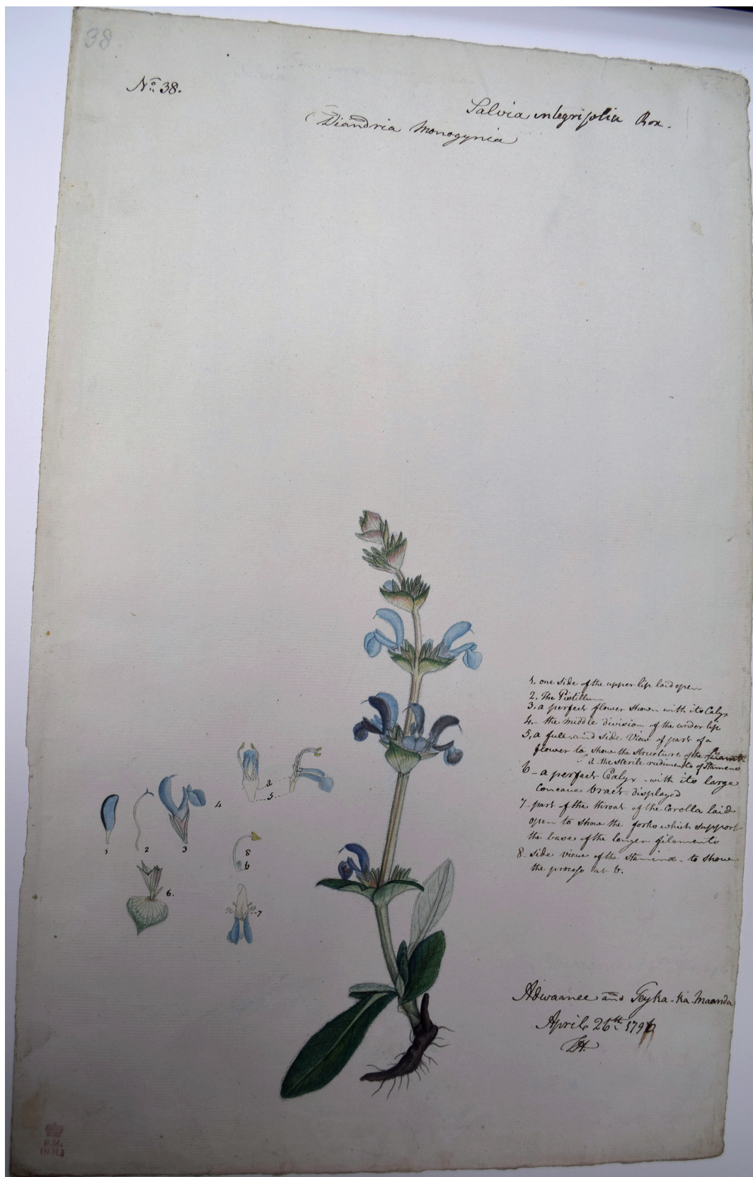
Fig. 2. Lectotype of Salvia integrifolia Roxb. ex Hardw., Hardwicke Drawing no. 38 from the collection of the Botany Library, Natural History Museum.