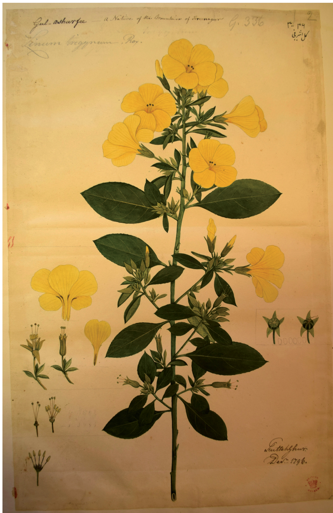
Fig. 4. Lectotype of Linum trigynum Roxb. ex Hardw., Hardwicke, Plants of India Vol. XVI (Add MS 11025): drawing no. 2.