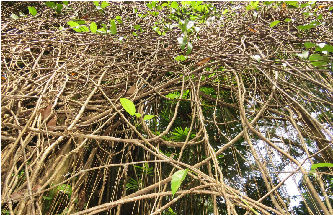
Fig. 6. Plant of Tinospora singapura I.M.Turner sp. nov. in Singapore showing stems and abundant aerial roots.