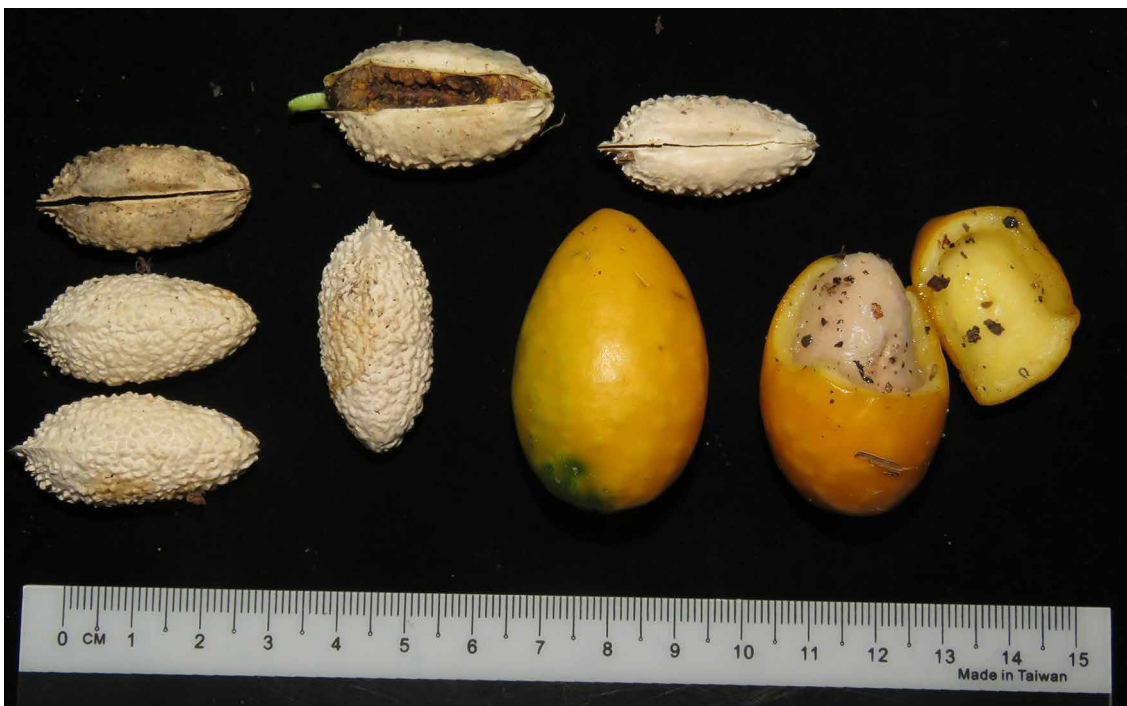
Fig. 7. Fallen fruits and endocarps of Tinospora singapura I.M.Turner sp. nov., with the seed germinating in one case.