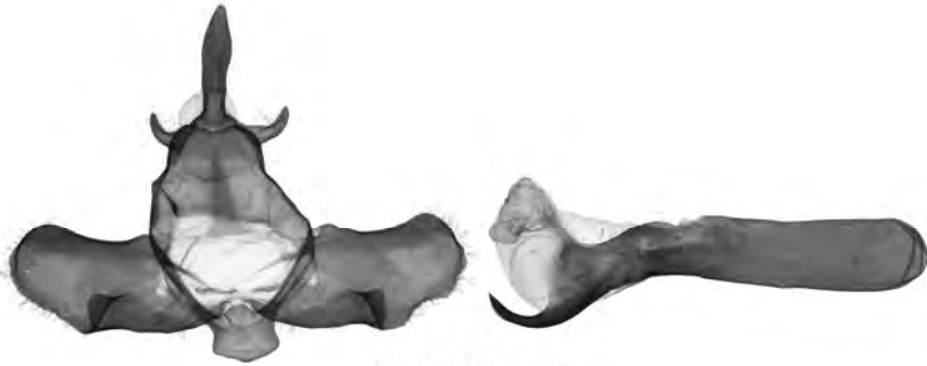
12. BJ2087, HT.