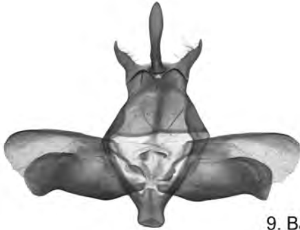
9. BJ2002, PT.