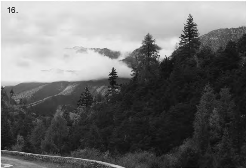
Figures 15–16. Biotopes. 15. China, W. Sichuan, near Xinbuqiao, Zhe Gu Shan pass, type locality of N. speideli severa ssp. n. (photo by Alessandro Floriani); 16. China, W. Sichuan, S. from Kangding, near Menghugang, type locality of N. speideli speideli sp. n. (photo by Alessandro Floriani).