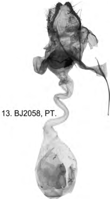
13. BJ2058, PT.