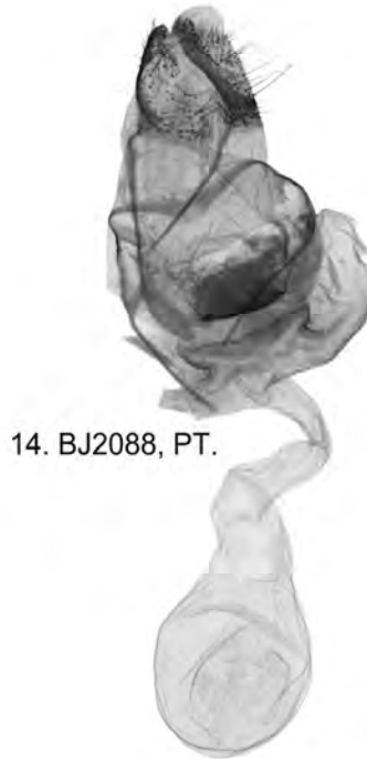
14. BJ2088, PT.

Figures 12–14. Nemacerota ssp. male and female genitalia. 12. N. speideli severa ssp. n., male, holotype, prep. BJ2087; 13. N. speideli speideli sp. n., female, paratype, prep. BJ2058; 14. N. speideli severa ssp. n., female, paratype, prep. BJ2088.