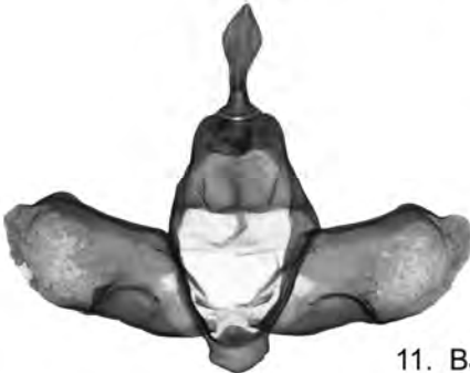
11. BJ2062, PT.